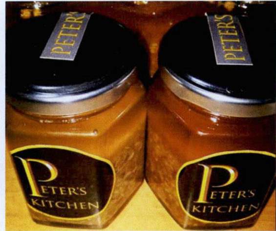
Figure 3. Unregistered PETER'S KITCHEN Chicken Pastil