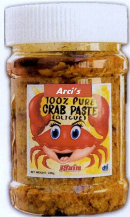
Figure 5. Unregistered ARCI'S 100% Pure Crab Paste