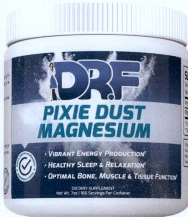
Figure 1. Unregistered DR.F Pixie Dust Magnesium Dietary Supplement

The Food and Drug Administration (FDA) warns all healthcare professionals and the general public NOT TO PURCHASE AND CONSUME the following unregistered food supplement and food products: