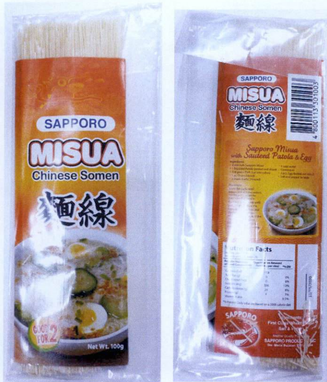
Figure 4. Unregistered SAPPORO Misua Chinese Somen