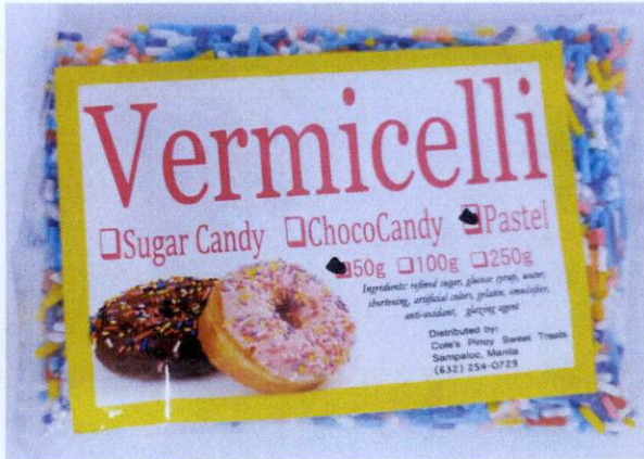
Figure 2. Unregistered VERMICELLI Pastel Candy