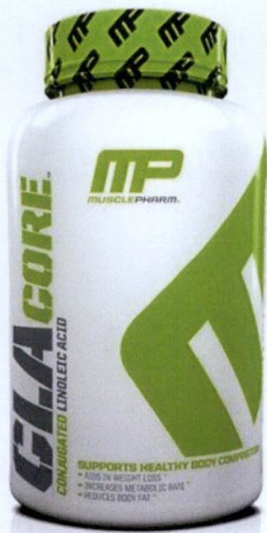
Figure 4. Unregistered CLACORE Conjugated Linoleic Acid Dietary Supplement