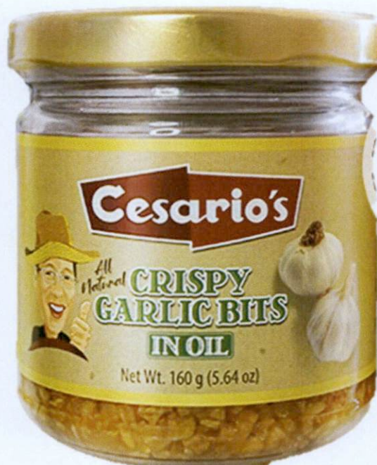
Figure 3. Unregistered CESARIO'S All Natural Crispy Garlic Bits in Oil