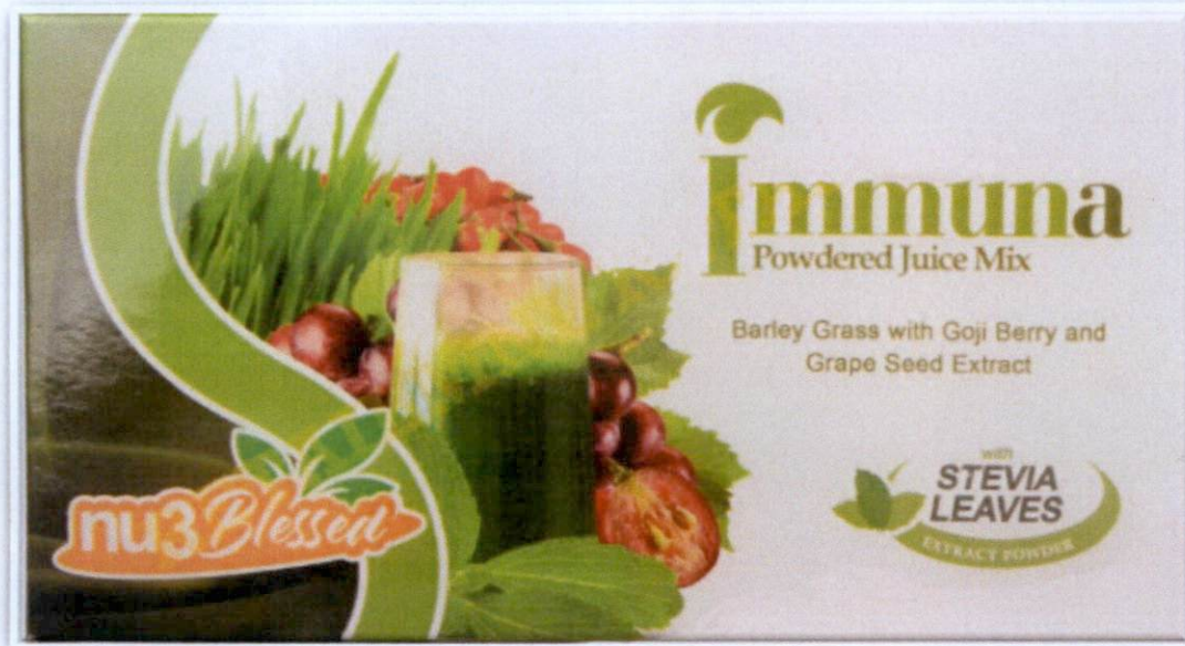
Figure 1. Unregistered IMMUNA Powdered Juice Mix Barley Grass with Goji Berry and Grape Seed Extract

The Food and Drug Administration (FDA) warns all healthcare professionals and the general public NOT TO PURCHASE AND CONSUME the following unregistered food products and food supplements: