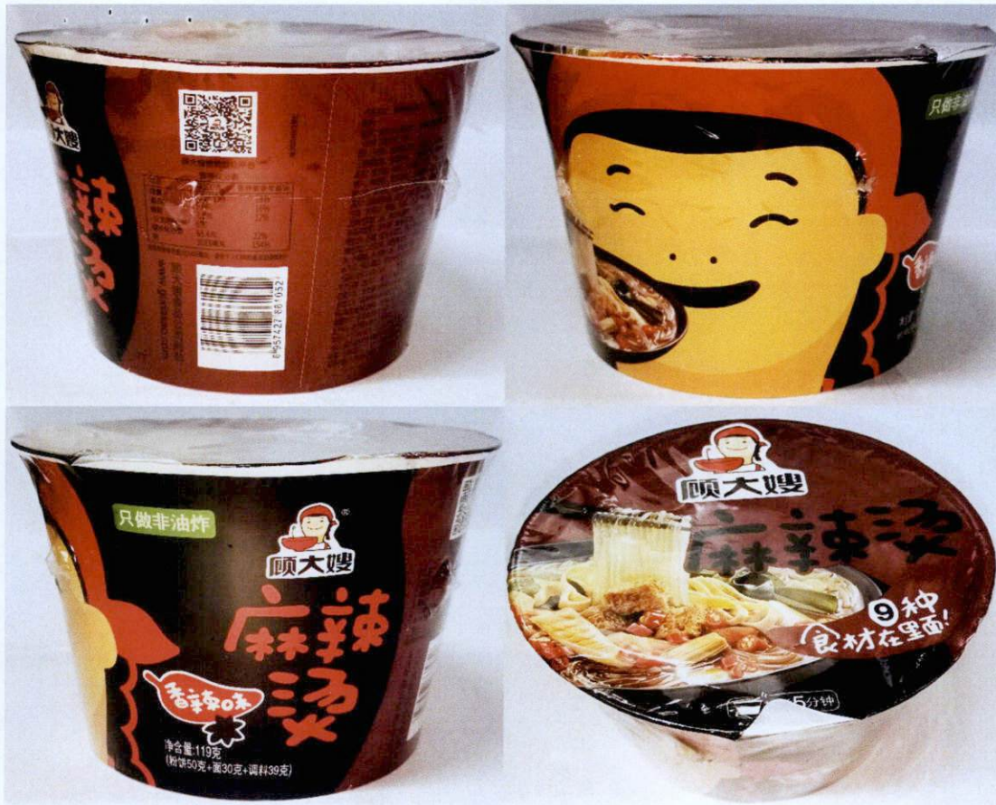
Figure 5. Unregistered Maroon and Black with Child Graphics Cup Noodles (Brand Name and Product Name in Foreign Character) BARCODE: 6957427661052

The FDA verified through post-marketing surveillance that the abovementioned food products are not registered and no corresponding Certificates of Product Registration (CPR) have been issued. Pursuant to the Republic Act No. 9711, otherwise known as the “Food and Drug Administration Act of 2009”, the manufacture, importation, exportation, sale, offering for sale, distribution, transfer, non-consumer use, promotion, advertising or sponsorship of health products without the proper authorization is prohibited.