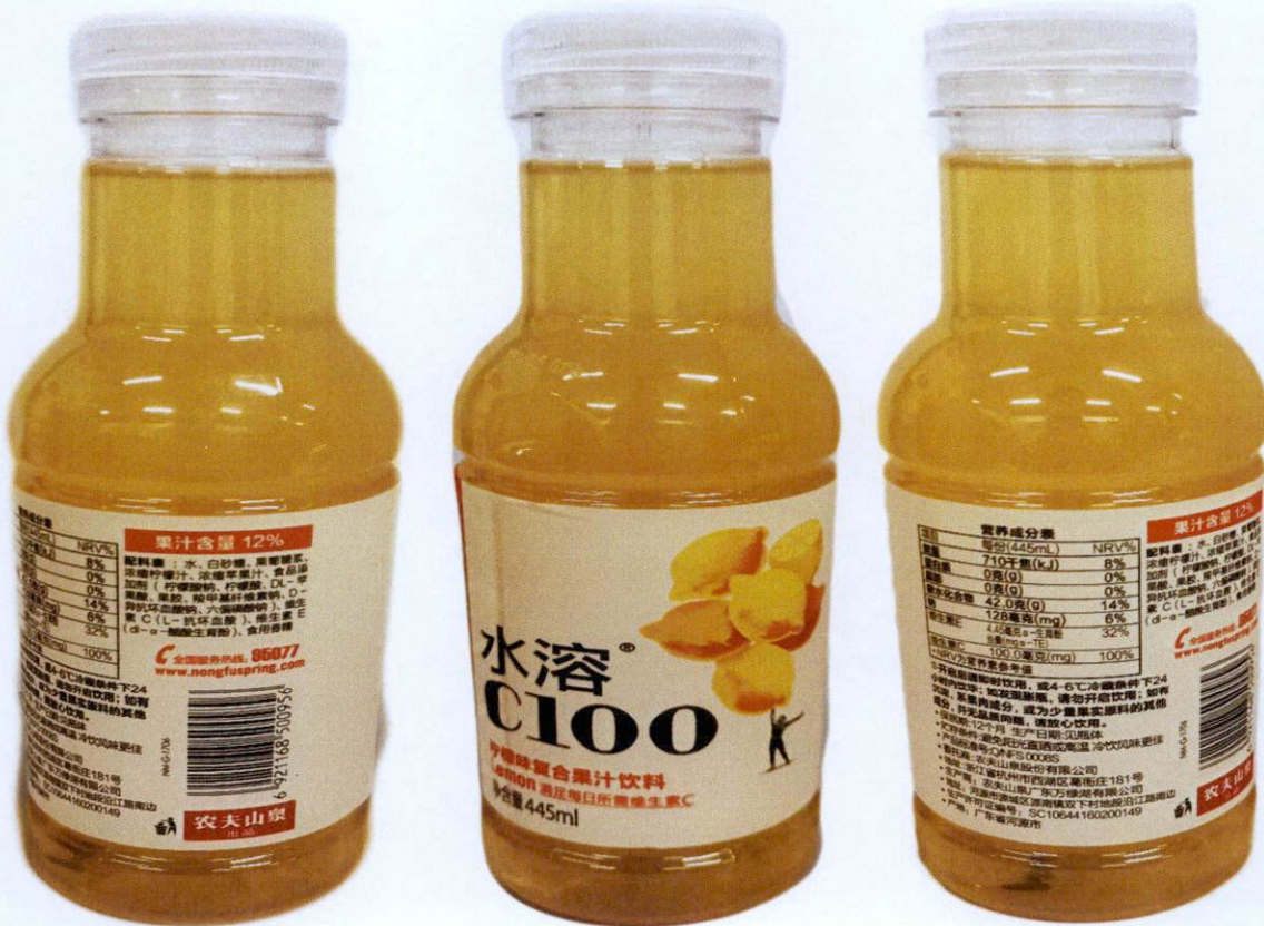
Figure 4. Unregistered C100, 445ml (Brand Name and Product Name in Foreign Character) BARCODE: 6921168500956