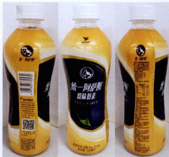
Figure 3. Unregistered UNI PRESIDENT Milk Tea Drink, 500, BARCODE: 6925303730574