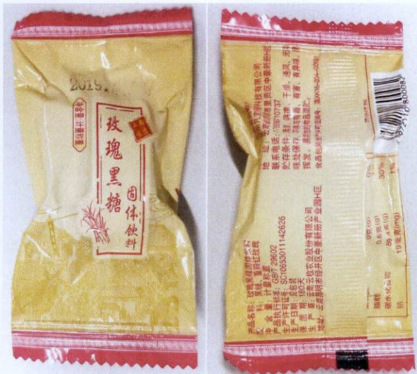
Figure 2. Unregistered Sachet with Pink Lining (Brand Name and Product Name in Foreign Character) BARCODE: 6972110800082