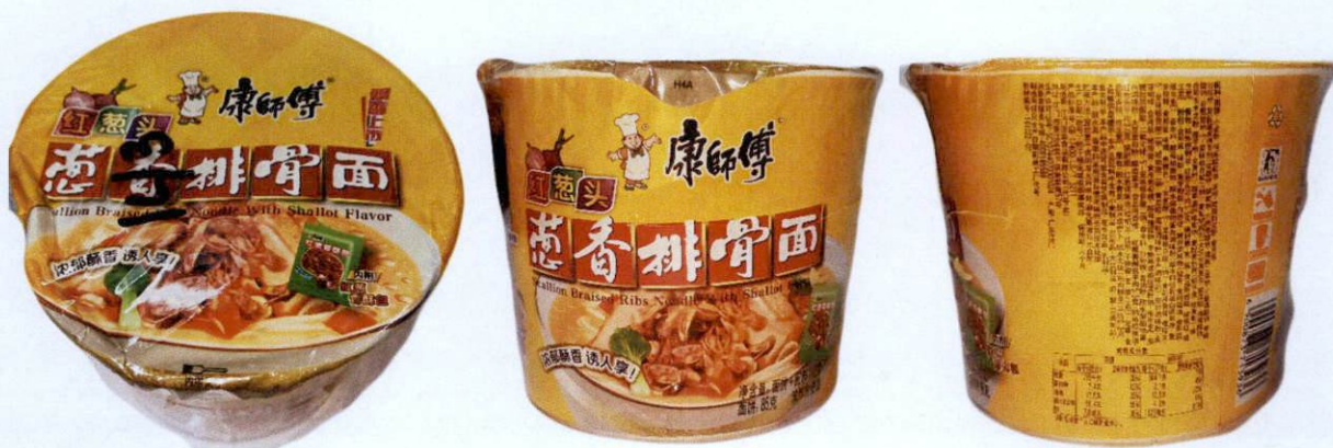
Figure 4. Unregistered Scallion Braised Ribs Noodle with Shallot Flavor (Brand Name in Foreign Character) Yellow Cup Noodles, 85g, BARCODE: 6900873713936