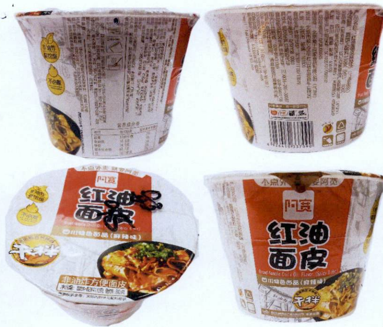
Figure 2. Unregistered Broad Noodle Chili Oil Flavor, Spicy and Hot (Brand name in Foreign Character), BARCODE: 6926410337090