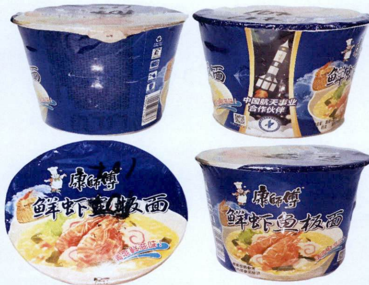
Figure 1. Unregistered Blue Colored Cup Noodles with image of Space Rocket, BARCODE: 6900873714636

The Food and Drug Administration (FDA) warns all healthcare professionals and the general public NOT TO PURCHASE AND CONSUME the following unregistered food products: