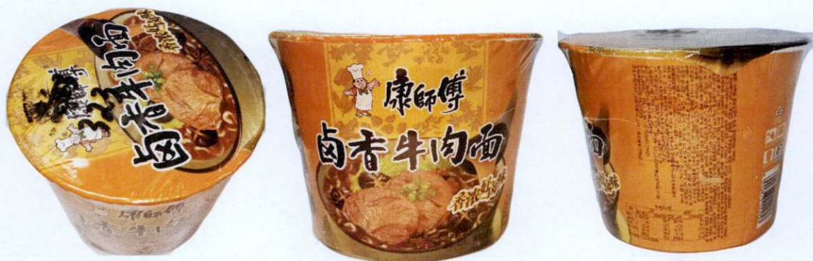
Figure 3. Unregistered Orange and Yellow Colored Cup Noodles (Brand Name and Product Name in Foreign Character), BARCODE: 6900873022953