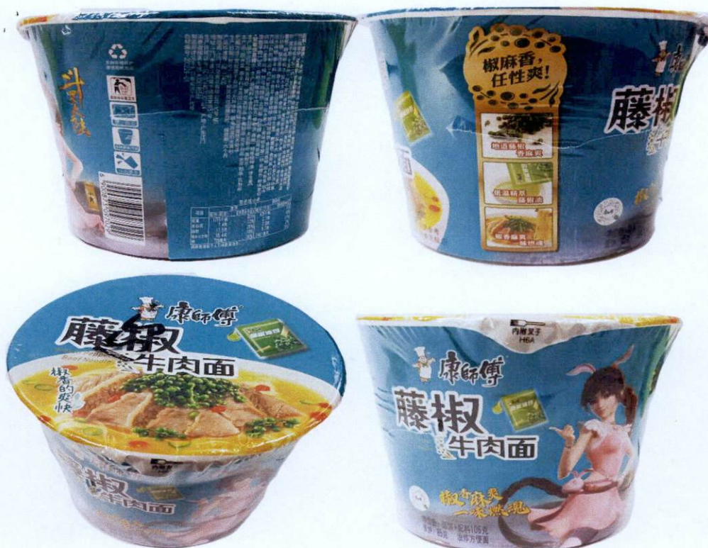
Figure 5. Unregistered Rattan Pepper Beef Noodle (Brand Name in Foreign Character) Blue Green Cup, BARCODE: 6900873097029

The FDA verified through post-marketing surveillance that the abovementioned food products are not registered and no corresponding Certificates of Product Registration (CPR) have been issued. Pursuant to the Republic Act No. 9711, otherwise known as the “Food and Drug Administration Act of 2009”, the manufacture, importation, exportation, sale, offering for sale, distribution, transfer, non-consumer use, promotion, advertising or sponsorship of health products without the proper authorization is prohibited.