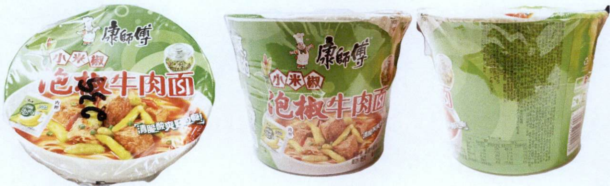
Figure 3. Unregistered Xiannina Pickled Pepper Beef Noodle (Brand Name in Foreign Character) Green Cup Noodles, BARCODE: 6900873002177