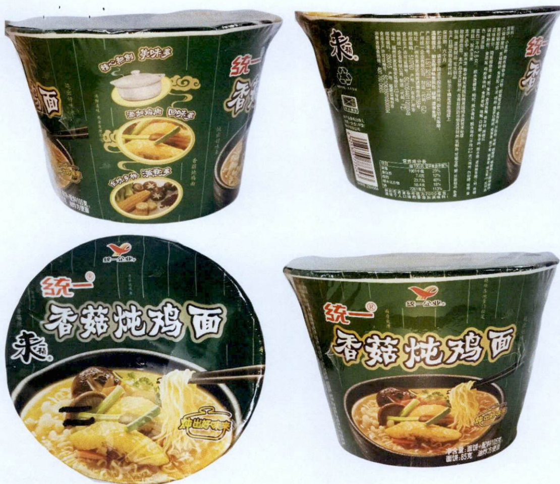
Figure 5. Unregistered UNI PRESIDENT (Product Name in Foreign Character) BARCODE: 6925303773243

The FDA verified through post-marketing surveillance that the abovementioned food products are not registered and no corresponding Certificates of Product Registration (CPR) have been issued. Pursuant to the Republic Act No. 9711, otherwise known as the “Food and Drug Administration Act of 2009”, the manufacture, importation, exportation, sale, offering for sale, distribution, transfer, non-consumer use, promotion, advertising or sponsorship of health products without the proper authorization is prohibited.