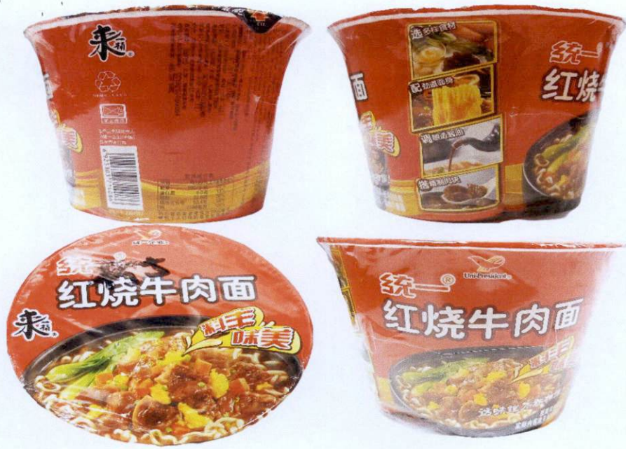
Figure 2. Unregistered UNI PRESIDENT (Product Name in Foreign Character) Red Cup Noodles, BARCODE: 6925303714086