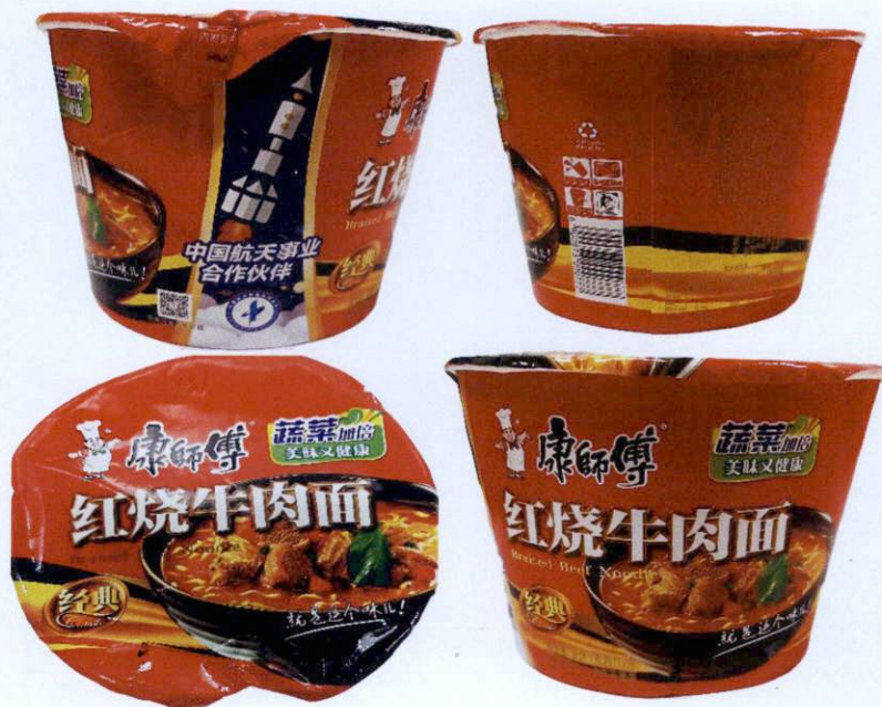
Figure 1. Unregistered Braised Beef Noodle (Brand Name in Foreign Character) BARCODE: 6900873000777

The Food and Drug Administration (FDA) warns all healthcare professionals and the general public NOT TO PURCHASE AND CONSUME the following unregistered food products: