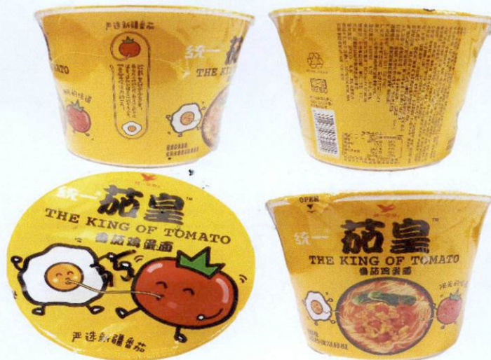
Figure 4. Unregistered UNI PRESIDENT The King of Tomato