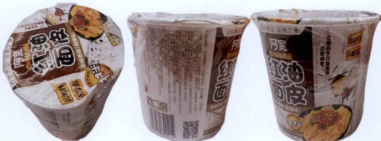
Figure 3. Unregistered White Brown Cup Noodles (Brand Name and Product Name in Foreign Character) BARCODE: 6926410320214