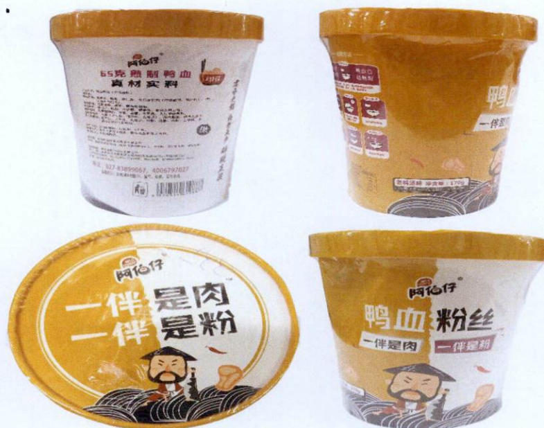
Figure 5. Unregistered White and Yellow Cup Noodle (Brand and Product Name in Foreign Character), 170g, BARCODE: 6970514610887

The FDA verified through post-marketing surveillance that the abovementioned food products are not registered and no corresponding Certificates of Product Registration (CPR) have been issued. Pursuant to the Republic Act No. 9711, otherwise known as the “Food and Drug Administration Act of 2009”, the manufacture, importation, exportation, sale, offering for sale, distribution, transfer, non-consumer use, promotion, advertising or sponsorship of health products without the proper authorization is prohibited.