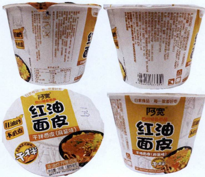
Figure 1. Unregistered White and Yellow Cup Noodles (Brand Name and Product Name in Foreign Character) BARCODE: 6926410337250

The Food and Drug Administration (FDA) warns all healthcare professionals and the general public NOT TO PURCHASE AND CONSUME the following unregistered food products: