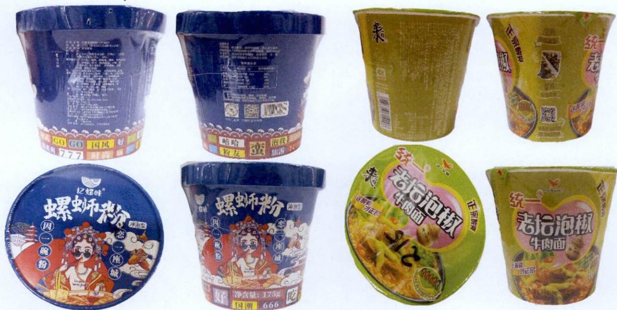
Figure 2. Unregistered Liv Zhou Lou Si Fen Blue Cup Noodles (Brand Name and Product Name in Foreign Character) BARCODE: 6970075970836