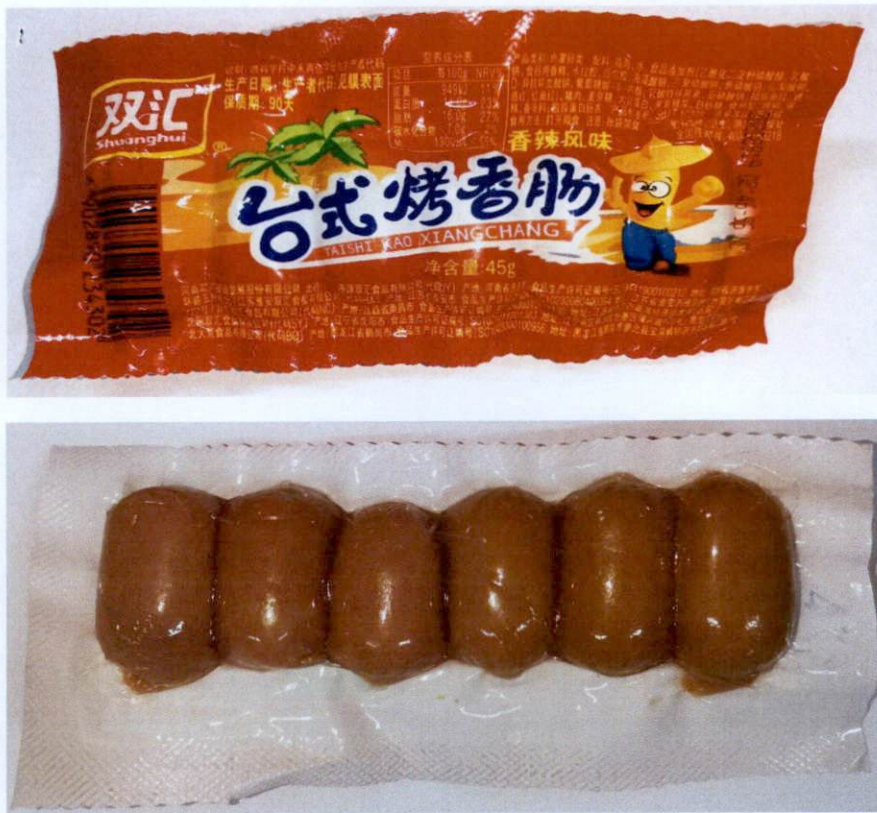
Figure 4. Unregistered SHUANGHUI TAISHI KAO XIANCHANG Sausage in Red Vacuum Sealed Packaging (In Foreign language)