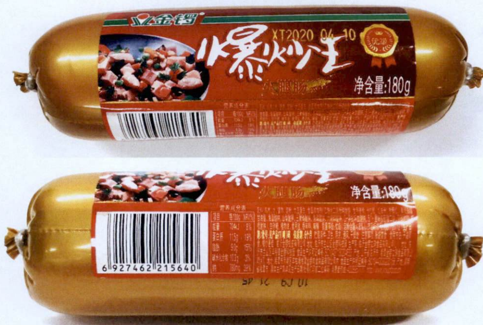
Figure 5. Unregistered Sausage Wrapped in Gold Packaging (In Foreign Language)