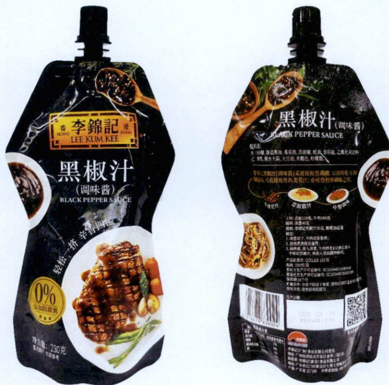
Figure 3. Unregistered LEE KUM KEE Black Pepper Sauce in Black Doy Pack (In Foreign Language)