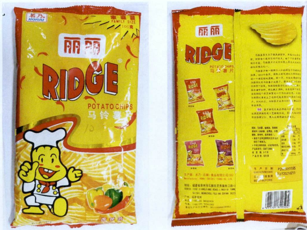
Figure 2. Unregistered HONAI RIDGE Potato Chips – Family Size (In Foreign Language)