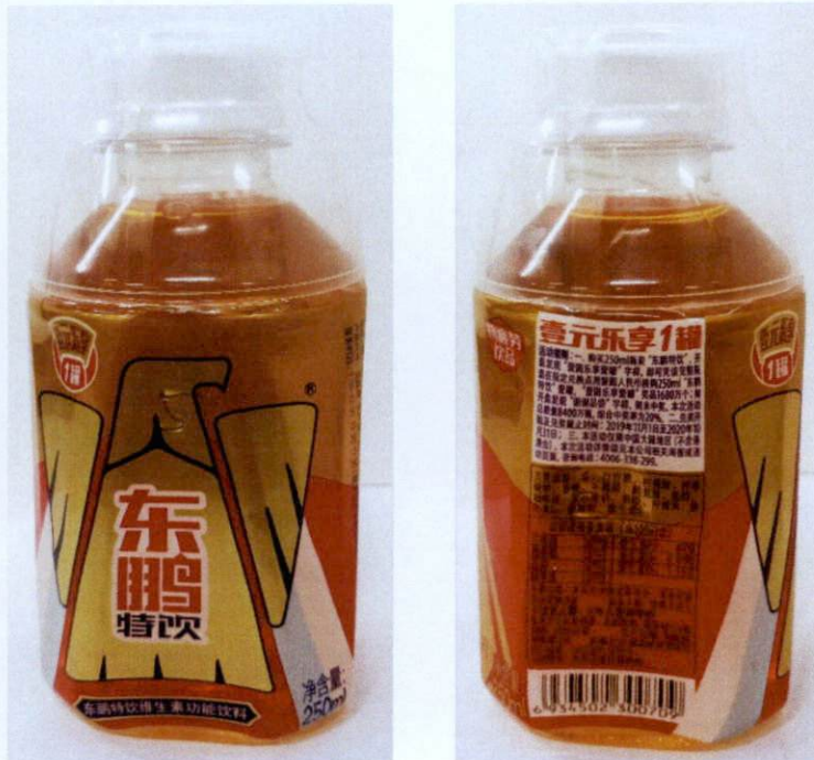
Figure 1. Unregistered Liquid Drink with Eagle Image in PET Bottle (In Foreign Language)

The Food and Drug Administration (FDA) warns all healthcare professionals and the general public NOT TO PURCHASE AND CONSUME the following unregistered food products: