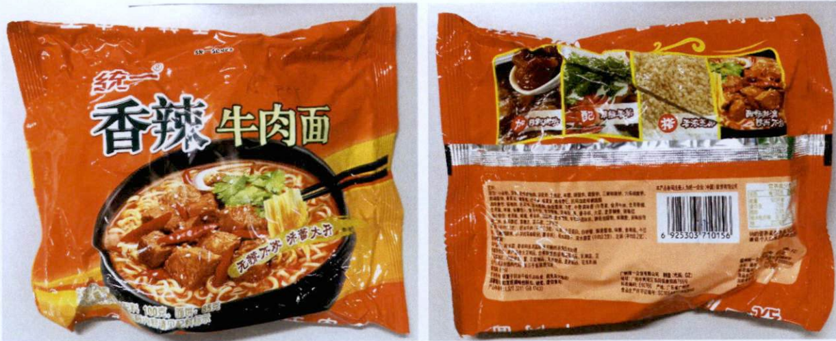
Figure 2. Unregistered Instant Noodles with Beef and Chili Image in Orange Foil Packaging (In Foreign Language)