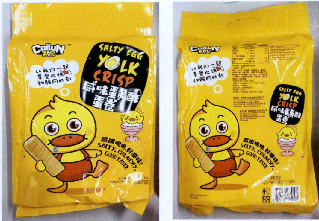
Figure 3. Unregistered CAILUN Salty Egg Yolk Crisp in Yellow Foil Packaging (In Foreign Language)