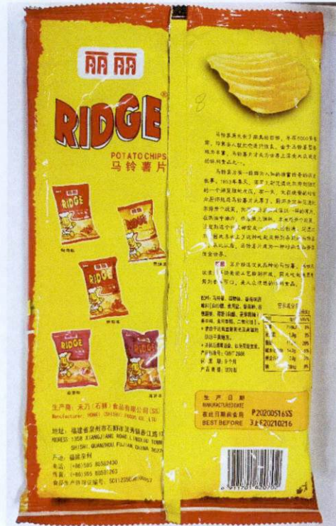
Figure 5. Unregistered HONAI RIDGE Potato Chips – Family Size In Red and Yellow Packaging With Tomato Image (In Foreign Language)