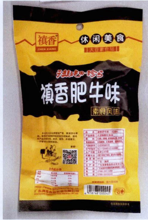
Figure 4. Unregistered ZHEN XIANG FEI NUI Preserved Meat in Yellow Packaging with Black and Red Design (In Foreign Language)