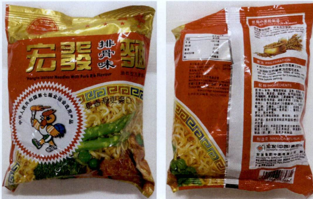
Figure 1. Unregistered HONGFA Instant Noodles with Pork Rib Flavor In PET Foil Packaging (In Foreign Language)

The Food and Drug Administration (FDA) warns all healthcare professionals and the general public NOT TO PURCHASE AND CONSUME the following unregistered food products: