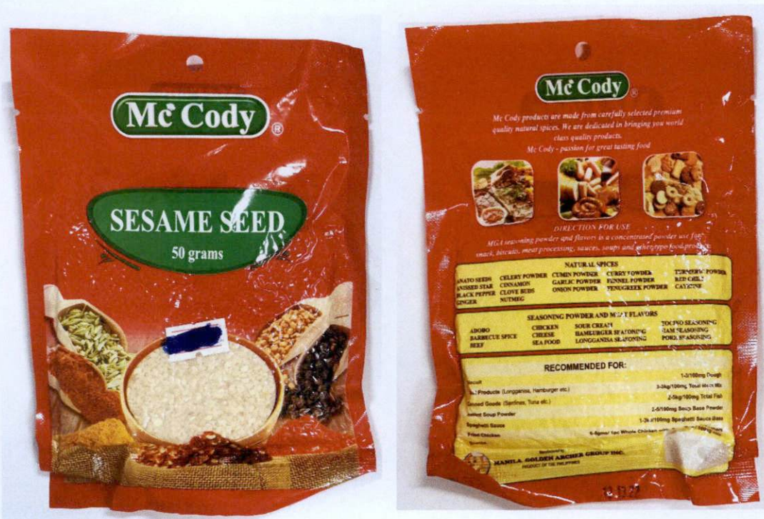
Figure 5. Unregistered MC CODY Sesame Seeds, 50g

The FDA verified through post-marketing surveillance that the abovementioned food products are not registered and no corresponding Certificates of Product Registration (CPR) have been