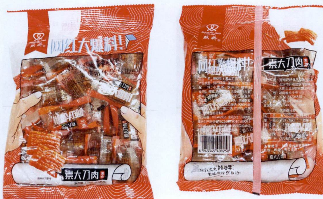
Figure 3. Unregistered SHUANG JIAO Spicy Snack in Clear Packaging with Red Design (In Foreign Language)