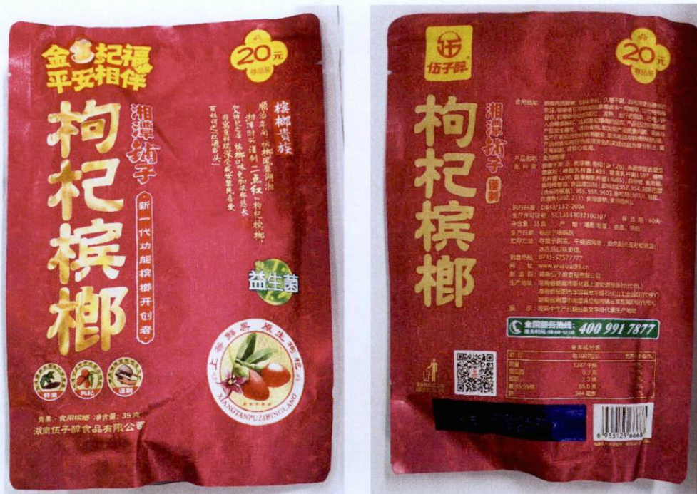
Figure 2. Unregistered XIANTANPUZIBINLANG Nuts in Glittery Pink Packaging (In Foreign Language)