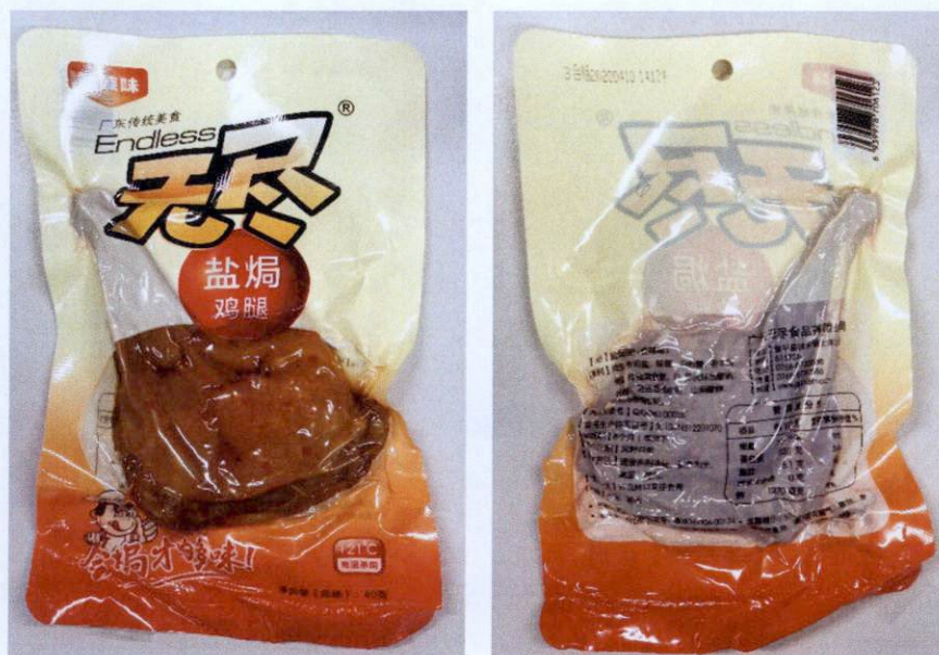
Figure 1. Unregistered ENDLESS Preserved Chicken Leg in White and Orange Vacuum Sealed Packaging (In Foreign Language)

The Food and Drug Administration (FDA) warns all healthcare professionals and the general public NOT TO PURCHASE AND CONSUME the following unregistered food products: