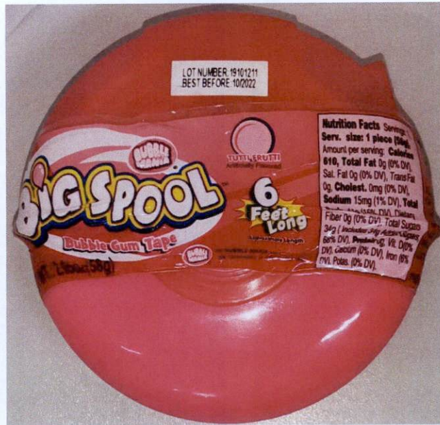
Figure 4. Unregistered BUBBLE MANIA Bubblegum Spool Gum Tape – Tutti Frutti Artificially Flavored, 58g