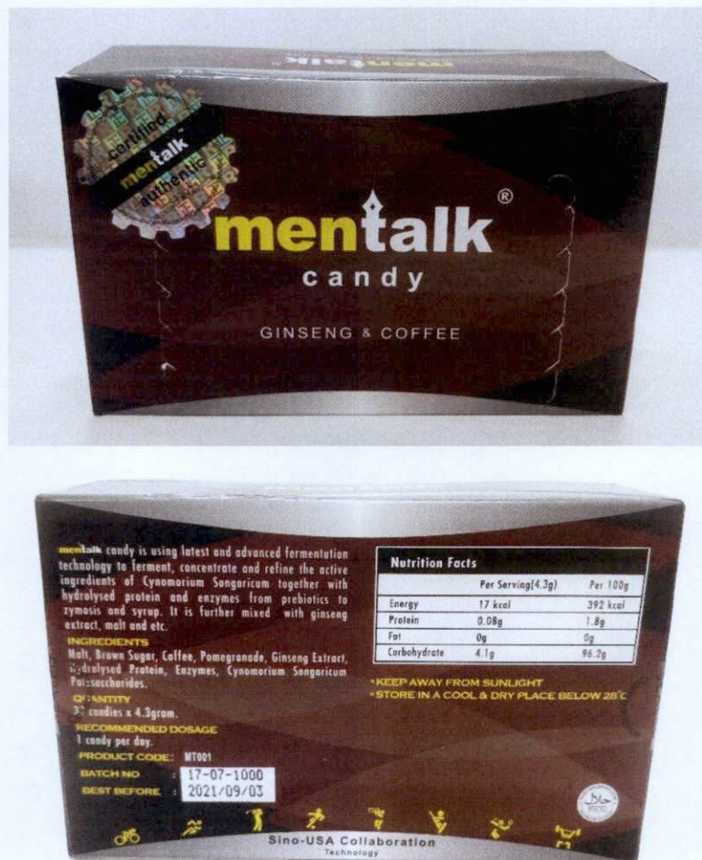
Figure 5. Unregistered MENTALK Ginseng and Coffee Candy