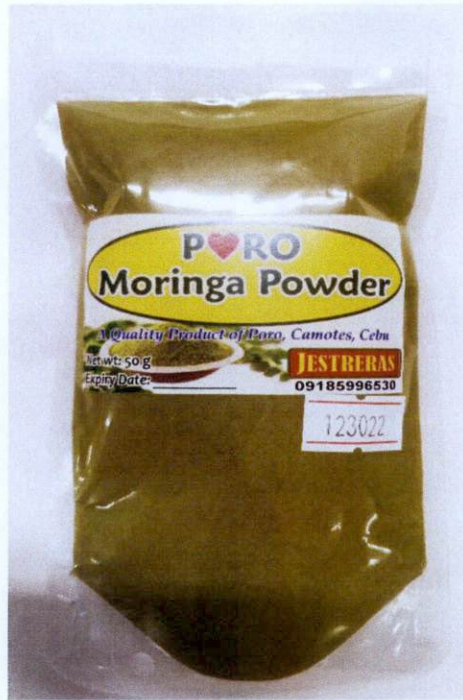
Figure 2. Unregistered PORO Moringa Powder, 50g