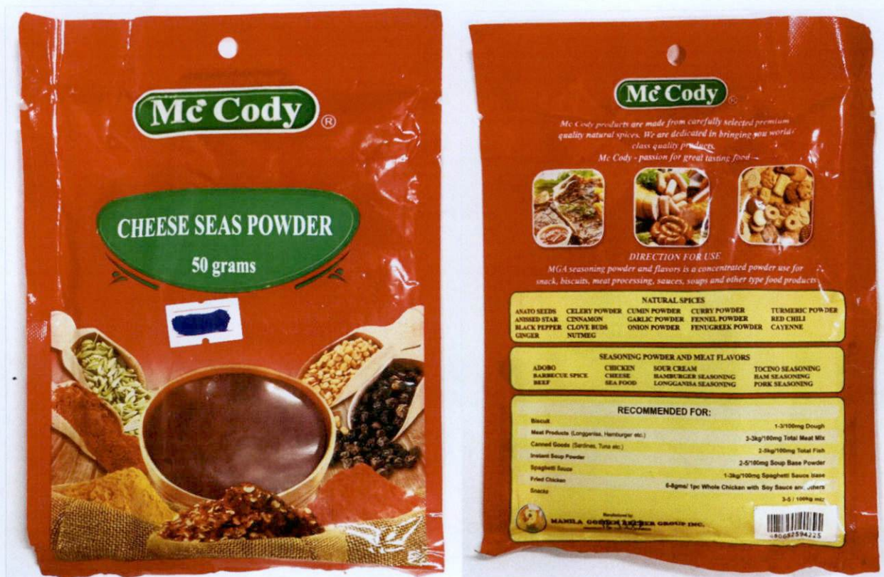
Figure 1. Unregistered MC CODY Cheese Seas Powder, 50g

The Food and Drug Administration (FDA) warns all healthcare professionals and the general public NOT TO PURCHASE AND CONSUME the following unregistered food products: