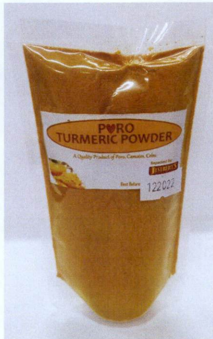
Figure 4. Unregistered PORO Turmeric Powder, 50g