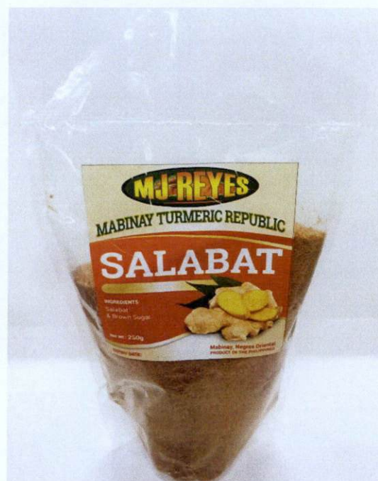
Figure 3. Unregistered MJ REYES MABINAY TURMERIC REPUBLIC Salabat, 250g