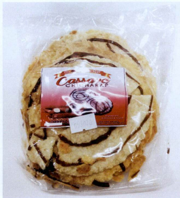
Figure 3. Unregistered ROSITA'S Cassava Chicharap