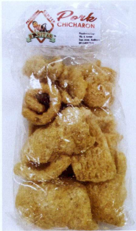
Figure 4. Unregistered ROSITA'S PASALUBONG CENTER Pork Chicharon