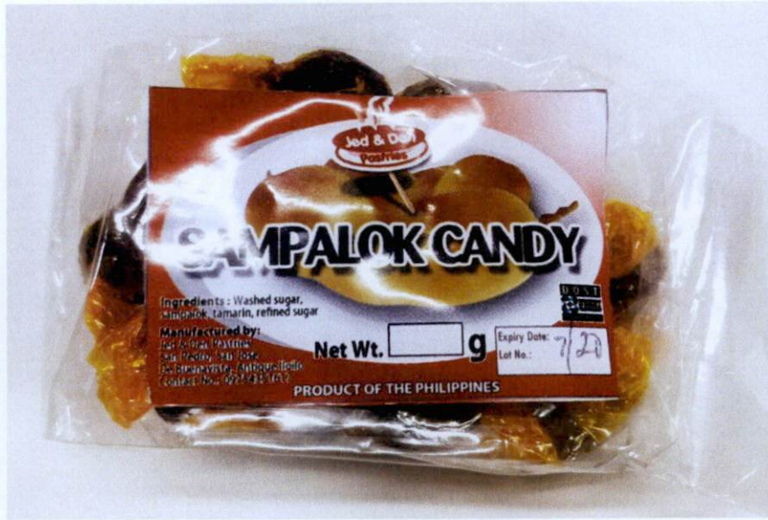
Figure 2. Unregistered JED & DEN Sampalok Candy