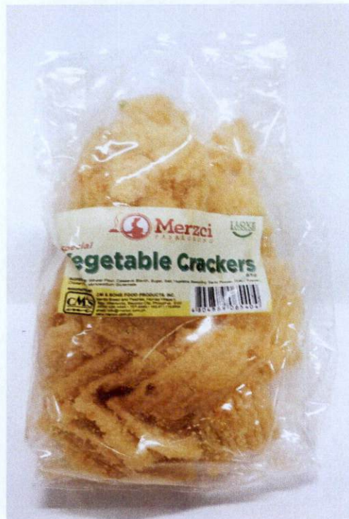
Figure 5. Unregistered MERZCI PASALUBONG Vegetables Crackers