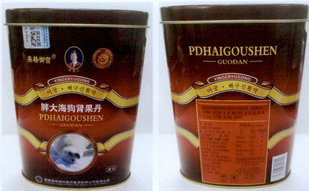
Figure 1. Unregistered YINGERYUGONG PDHAIGOUSHEN GUODAN (In Foreign Language)

The Food and Drug Administration (FDA) warns all healthcare professionals and the general public NOT TO PURCHASE AND CONSUME the following unregistered food products: