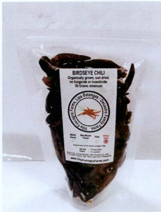
Figure 2. Unregistered VILLA FUSCAGNA FARM / DECASTRO FAMILY FARMS Birds Eye Chili – Very Hot