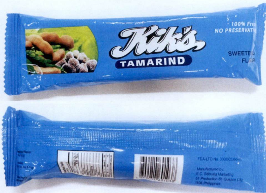
Figure 3. Unregistered KIK'S Tamarind Sweetened Flavor