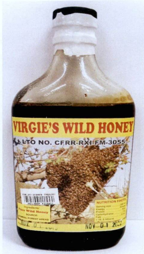
Figure 4. Unregistered VIRGIE'S Wild Honey