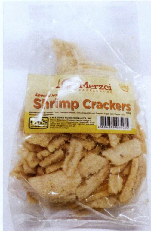
Figure 1. Unregistered MERZCI PASALUBONG Shrimp Crackers

The Food and Drug Administration (FDA) warns all healthcare professionals and the general public NOT TO PURCHASE AND CONSUME the following unregistered food products: