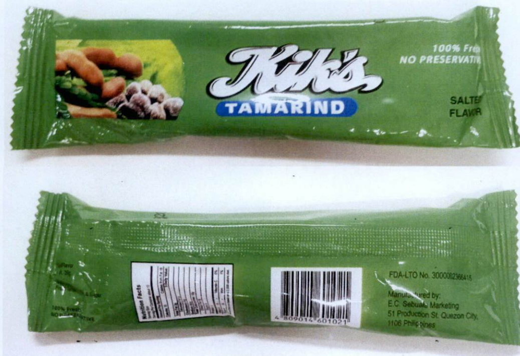
Figure 5. Unregistered KIK'S Tamarind Salted Flavor