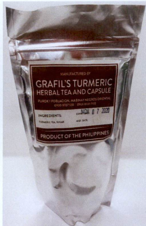
Figure 5. Unregistered GRAFIL Turmeric Herbal Tea