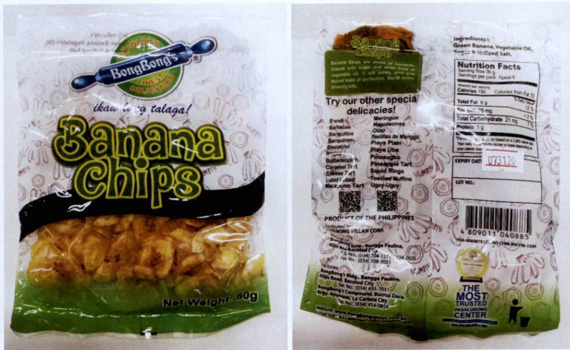
Figure 3. Unregistered BONGBONG'S BACOLOD'S FINEST DELICACIES Banana Chips