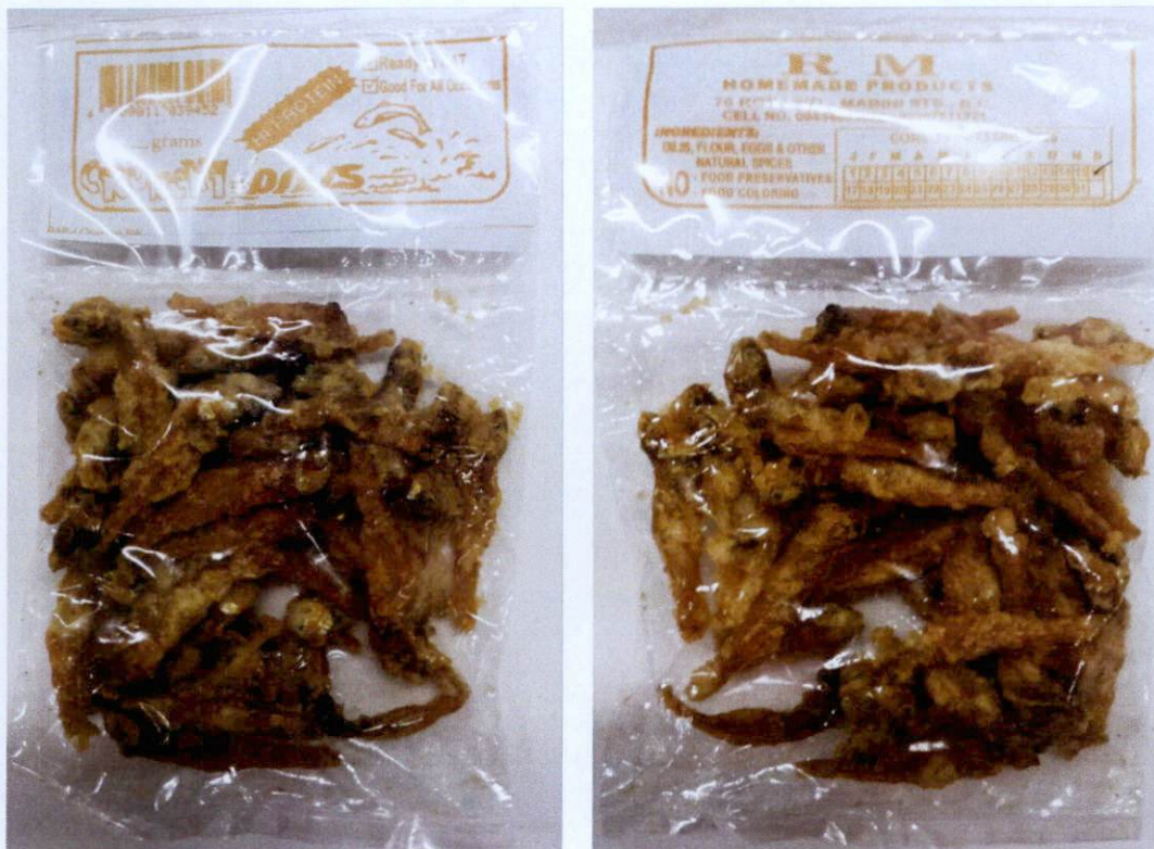
Figure 1. Unregistered RM HOMEMADE PRODUCTS Hi-Protein Crunchy Dilis

The Food and Drug Administration (FDA) warns all healthcare professionals and the general public NOT TO PURCHASE AND CONSUME the following unregistered food products: