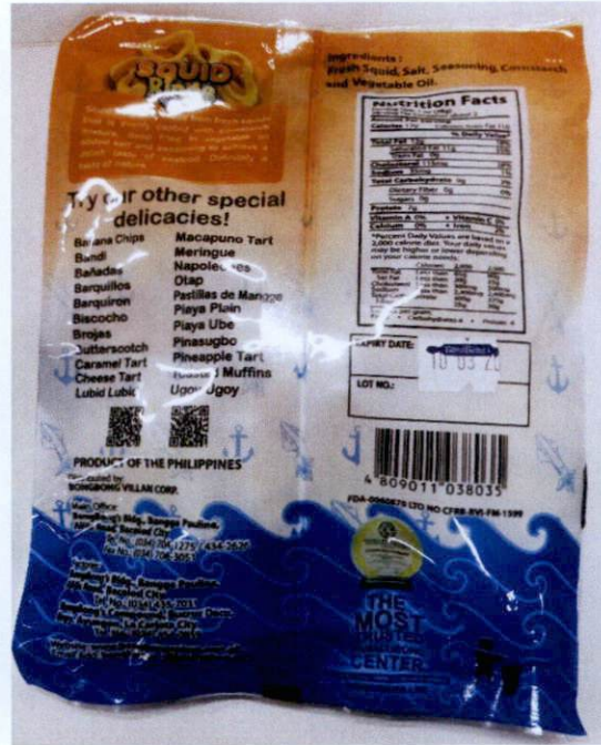
Figure 4. Unregistered BONGBONG'S BACOLOD'S FINEST DELICACIES Squid Rings