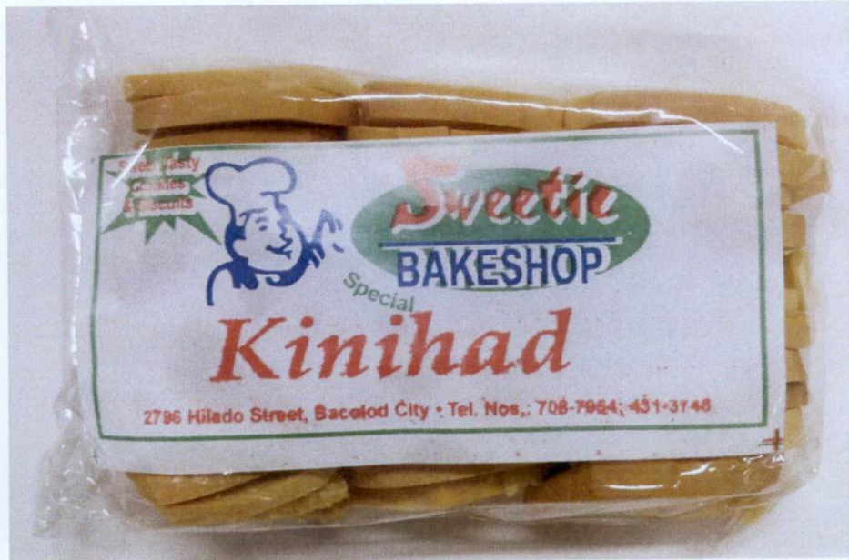
Figure 2. Unregistered SWEETIE BAKESHOP Special Kinihad