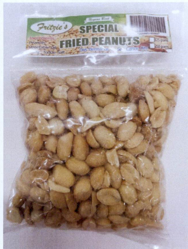
Figure 5. Unregistered FRITZIE'S NEGROS BEST Special Fried Peanuts