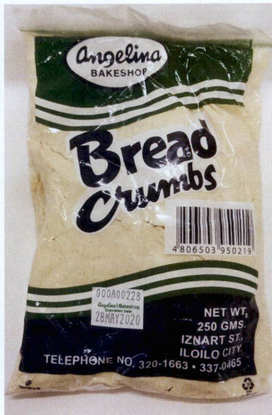
Figure 3. Unregistered ANGELINA BAKESHOP Bread Crumbs