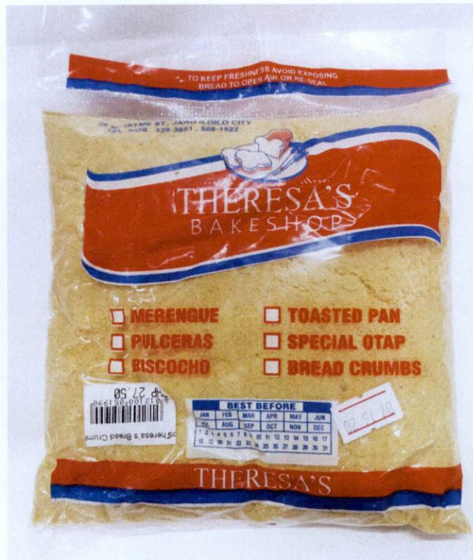
Figure 4. Unregistered THERESA'S BAKESHOP Bread Crumbs