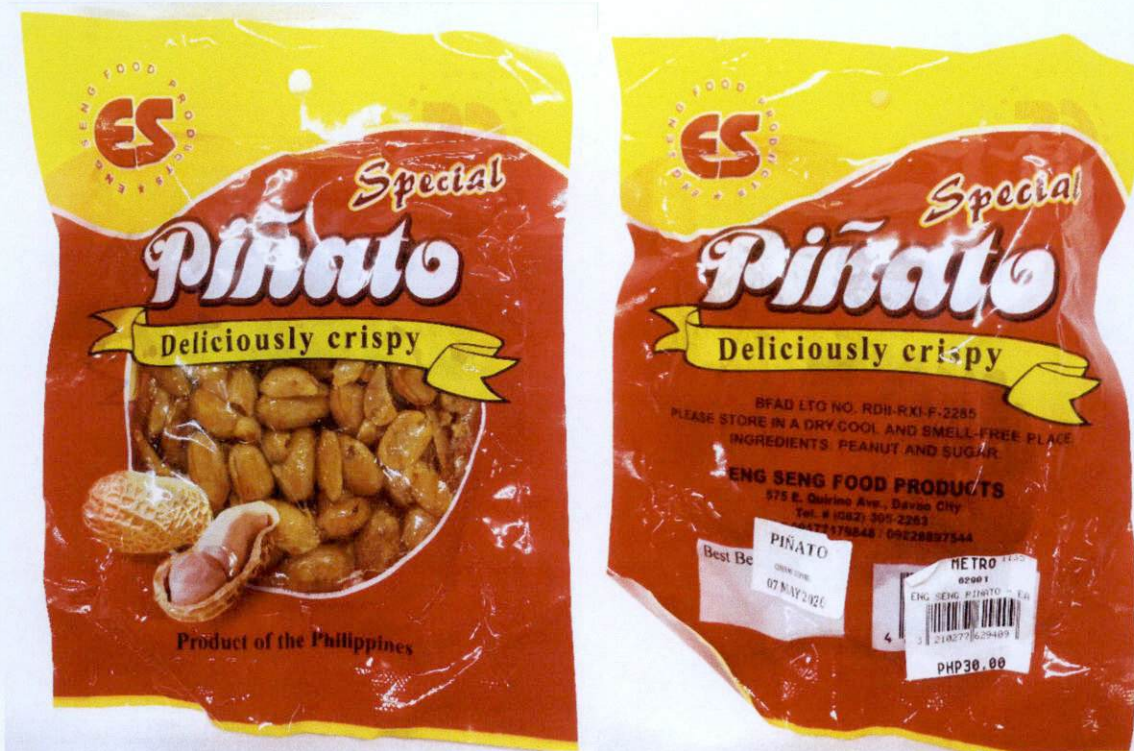
Figure 1. Unregistered ENG SENG FOOD PRODUCTS Special Piñato

The Food and Drug Administration (FDA) warns all healthcare professionals and the general public NOT TO PURCHASE AND CONSUME the following unregistered food products: