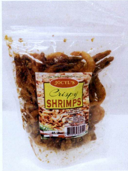
Figure 2. Unregistered JOCYL'S Crispy Shrimps