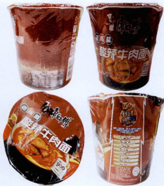
Figure 3. Unregistered Maroon Colored Cup Noodle with Male and Female Cartoon Character (Brand Name and Product Name in Foreign Character) BARCODE: 6900873714216