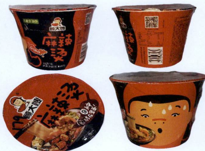
Figure 1. Unregistered Red and Black with Child Graphics Cup Noodles (Brand and Product Name in Foreign Character) BARCODE: 6957427661069

The Food and Drug Administration (FDA) warns all healthcare professionals and the general public NOT TO PURCHASE AND CONSUME the following unregistered food products: