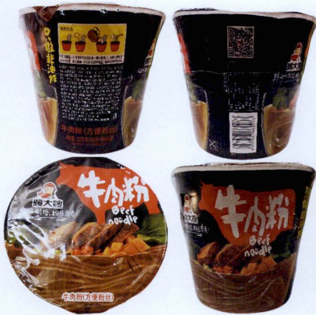
Figure 2. Unregistered Beef Noodle in Black Cup Noodles (Brand Name and Product Name in Foreign Character) BARCODE: 6957427662073