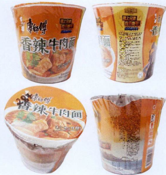
Figure 5. Unregistered Orange Colored Cup Noodles with Male and Female Graphic Character (Brand Name and Product Name in Foreign Character) BARCODE: 690087300975