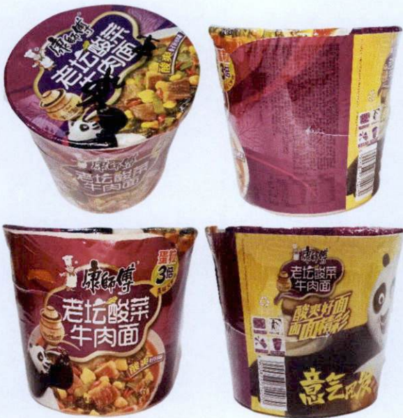
Figure 4. Unregistered Purple Colored Cup Noodles with Panda Graphics (Brand Name and Product Name in Foreign Character) BARCODE: 6900873714070