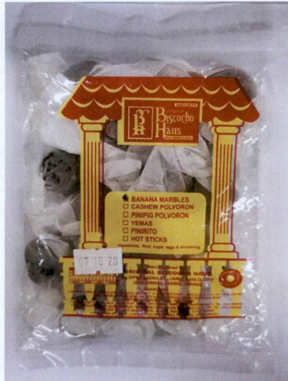
Figure 3. Unregistered ORIGINAL BISCOCHO HAUS Banana Marbles