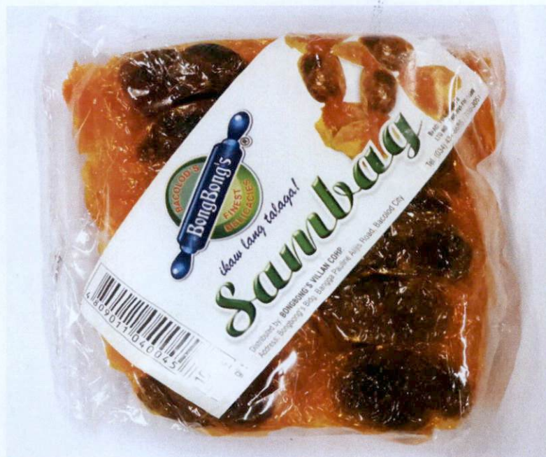
Figure 1. Unregistered BONGBONG'S Sambag, 100g

The Food and Drug Administration (FDA) warns all healthcare professionals and the general public NOT TO PURCHASE AND CONSUME the following unregistered food products: