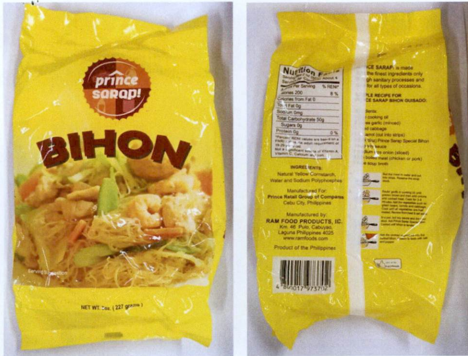
Figure 2. Unregistered PRINCE SARAP! Bihon, 227g