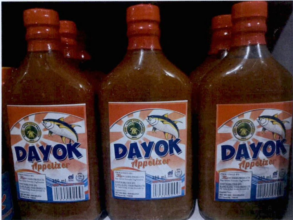
Figure 5. Unregistered ILANG-ILANG FOOD PRODUCTS Dayok Appetizer