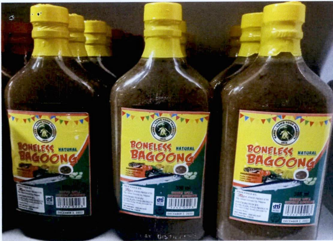
Figure 4. Unregistered ILANG-ILANG FOOD PRODUCTS Natural Boneless Bagoong