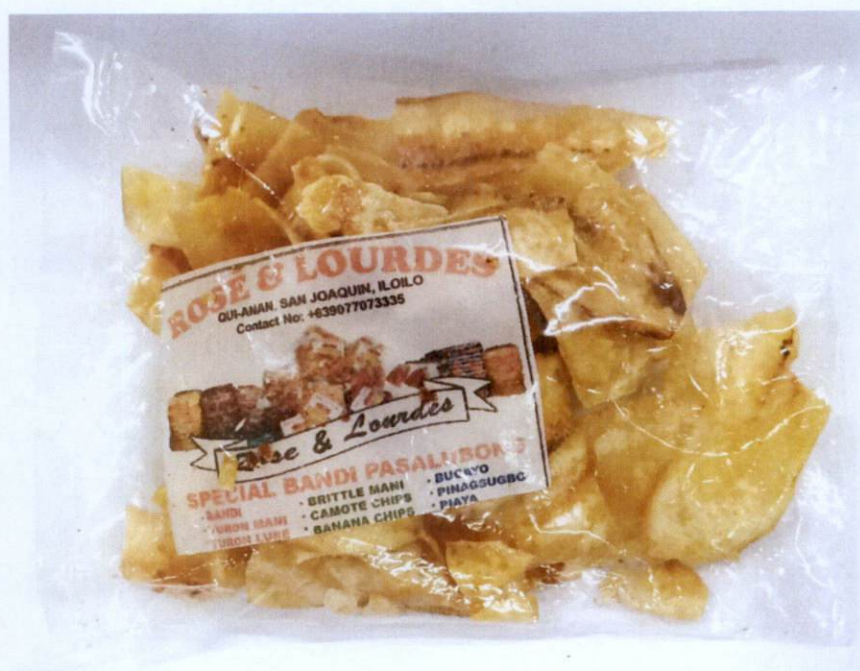
Figure 1. Unregistered ROSE & LOURDES Special Bandi Pasalubong Banana Chips

The Food and Drug Administration (FDA) warns all healthcare professionals and the general public NOT TO PURCHASE AND CONSUME the following unregistered food products: