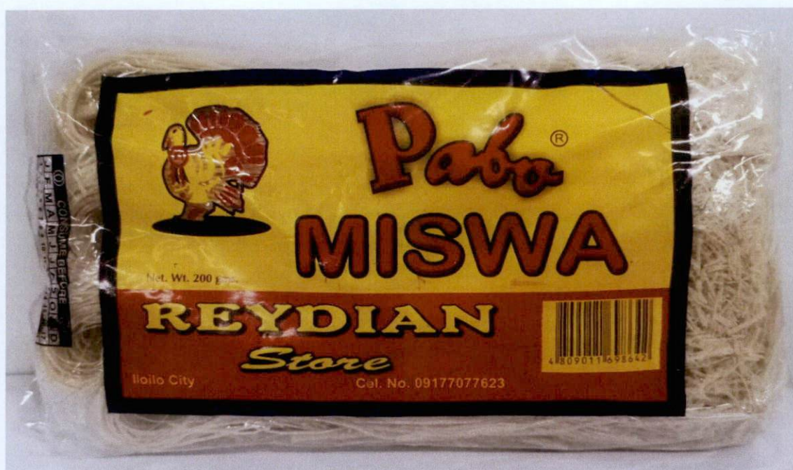
Figure 3. Unregistered PABO Miswa, 200g