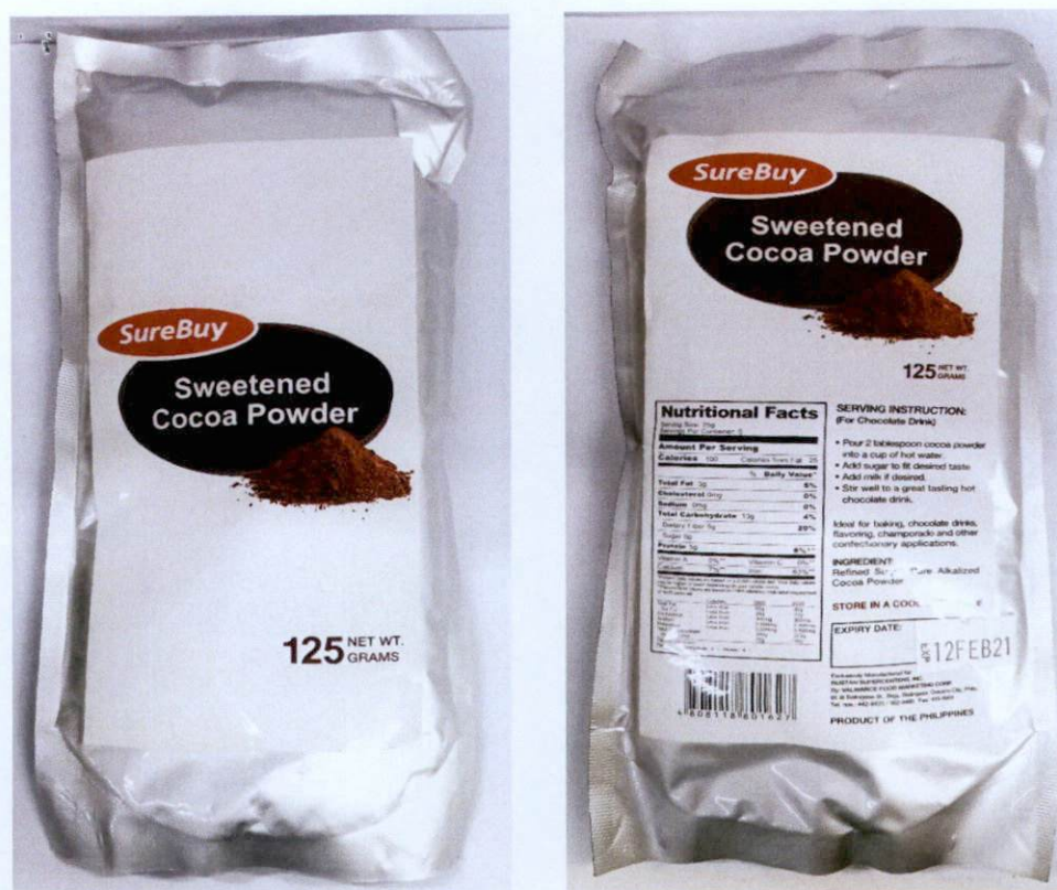
Figure 2. Unregistered SUREBUY Sweetened Cocoa Powder, 125g