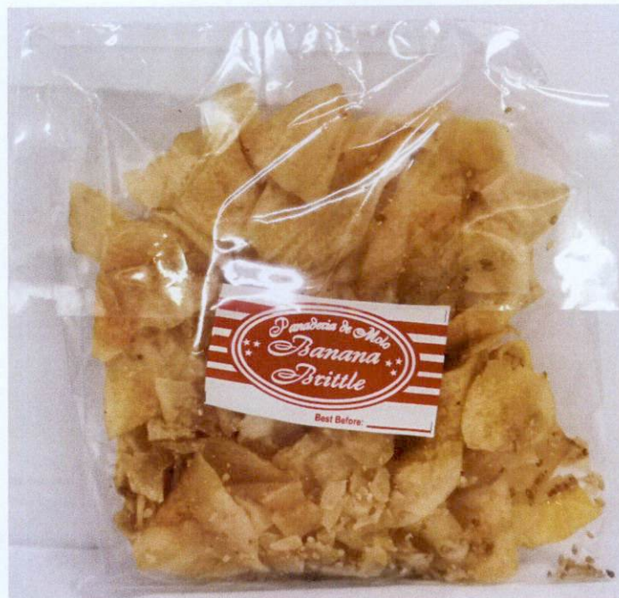
Figure 5. Unregistered PANADERIA DE MOLO Banana Brittle