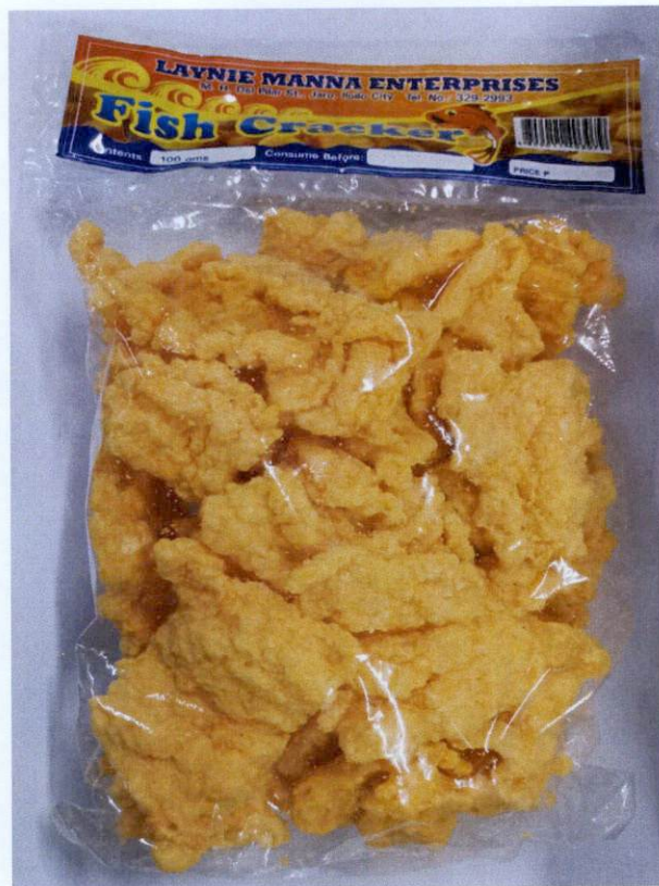
Figure 4. Unregistered LAYNIE MANNA ENTERPRISES Fish Crackers, 100g