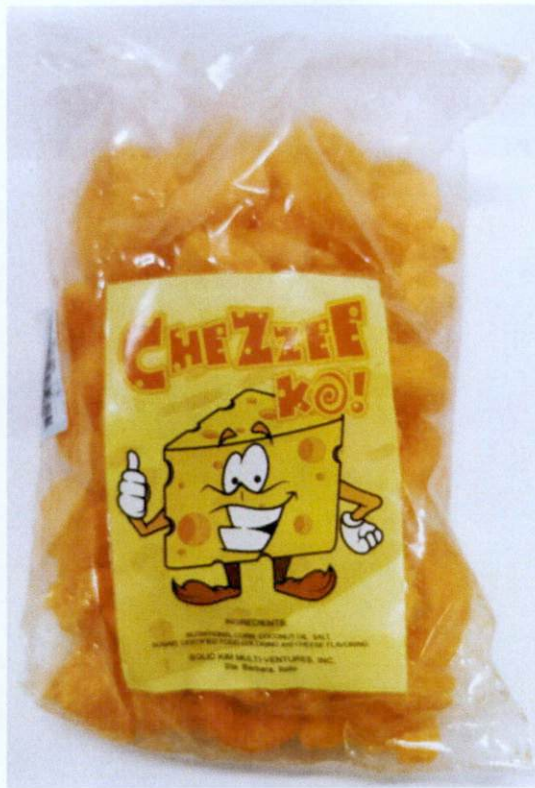
Figure 2. Unregistered CHEEZEE KO! Cheese Rings, 30g