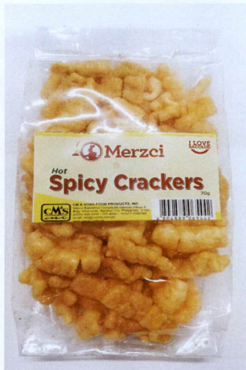
Figure 5. Unregistered MERZCI Hot Spicy Crackers, 70g