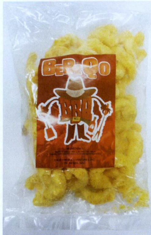
Figure 1. Unregistered BEBEQO Mini Bbq Rings, 30g

The Food and Drug Administration (FDA) warns all healthcare professionals and the general public NOT TO PURCHASE AND CONSUME the following unregistered food products: