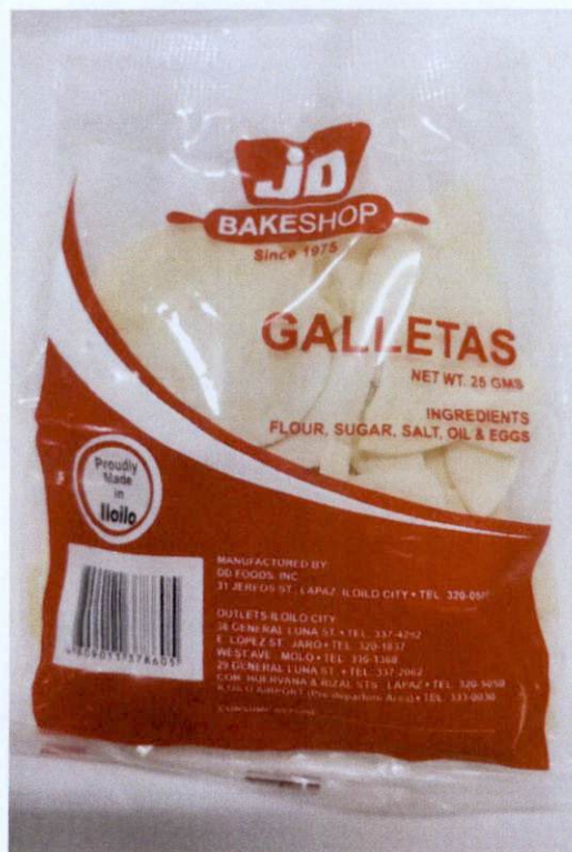
Figure 3. Unregistered JD BAKESHOP Galletas, 25g