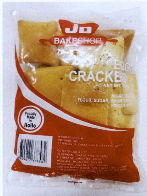
Figure 4. Unregistered JD BAKESHOP Egg Crackers, 70g