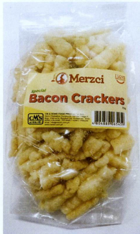
Figure 1. Unregistered MERZCI Special Bacon Crackers, 70g

The Food and Drug Administration (FDA) warns all healthcare professionals and the general public NOT TO PURCHASE AND CONSUME the following unregistered food products: