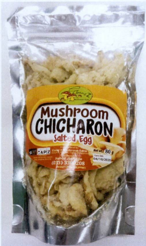
Figure 3. Unregistered EBANG'Z Mushroom Chicharon Salted Egg, 80g