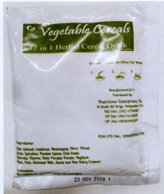
Figure 2. Unregistered VEGETABLE CEREALS 17-in-1 Herbal Cereal Drink, 35g