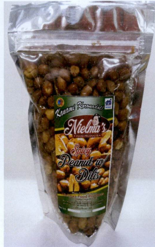
Figure 4. Unregistered NIELMA'S Spicy Peanut with Dilis