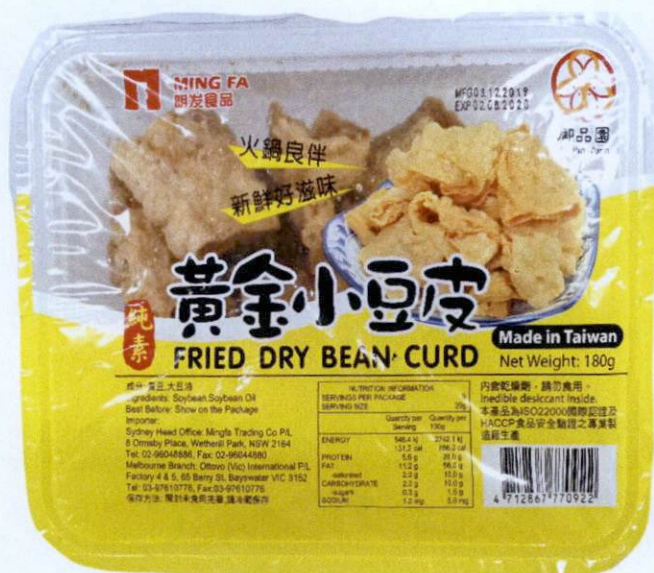
Figure 3. Unregistered MING FA Fried Dry Bean Curd,180g