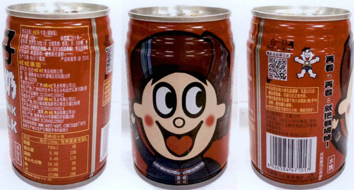
Figure 1. Unregistered Red Colored Can with Child Artwork (Brand Name and Product Name in Foreign Language) BARCODE: 6920584471017

The Food and Drug Administration (FDA) warns all healthcare professionals and the general public NOT TO PURCHASE AND CONSUME the following unregistered food products: