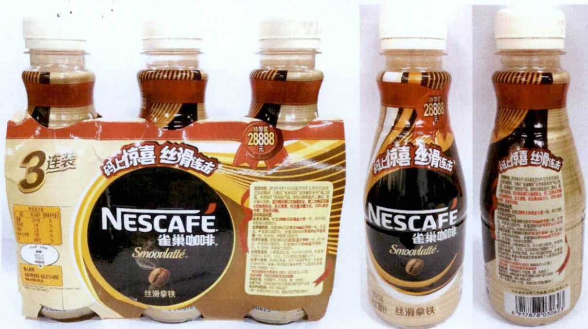
Figure 2. Unregistered NESCAFE Smoovlatte,268