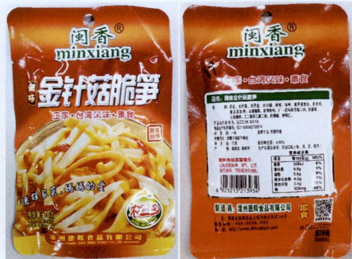
Figure 4. Unregistered MINXIANG Nong Jia Xiao Cai, 70 (Product Name in Foreign Character) BARCODE:6923213213934