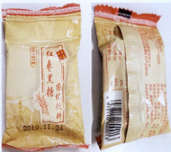
Figure 4. Unregistered Sachet with Orange Lining (Brand Name and Product Name in Foreign Character) BARCODE: 6972110800013