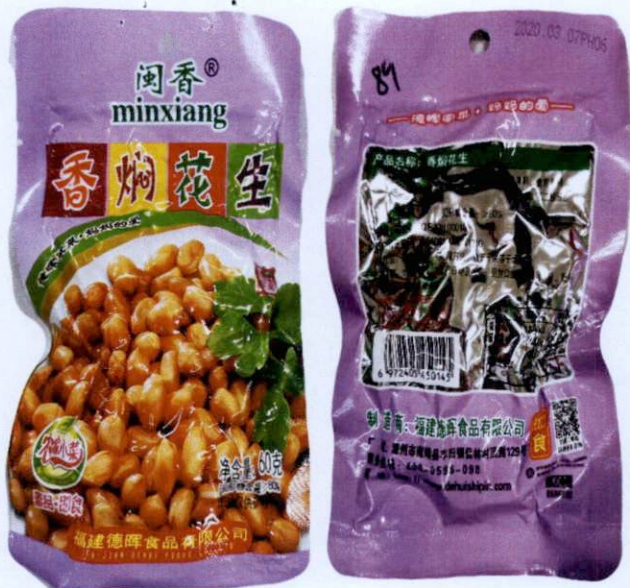
Figure 2. Unregistered MINXIANG 60 Purple Colored Label (Product Name in Foreign Character) BARCODE: 6972405450145