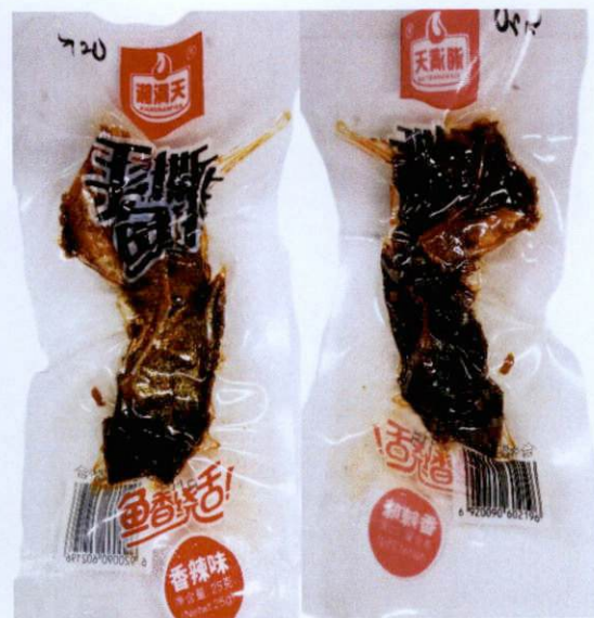
Figure 3. Unregistered XIANGMANTIAN, 25g (Product Name in Foreign Character) BARCODE: 6920090602196