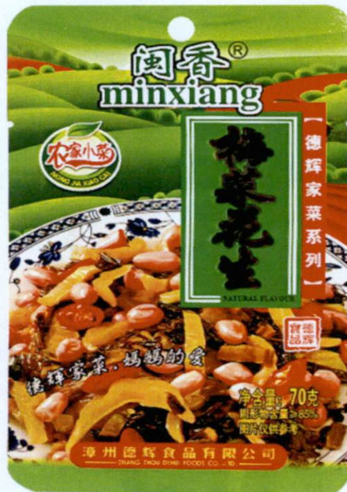
Figure 1. Unregistered MINXIANG Green Colored Pouch, BARCODE: 6923213213798

The Food and Drug Administration (FDA) warns all healthcare professionals and the general public NOT TO PURCHASE AND CONSUME the following unregistered food products: