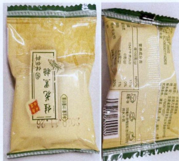
Figure 5. Unregistered Sachet with Green Lining (Brand Name and Product Name in Foreign Character) BARCODE: 6972110800020