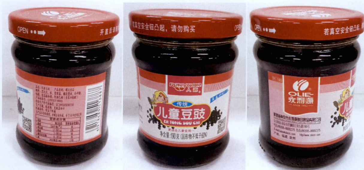
Figure 1. Unregistered RENYUAN Er Tong Dou Ghi , BARCODE: 6918689516887

The Food and Drug Administration (FDA) warns all healthcare professionals and the general public NOT TO PURCHASE AND CONSUME the following unregistered food products: