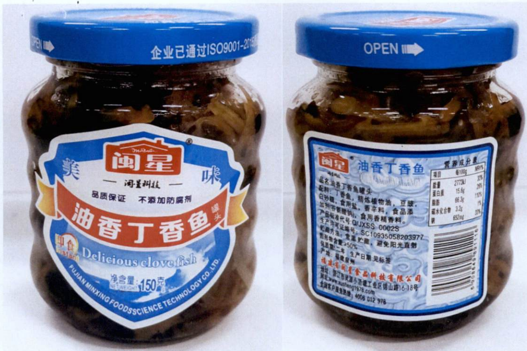
Figure 2. Unregistered Instant Delicious Clove Fish, 150g (Brand Name in Foreign Character) BARCODE: 6908649891116