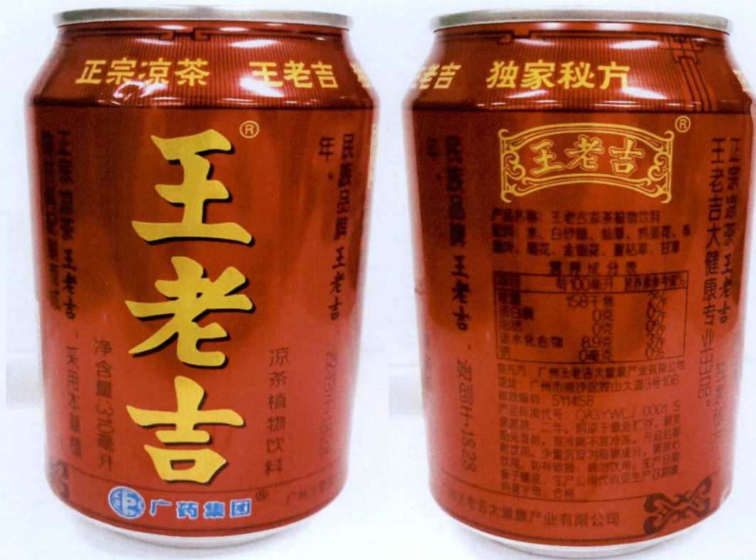
Figure 3. Unregistered Red Easy Open Tin Can (Brand and Product Name in Foreign Character) BARCODE: 6956367338680