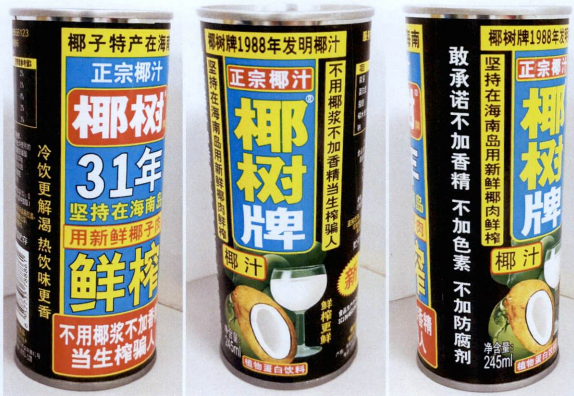
Figure 5. Unregistered 245ml can with Black, Blue and Yellow Label with Coconut Artwork (Brand name and Product Name in Foreign Character) BARCODE: 6957735788861