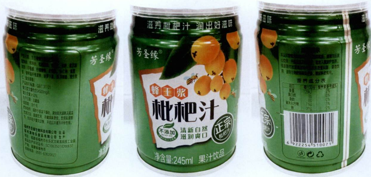
Figure 4. Unregistered Green Easy Open Can with Peach Artwork, 245ml (Brand Name and Product Name in Foreign Character) BARCODE: 6922254510071