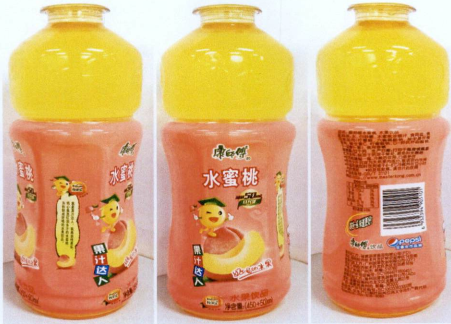
Figure 5. Yellow Liquid Peach Colored Label with Peach Fruit Artwork, 450+50ml, (Brand Name and Product Name in Foreign Character) BARCODE: 6932394905101

The FDA verified through post-marketing surveillance that the abovementioned food products are not registered and no corresponding Certificates of Product Registration (CPR) have been issued. Pursuant to the Republic Act No. 9711, otherwise known as the “Food and Drug Administration Act of 2009”, the manufacture, importation, exportation, sale, offering for sale, distribution, transfer, non-consumer use, promotion, advertising or sponsorship of health products without the proper authorization is prohibited.