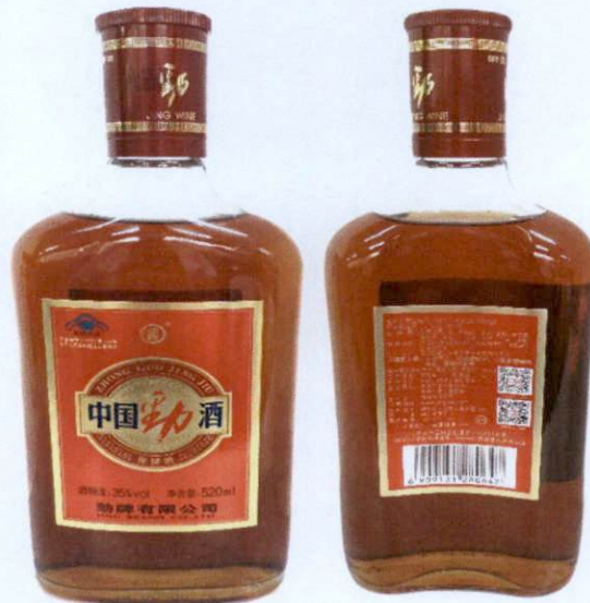
Figure 1. ZHONG GUO JING JIU, 35% Vol, 520ml (Product Name In Foreign Character) BARCODE: 6909131280647

The Food and Drug Administration (FDA) warns all healthcare professionals and the general public NOT TO PURCHASE AND CONSUME the following unregistered food products: