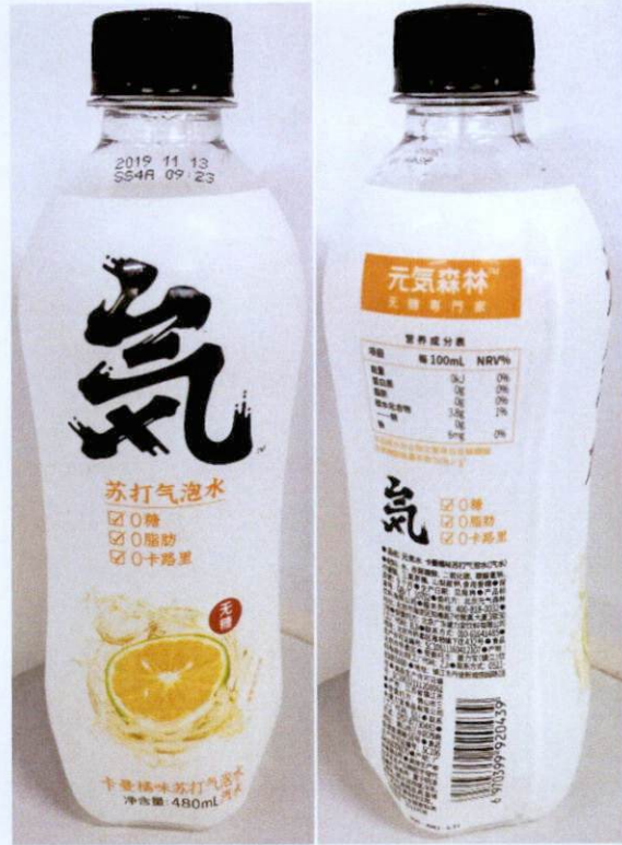
Figure 3. White Labeled Bottle with Orange Artwork, 480ml (Brand Name and Product Name in Foreign Character) BARCODE: 6970399920439