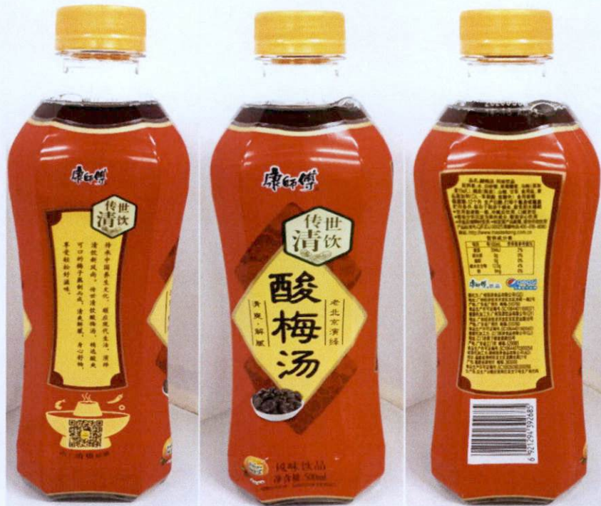
Figure 4. Red Labeled Bottle, 500ml (Brand Name and Product Name in Foreign Character) BARCODE: 6921294392685