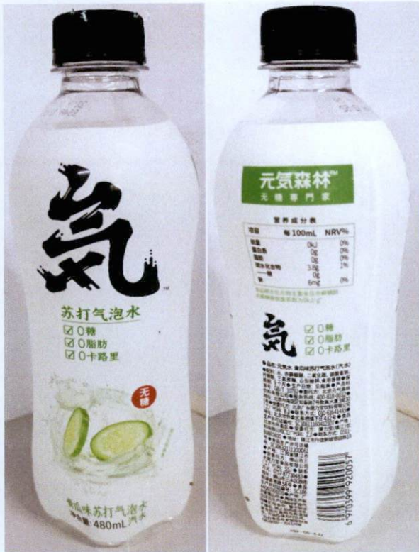
Figure 2. White Labeled Bottle with Cucumber Artwork, 480ml (Brand Name and Product Name in Foreign Character) BARCODE: 6970399920057