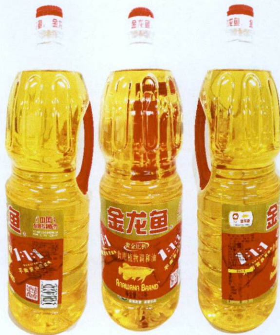
Figure 4. Unregistered ARAWANA BRAND, 2.5 (Product Name in Foreign Character) BARCODE: 6948195800484