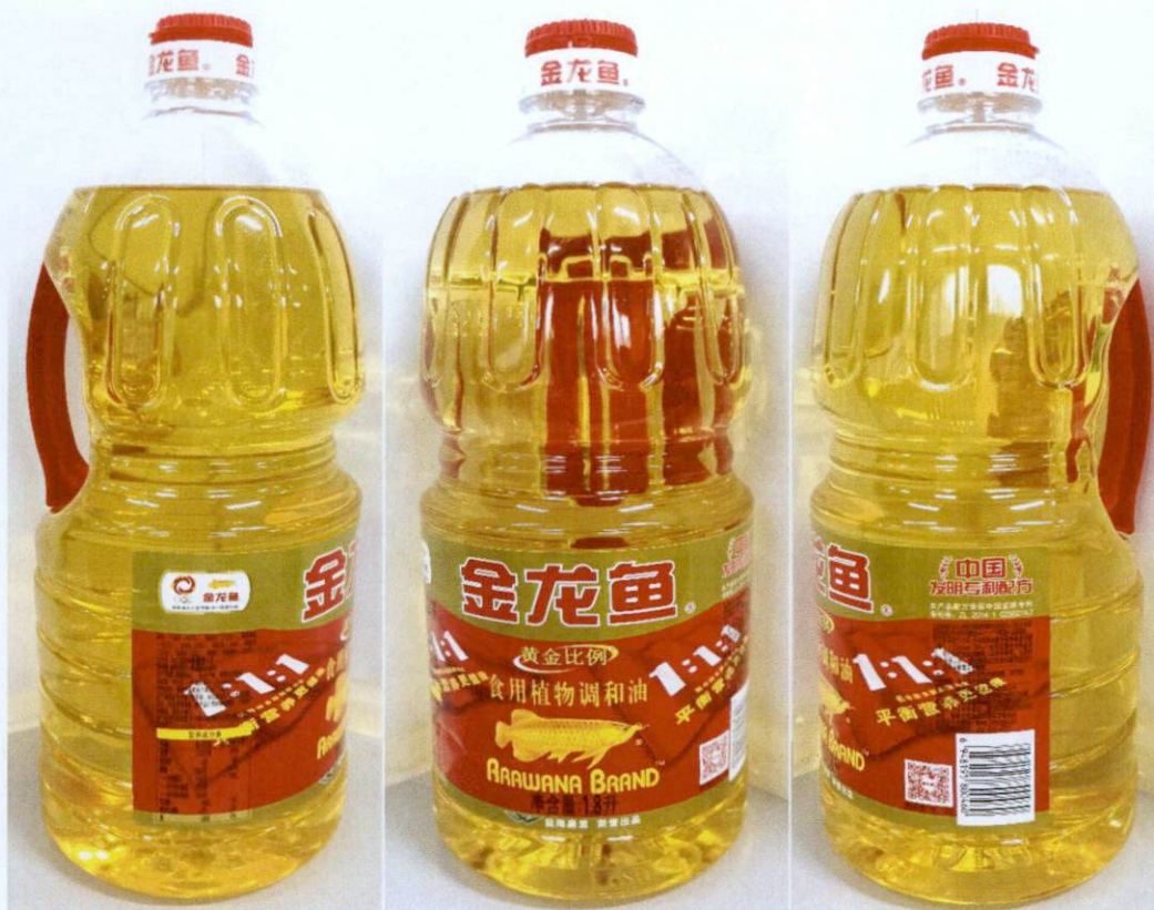
Figure 5. Unregistered ARAWANA BRAND, 1.8 (Product Name in Foreign Character) BARCODE: 6948195800460

The FDA verified through post-marketing surveillance that the abovementioned food products are not registered and no corresponding Certificates of Product Registration (CPR) have been issued. Pursuant to the Republic Act No. 9711, otherwise known as the “Food and Drug Administration Act of 2009”, the manufacture, importation, exportation, sale, offering for sale, distribution, transfer, non-consumer use, promotion, advertising or sponsorship of health products without the proper authorization is prohibited.