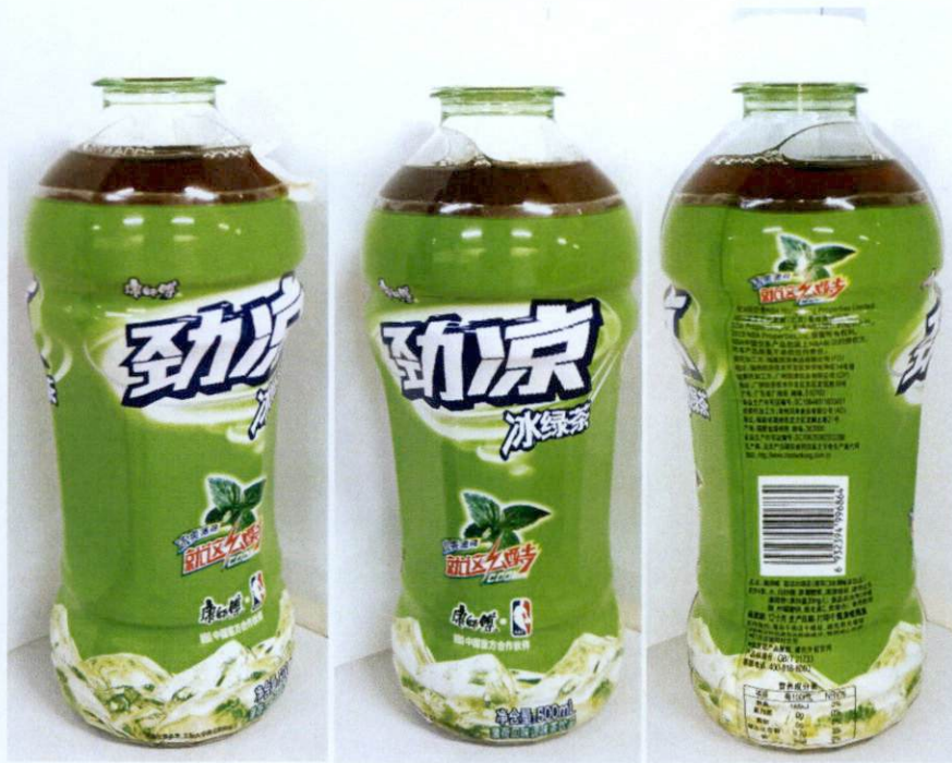
Figure 2. Unregistered Tea like Liquid in Bottle with Green Label Bottle, 500ml (Brand Name and Product Name in Foreign Character) BARCODE: 6932394996864