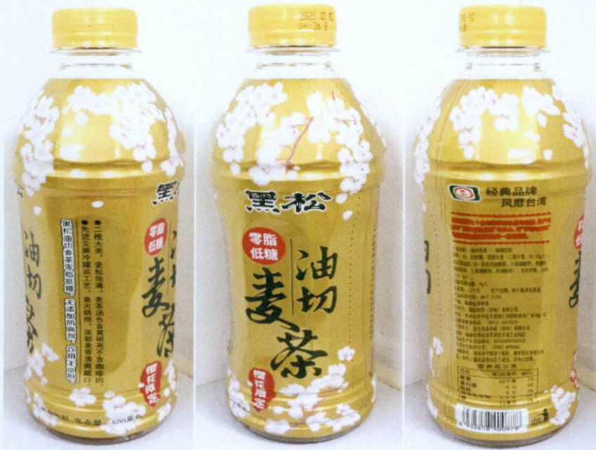
Figure 1. Unregistered Bottle with Gold colored label and Cherry Blossom Artwork, 500 (Brand Name and Product Name in Foreign Character) BARCODE: 6932658400878

The Food and Drug Administration (FDA) warns all healthcare professionals and the general public NOT TO PURCHASE AND CONSUME the following unregistered food products: