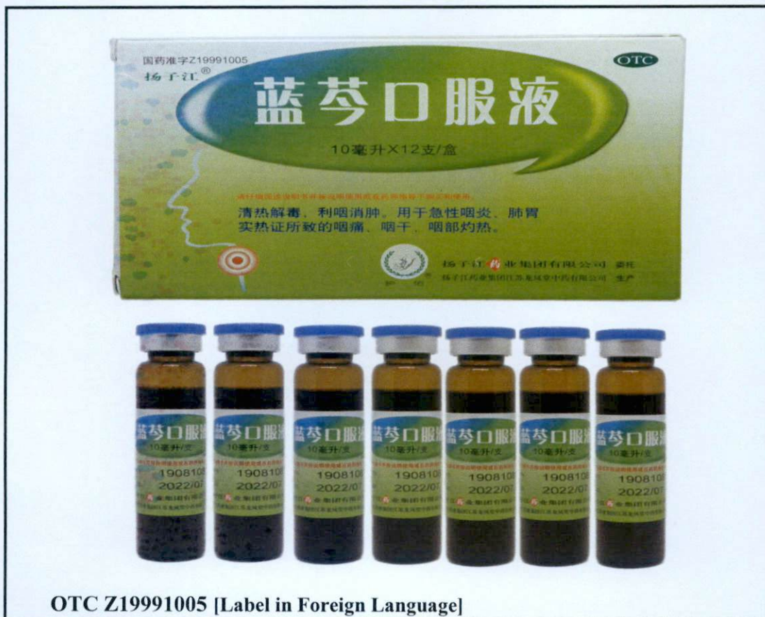
OTC Z19991005 [Label in Foreign Language]

The Food and Drug Administration (FDA) advises the public against the purchase and use of the following unregistered drug products: