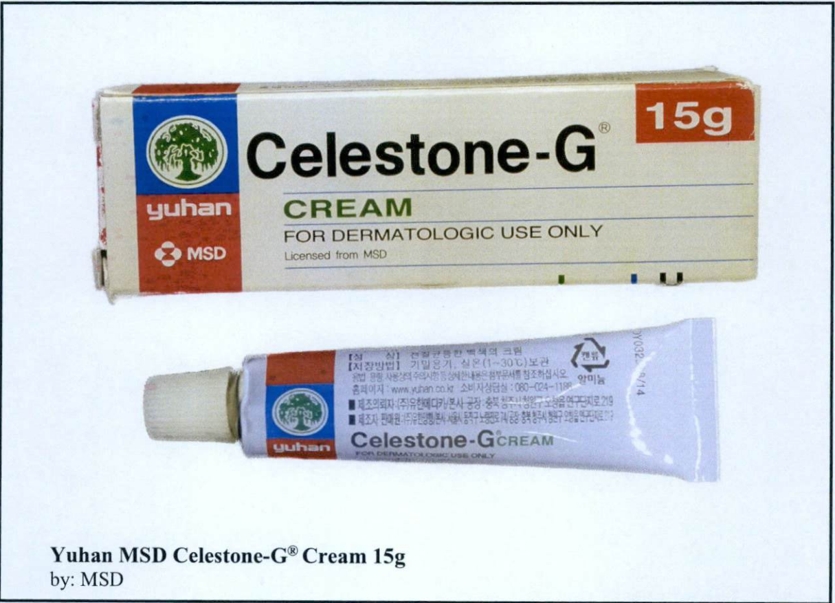
Yuhan MSD Celestone-G® Cream 15g by: MSD