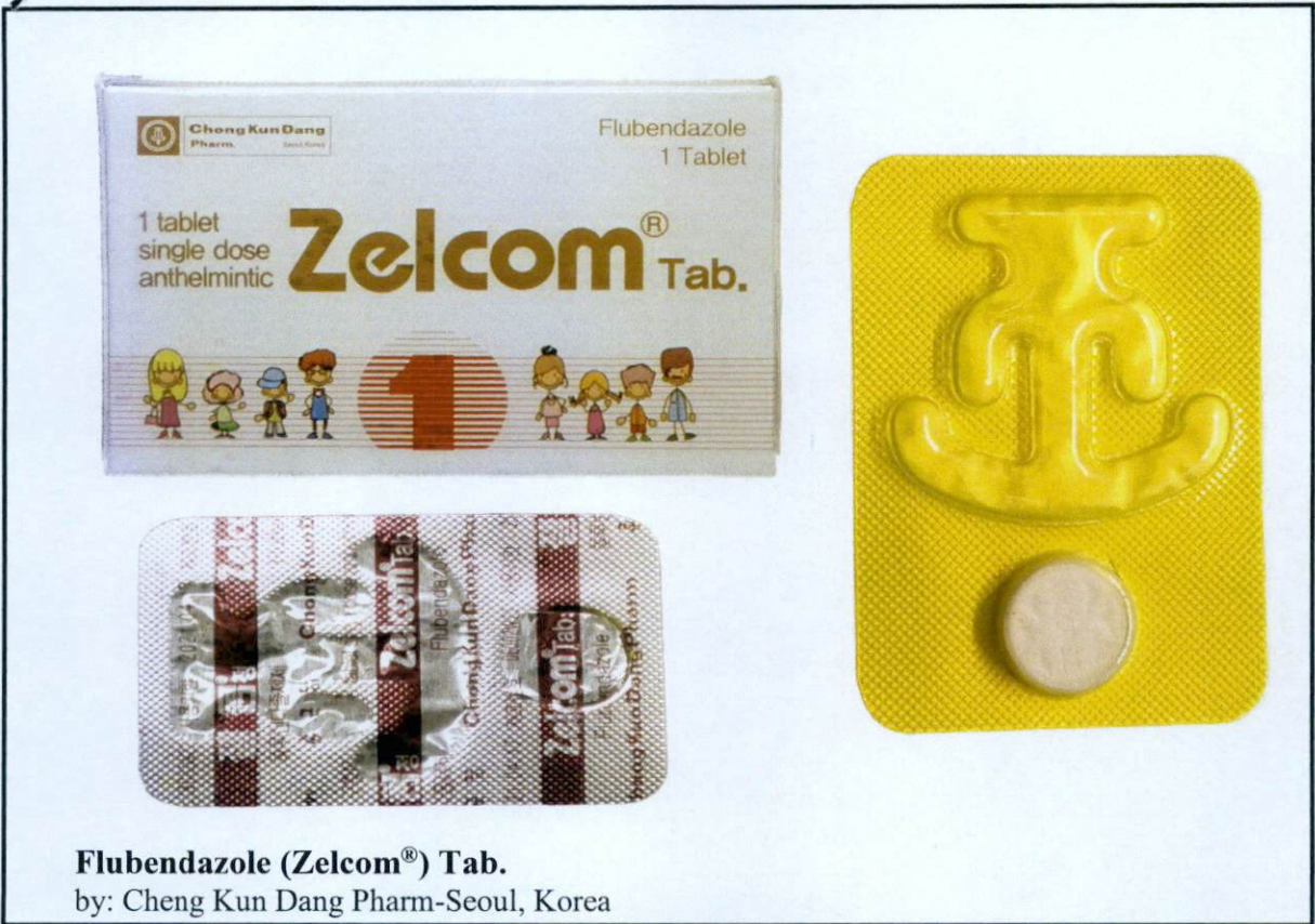
Flubendazole (Zelcom®) Tab. by: Cheng Kun Dang Pharm-Seoul, Korea