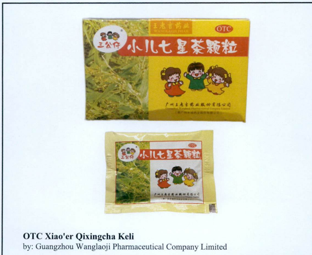
OTC Xiao'er Qixingcha Keli by: Guangzhou Wanglaoji Pharmaceutical Company Limited

The Food and Drug Administration (FDA) advises the public against the purchase and use of the following unregistered drug products: