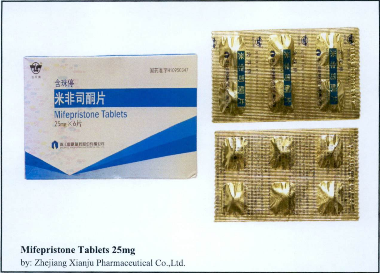
Mifepristone Tablets 25mg by: Zhejiang Xianju Pharmaceutical Co.,Ltd.