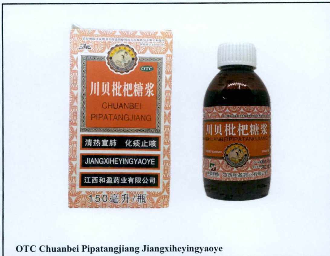
Figure 4. Unregistered drug product

FDA Post-Marketing Surveillance (PMS) activities have verified that the abovementioned drug products have not gone through the registration process of the Agency and have not been issued with proper authorization in the form of Certificate of Product Registration. Thus, the Agency cannot guarantee its quality, safety and efficacy. Therefore, consumption of such violative products may pose potential danger or injury to health.