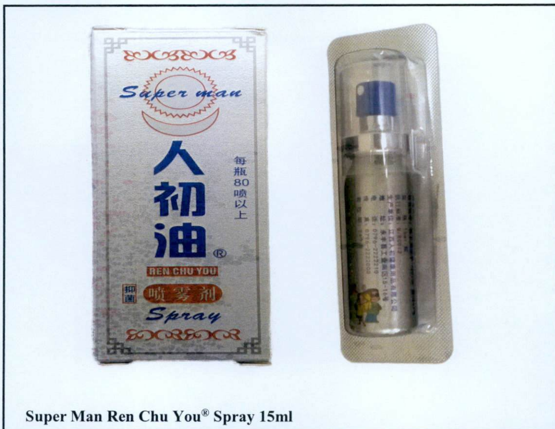
Super Man Ren Chu You® Spray 15ml