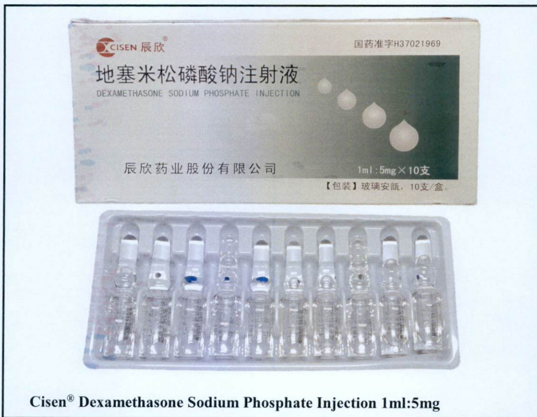
Cisen® Dexamethasone Sodium Phosphate Injection 1ml:5mg