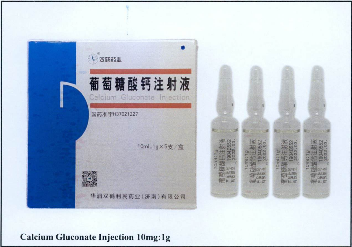
Calcium Gluconate Injection 10mg:1g