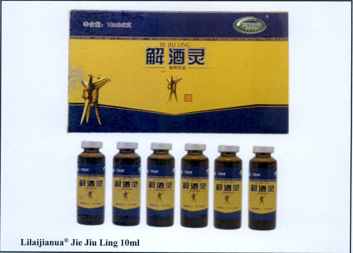
Lilaijianua® Jie Jiu Ling 10ml