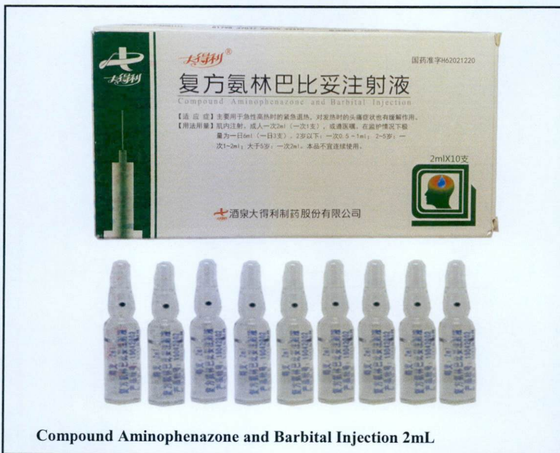
Compound Aminophenazone and Barbitol Injection 2mL

The Food and Drug Administration (FDA) advises the public against the purchase and use of the following unregistered drug products: