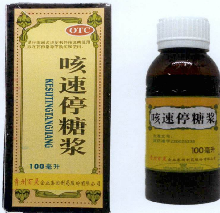
OTC Kesutingtangjiang 100ml