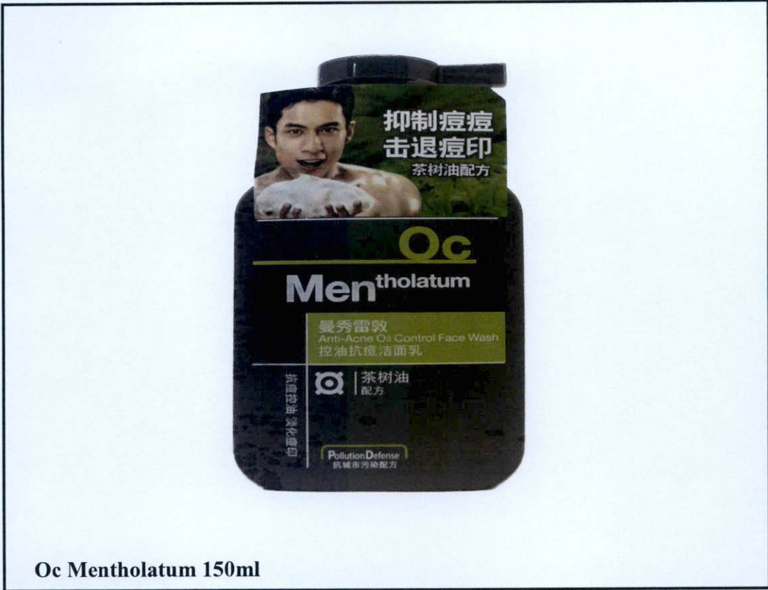
Oc Mentholatum 150ml