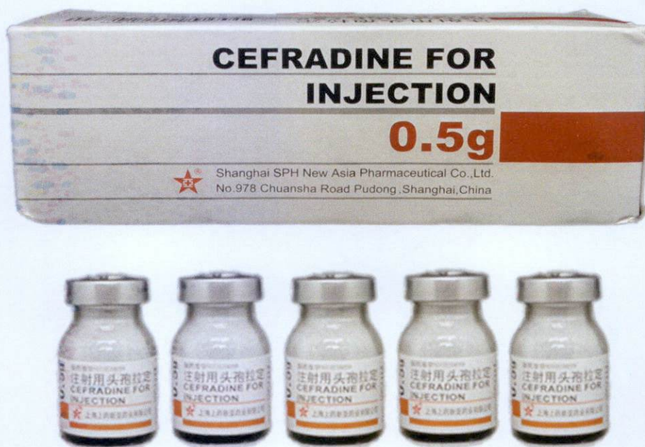
Cefradine For Injection 0.5g