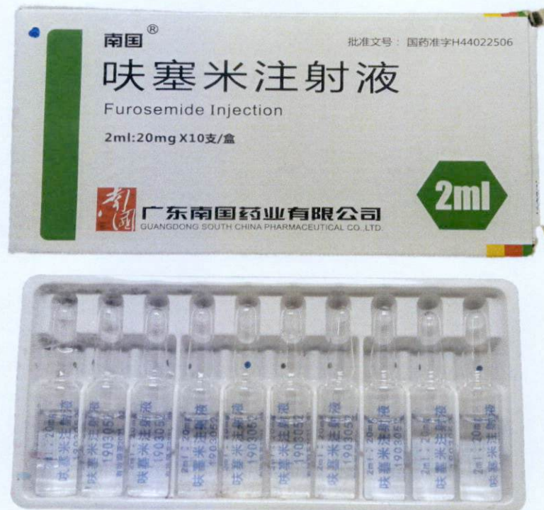
Furosemide Injection 2ml: 20mg by: Guangdong South China Pharmaceutical Co., Ltd.