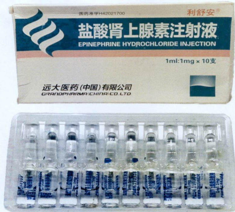
Epinephrine Hydrochloride Injection 1ml: 1mg by: GrandPharma (China) Co., Ltd.