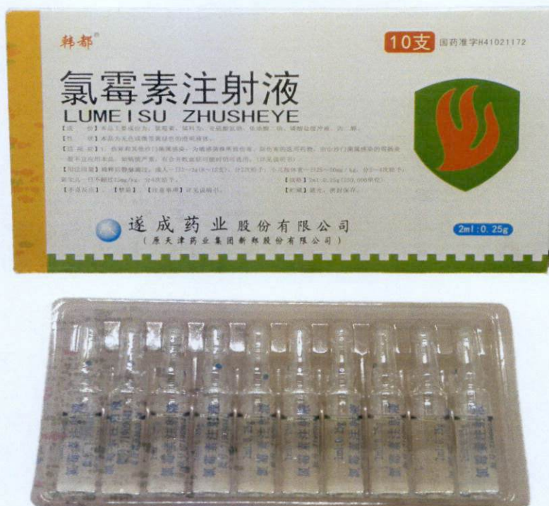
Lumeisu Zhushenye 2ml: 0.25g