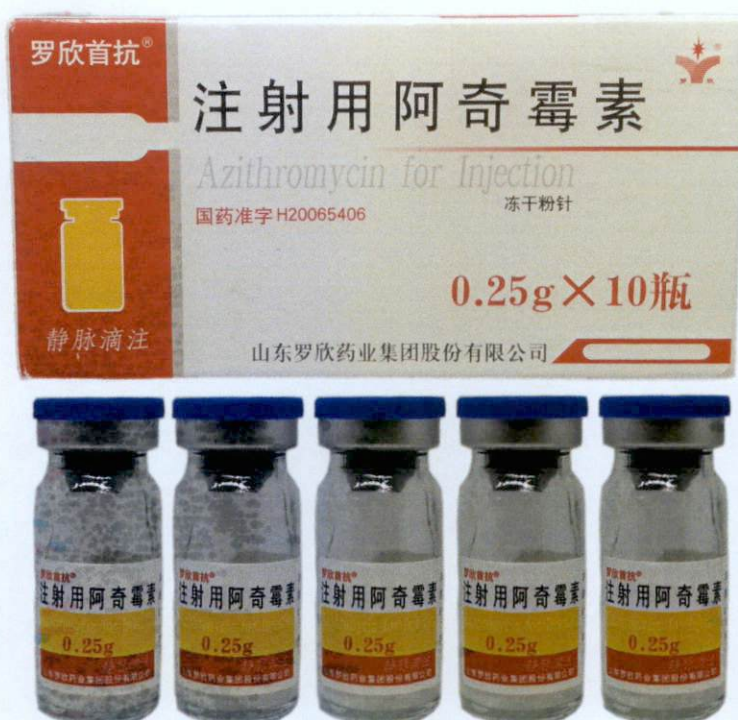
Azithromycin for Injection 0.25g