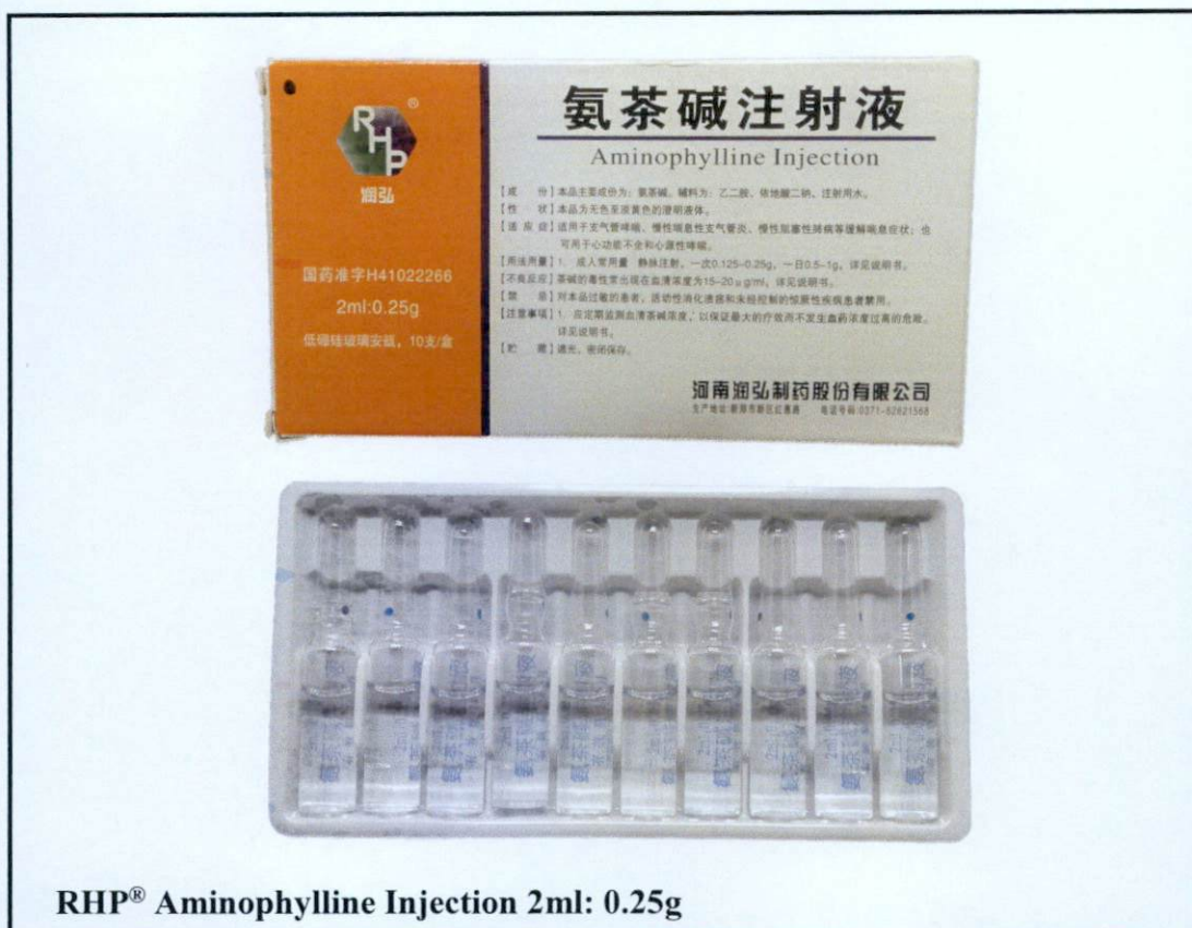
Figure 4. Unregistered drug product