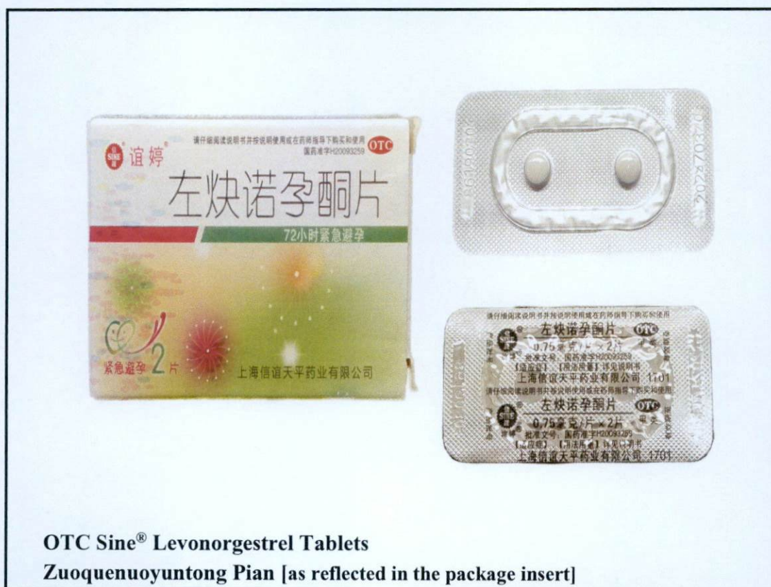
Figure 5. Unregistered drug product