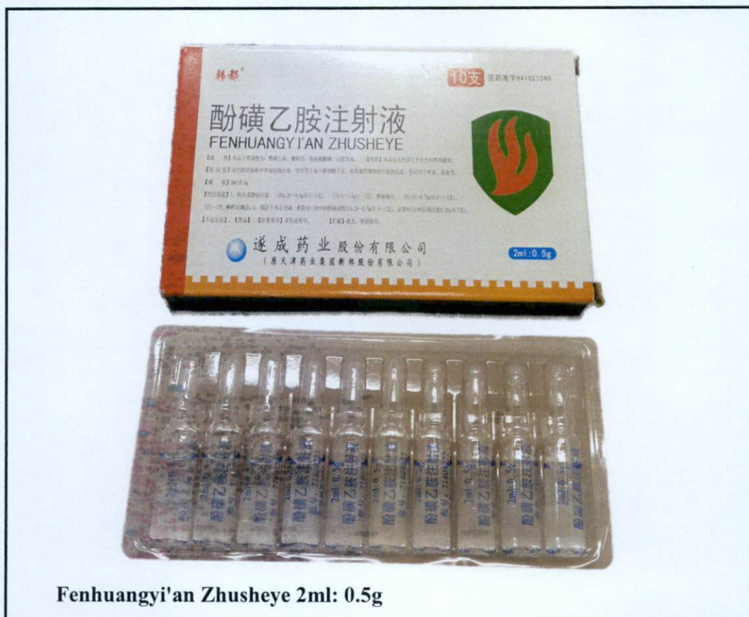
Fenhuangyi'an Zhushuye 2ml: 0.5g

The Food and Drug Administration (FDA) advises the public against the purchase and use of the following unregistered drug products: