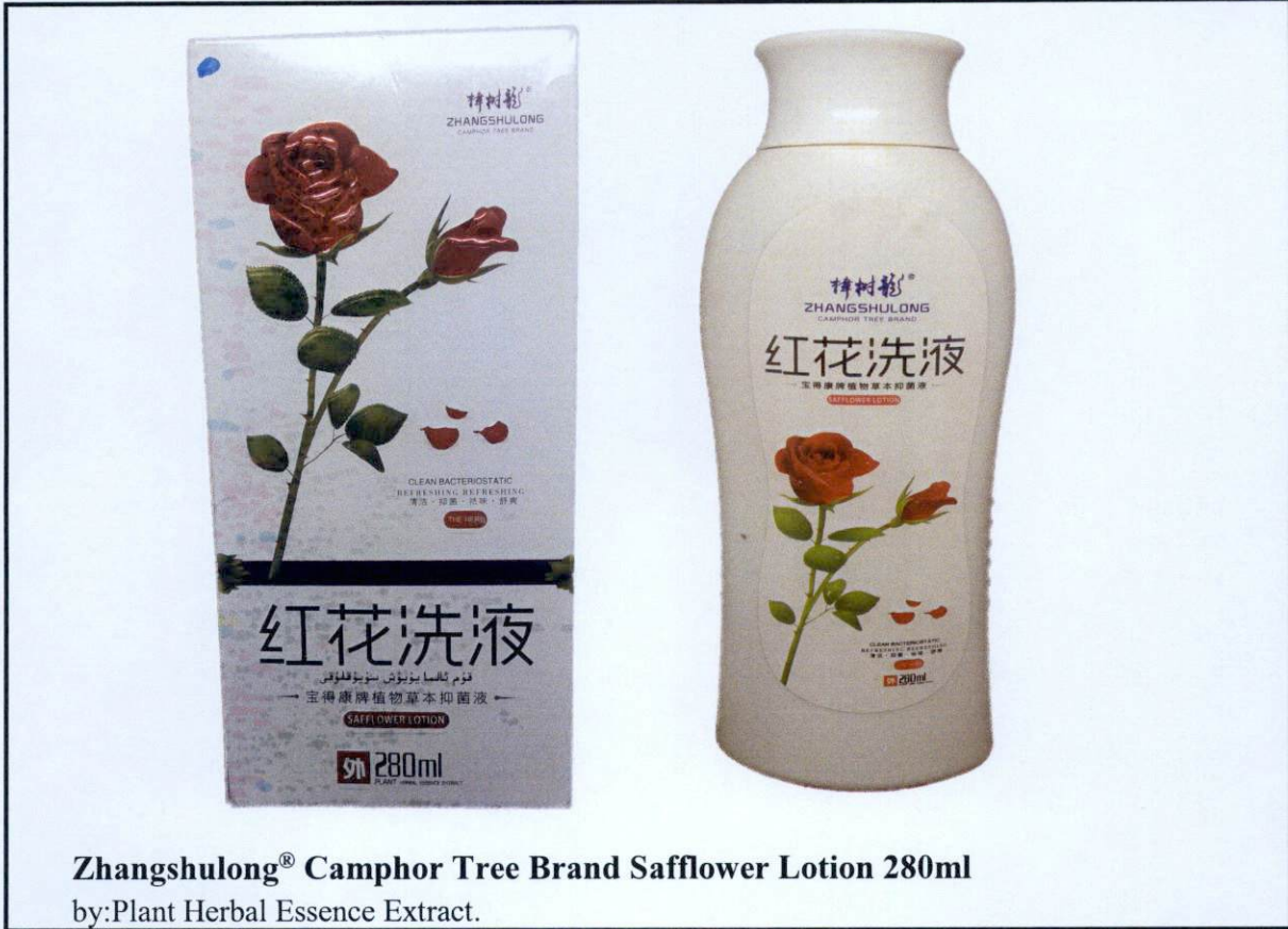
Figure 3. Unregistered drug product