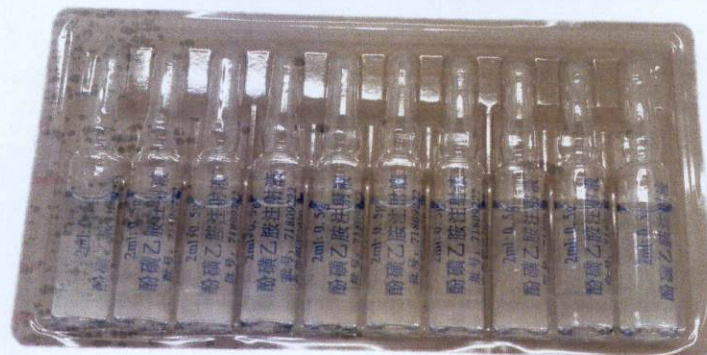
Yansuan Linkemeisu Zhusheye 2ml: 0.6g