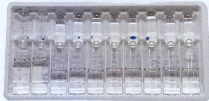
Cisen® Vitamin C Injection 2ml: 0.5g