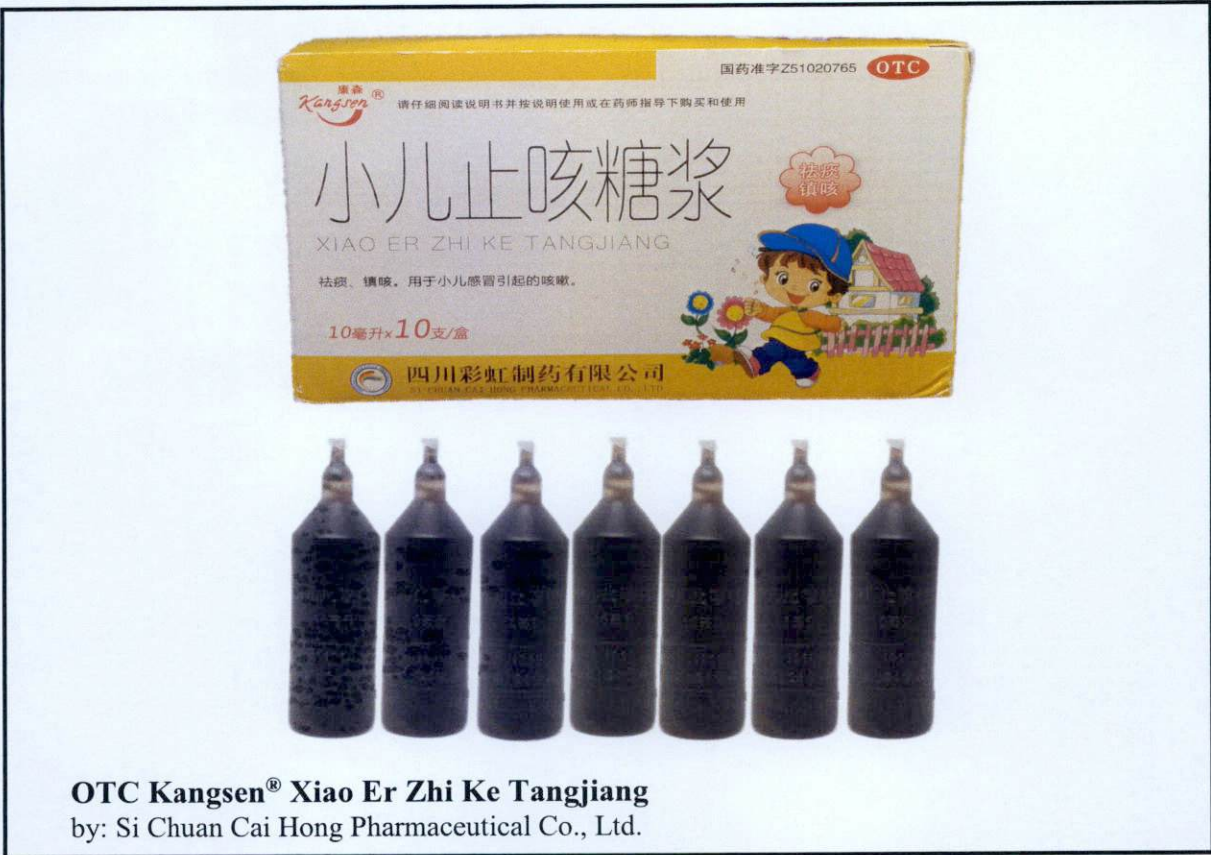
Figure 2. Unregistered drug product