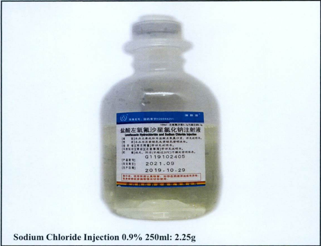
Sodium Chloride Injection 0.9% 250ml: 2.25g