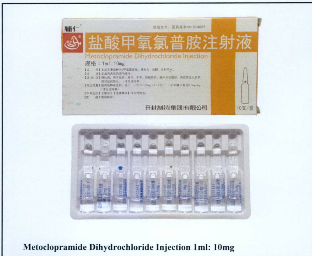
Metoclopramide Dihydrochloride Injection 1ml: 10mg

The Food and Drug Administration (FDA) advises the public against the purchase and use of the following unregistered drug products: