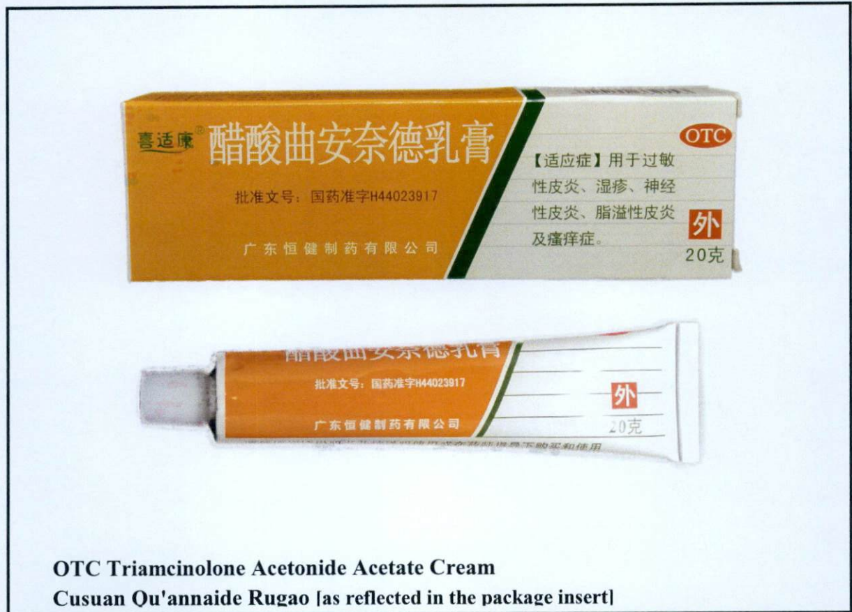
OTC Triamcinolone Acetonide Acetate Cream Cusuan Ou'annaide Rugao [as reflected in the package insert]