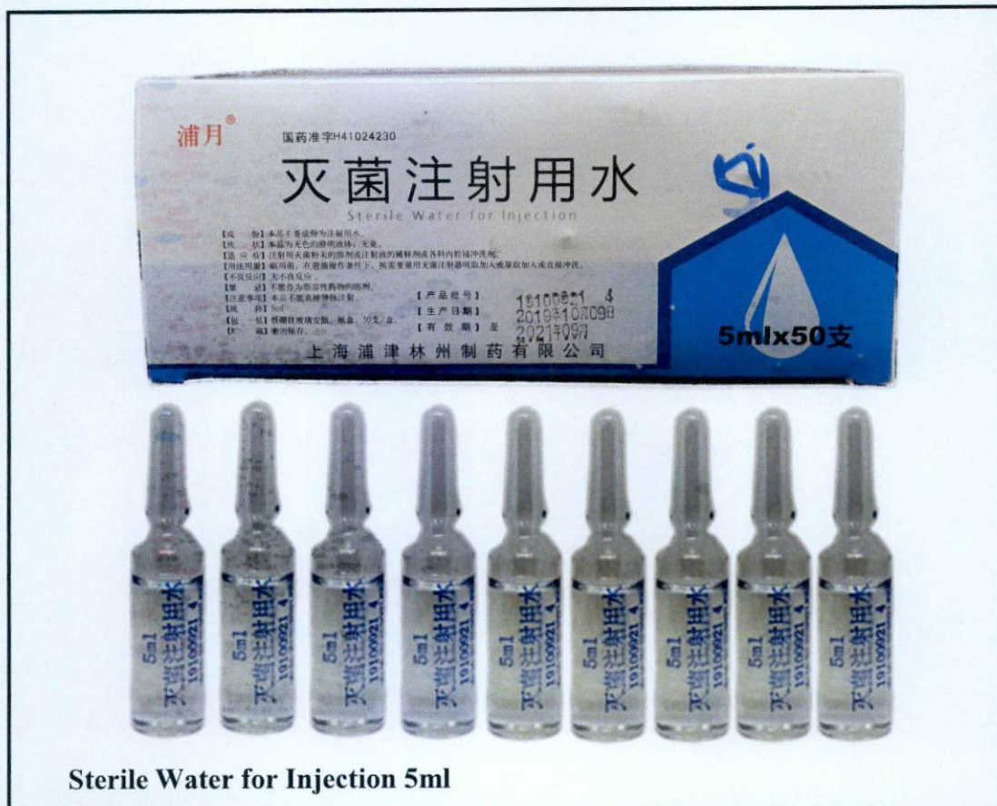
Sterile Water for Injection 5ml

The Food and Drug Administration (FDA) advises the public against the purchase and use of the following unregistered drug products: