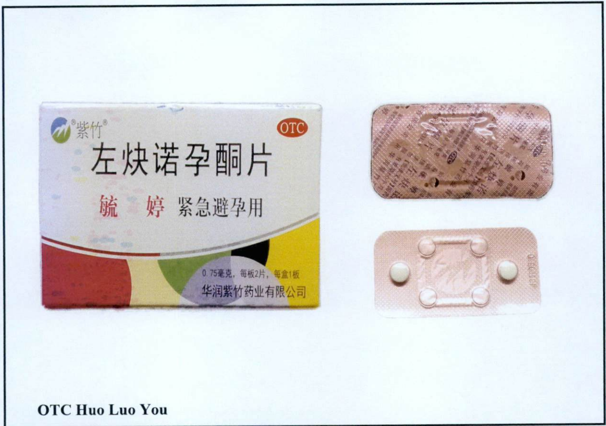
OTC Huo Luo You