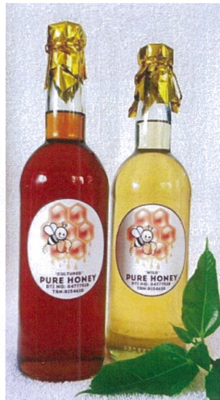
Figure 4. Unregistered (UNBRANDED) Cultured Pure Honey and (UNBRANDED) Wild Pure Honey