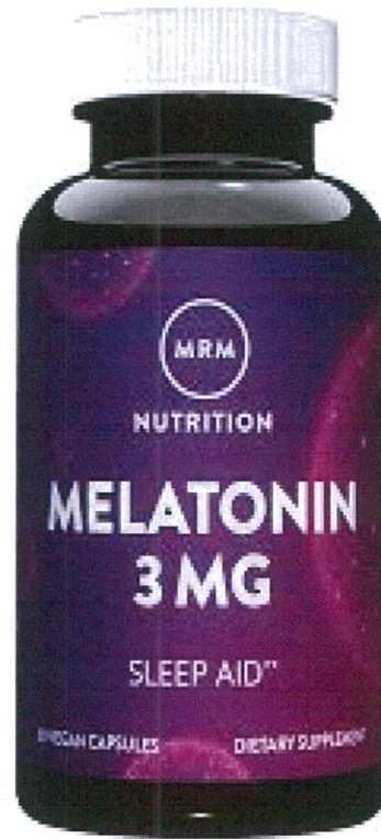
Figure 3. Unregistered MRM NUTRITION Melatonin, 3mg