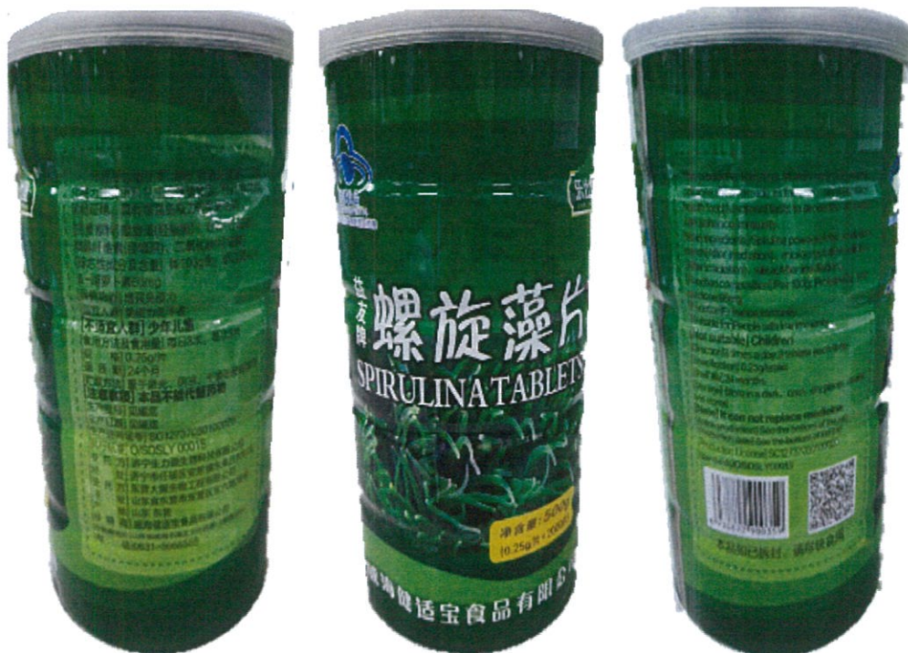
Figure 1. Unregistered (UNBRANDED) Spirulina Tablets

The Food and Drug Administration (FDA) warns all healthcare professionals and the general public NOT TO PURCHASE AND CONSUME the following unregistered food supplements and food products: