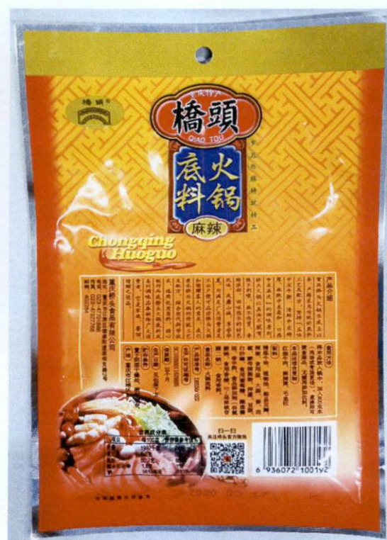
Figure 5. Unregistered QIAO TUO CHONGQING HUOGUO Food in Red and Gold Packaging (In Foreign Language)