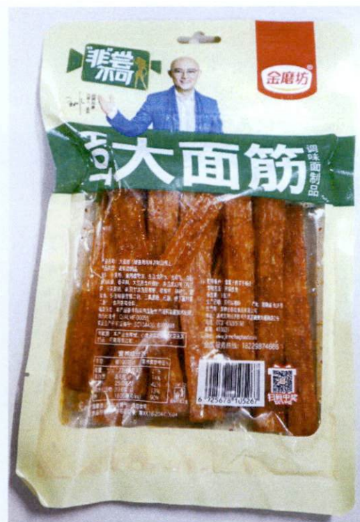
Figure 4. Unregistered LA WEI LING SHI Red Snack Stick in Light Green and Light Yellow Packaging (In Foreign Language)