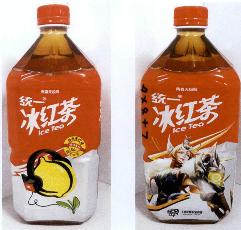
Figure 2. Unregistered Ice Tea with Lemon Image in PET Bottle (In Foreign Language)