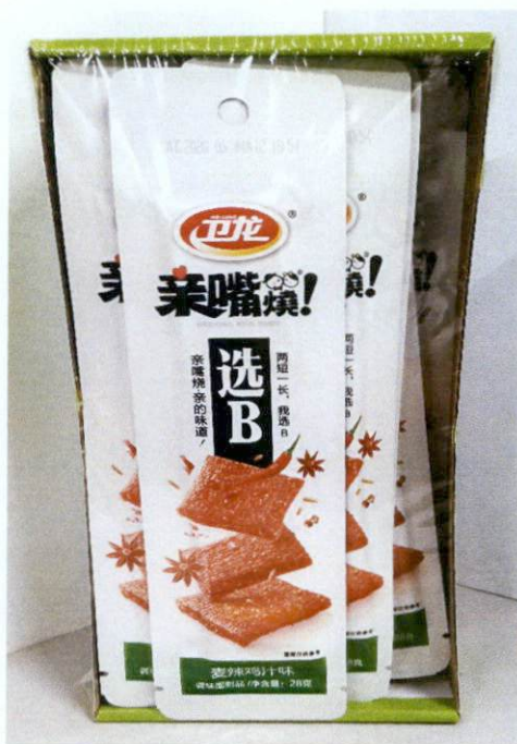
Figure 1. Unregistered WEILONG KISS BURN B Spicy Dried Tofu with Anise in White and Green Carton Packaging (In Foreign Language)

The Food and Drug Administration (FDA) warns all healthcare professionals and the general public NOT TO PURCHASE AND CONSUME the following unregistered food products: