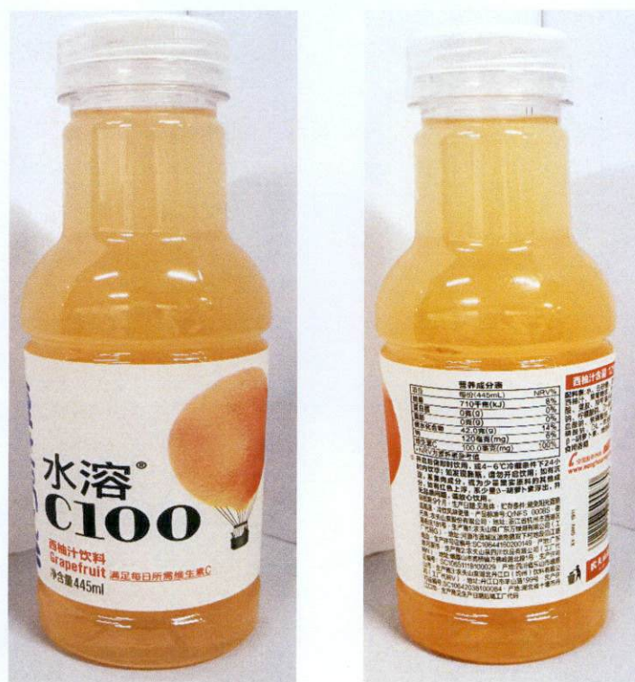
Figure 3. Unregistered C100 Grapefruit Drink PET Bottle (In Foreign Language)