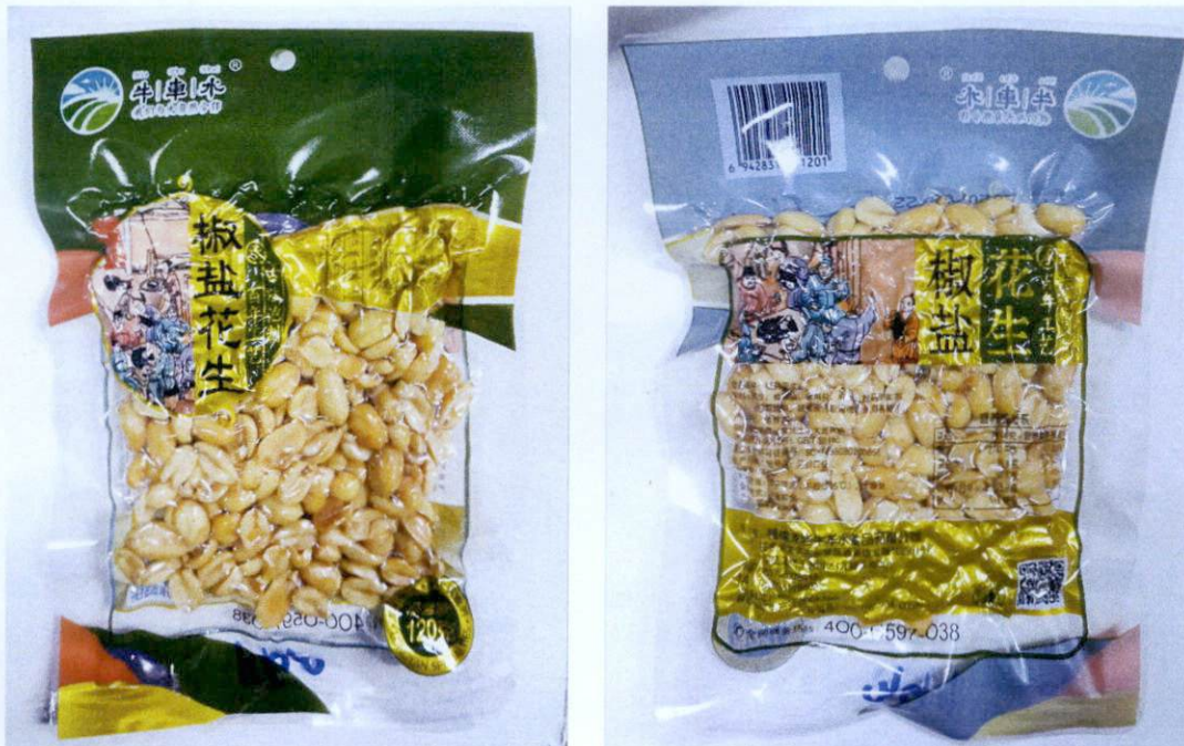
Figure 1. Unregistered NIU CHE SHUI Nuts in Yellow and Green Packaging (In Foreign Language)

The Food and Drug Administration (FDA) warns all healthcare professionals and the general public NOT TO PURCHASE AND CONSUME the following unregistered food products: