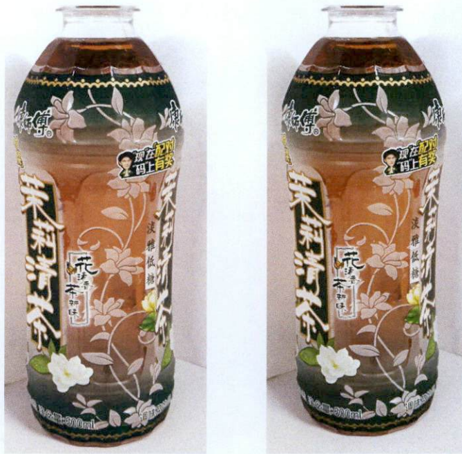
Figure 4. Unregistered Iced Tea Drink with Green and Silver Label in PET Bottle (In Foreign Language)