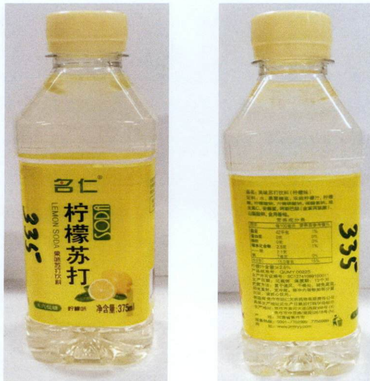
Figure 3. Unregistered MINGREN SODA Lemon Soda with Yellow Label in PET Bottle (In Foreign Language)