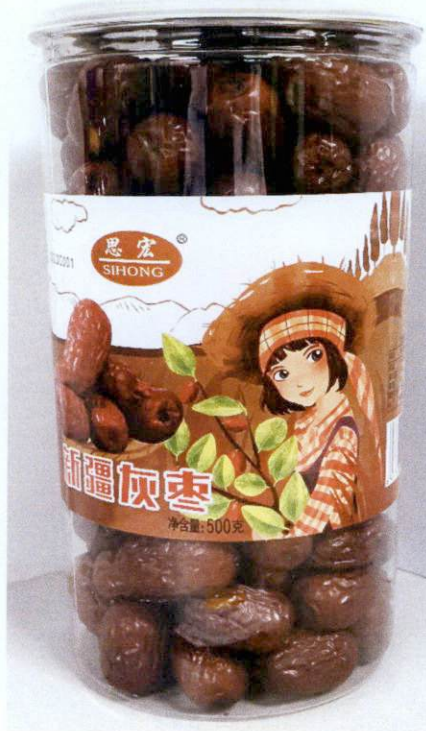
Figure 5. Unregistered SIHONG Dried Jujube with Girl Image in Clear Canister Jar (In Foreign Language)