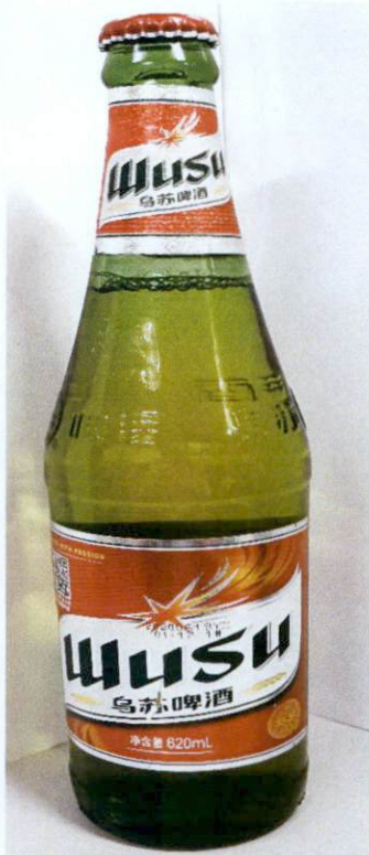
Figure 2. Unregistered WUSU Beer in Green Glass Bottle (In Foreign Language)