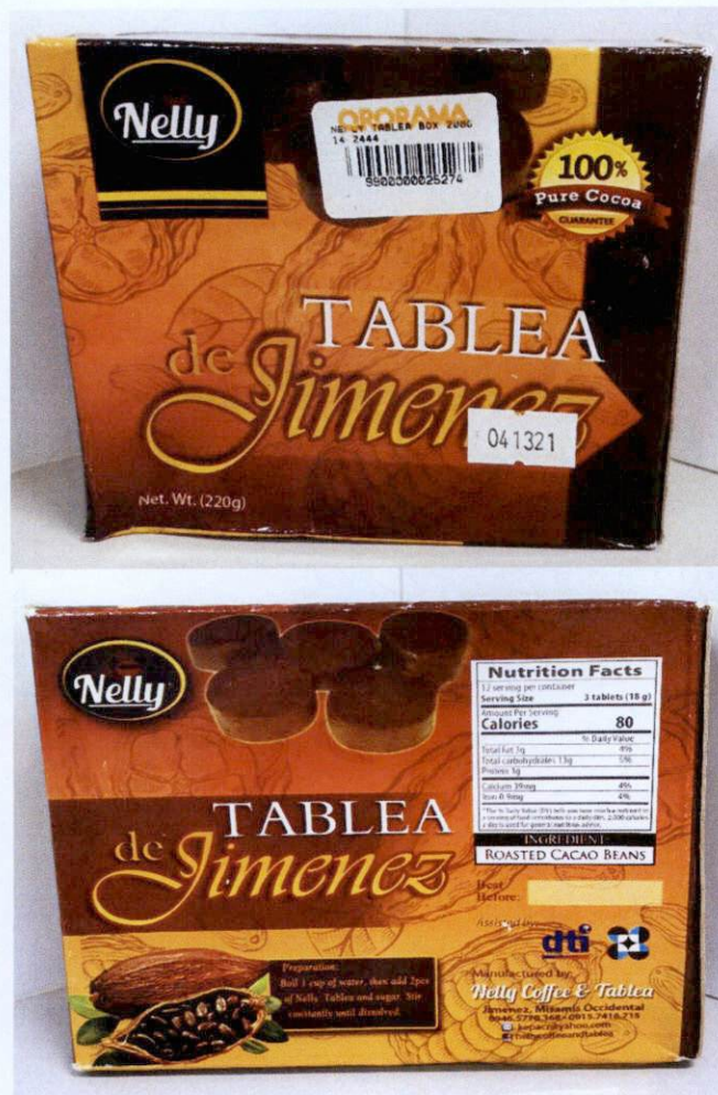
Figure 3. Unregistered NELLY Tablea de Jimenez, 220g