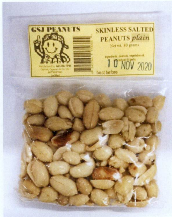
Figure 2. Unregistered GSJ PEANUTS Skinless Salted Peanuts Plain