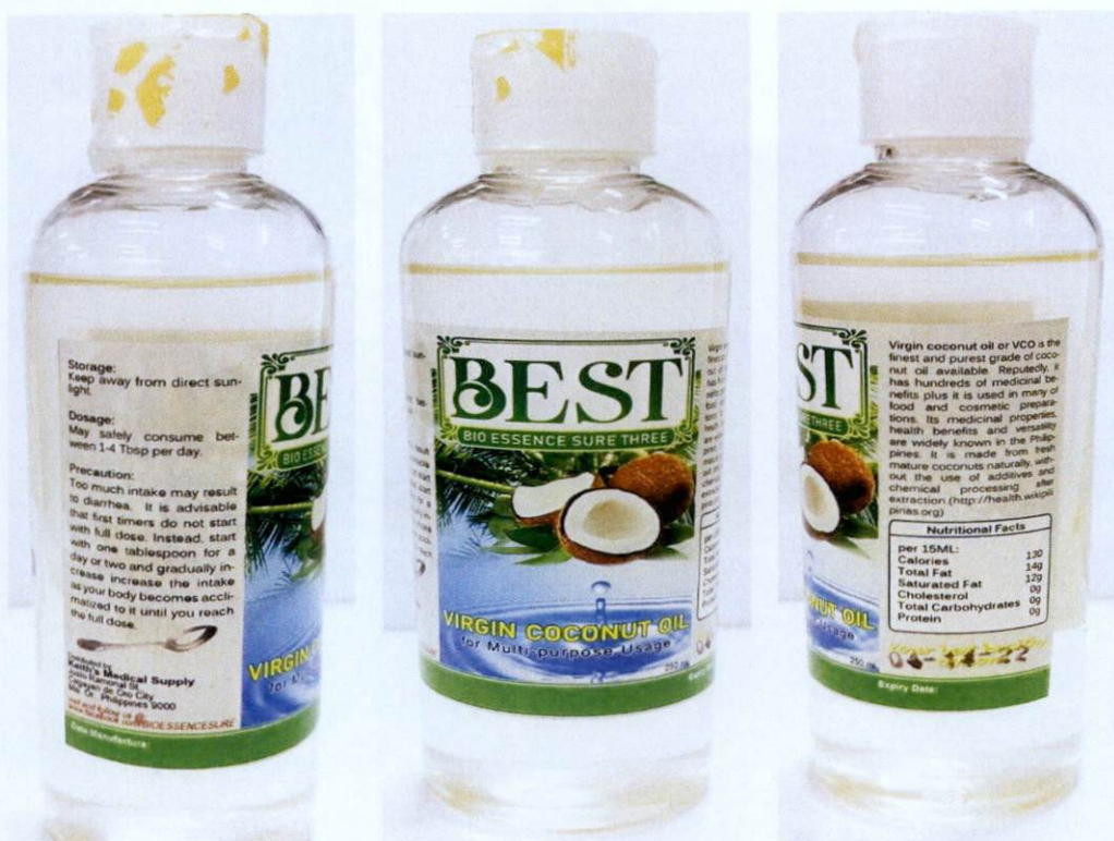
Figure 4. Unregistered BEST BIOESSENCE SURE THREE Virgin Coconut Oil, 250ml