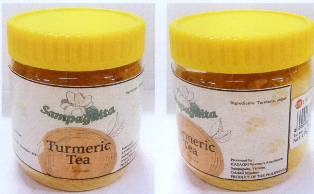
Figure 5. Unregistered SAMPAGUITA Turmeric Tea, 170g