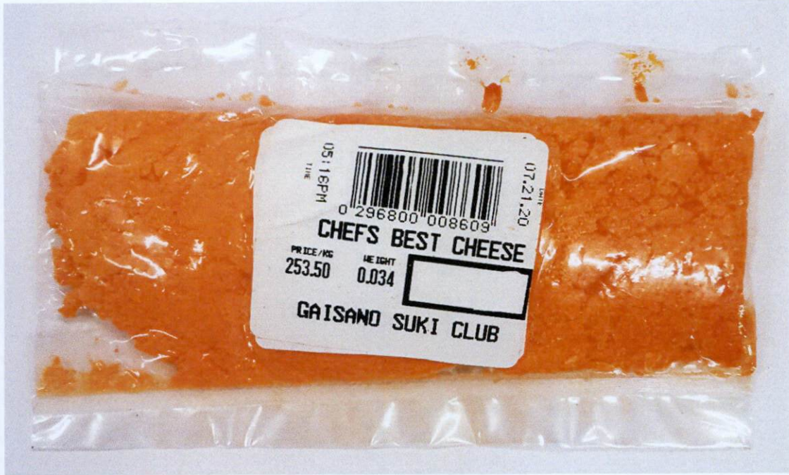
Figure 4. Unregistered CHEF'S BEST Cheese Powder