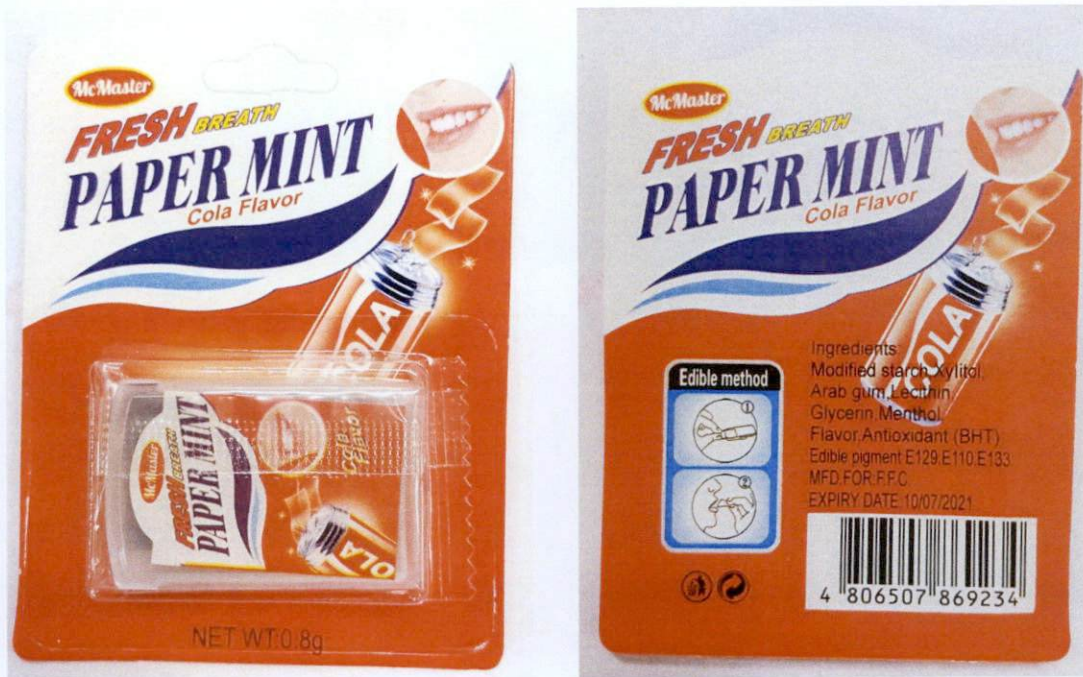
Figure 2. Unregistered MC MASTER Fresh Breath Paper Mint Cola Flavor