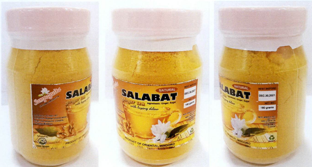
Figure 1. Unregistered SAMPAGUITA NATURAL PRODUCTS Salabat Ginger Tea, 160g

The Food and Drug Administration (FDA) warns all healthcare professionals and the general public NOT TO PURCHASE AND CONSUME the following unregistered food products: