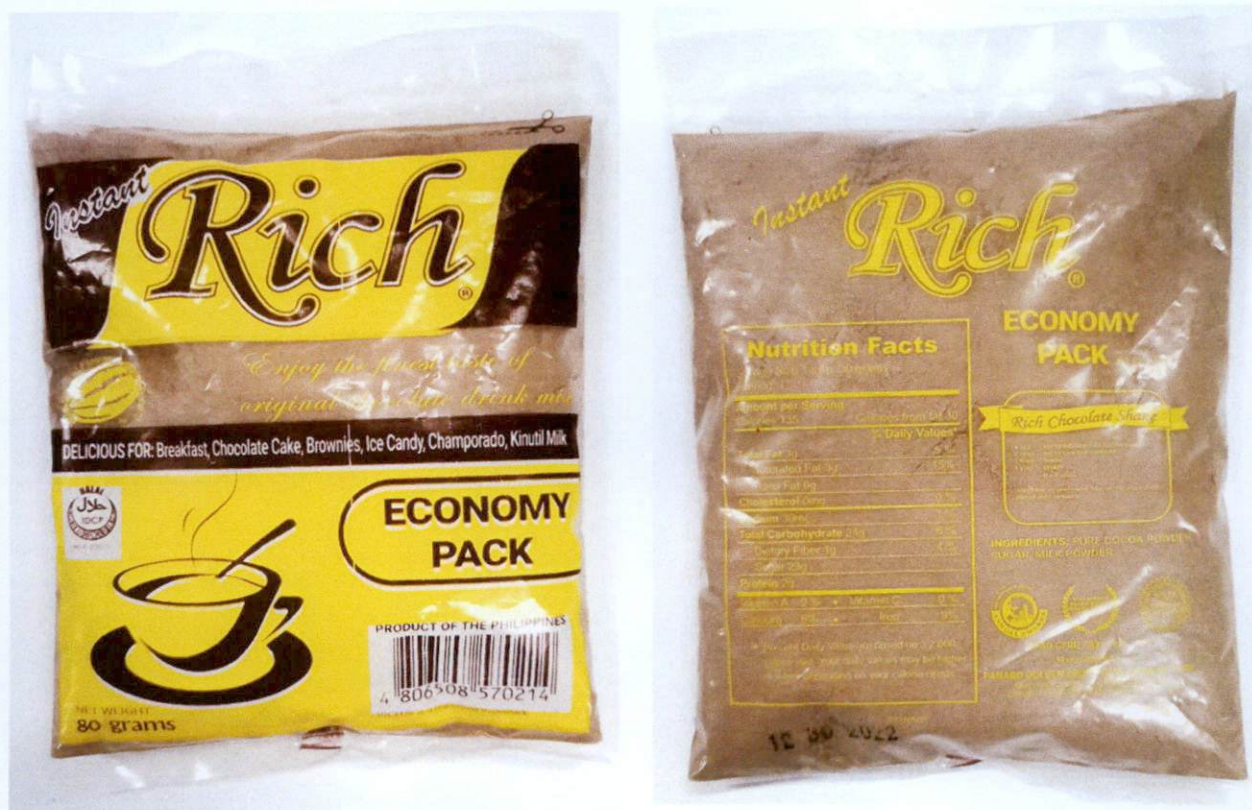
Figure 3. Unregistered RICH Cocoa Powder – Economy Pack, 80g