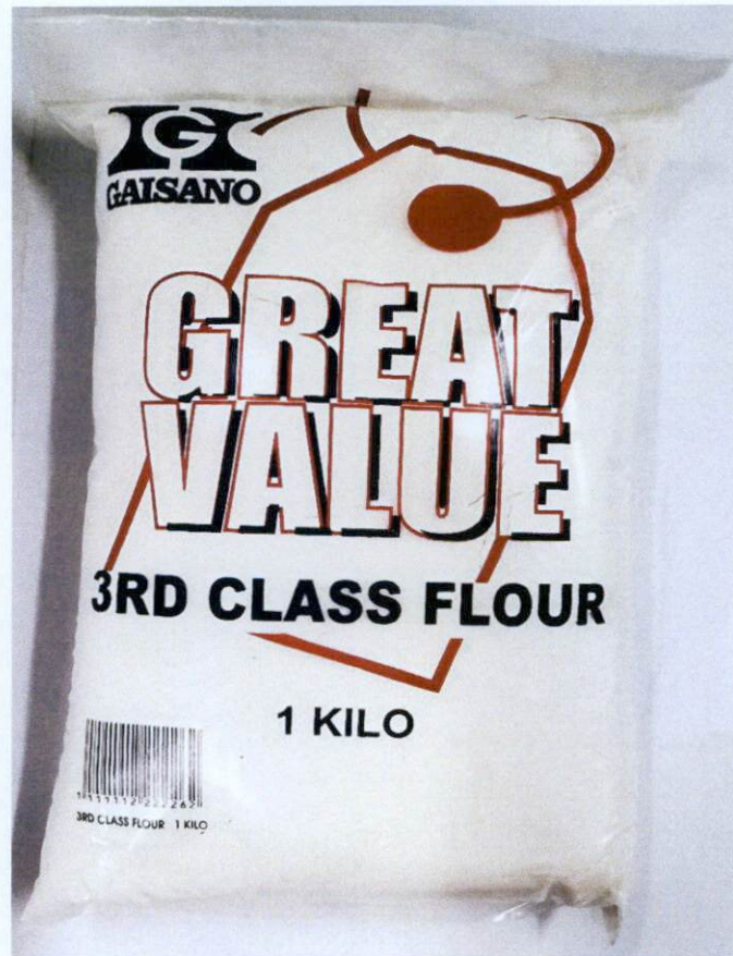
Figure 5. Unregistered GAISANO GREAT VALUE 3rd Class Flour