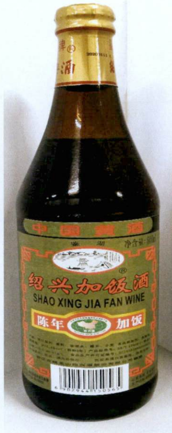
Figure 4. Unregistered SHAO XING JIA FAN Wine in Amber Bottle (In Foreign Language)

The FDA verified through post-marketing surveillance that the abovementioned food products are not registered and no corresponding Certificates of Product Registration (CPR) have been issued. Pursuant to the Republic Act No. 9711, otherwise known as the “Food and Drug Administration Act of 2009”, the manufacture, importation, exportation, sale, offering for sale, distribution, transfer, non-consumer use, promotion, advertising or sponsorship of health products without the proper authorization is prohibited.