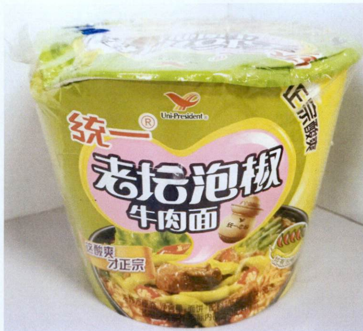
Figure 3. Unregistered UNI-PRESIDENT Instant Cup Noodles in Moss Green Packaging (In Foreign Language)