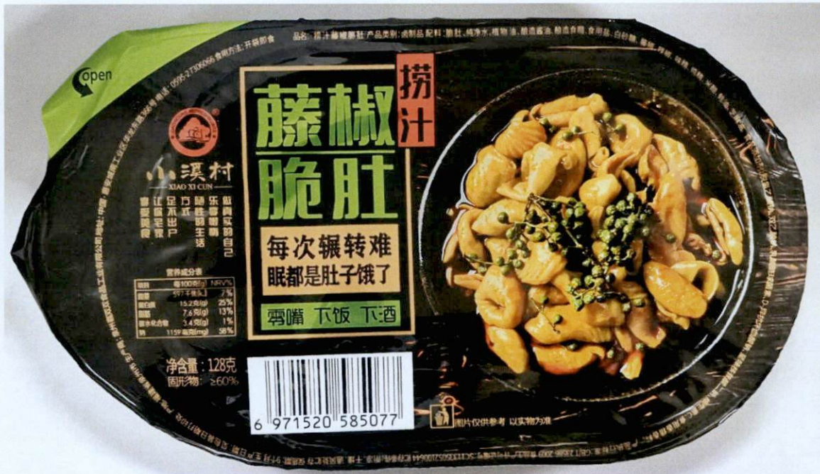
Figure 1. Unregistered Instant Food Pack in Black and Light Green Container Tub (In Foreign Language)

The Food and Drug Administration (FDA) warns all healthcare professionals and the general public NOT TO PURCHASE AND CONSUME the following unregistered food products: