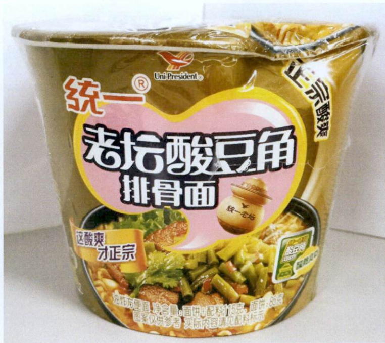
Figure 2. Unregistered UNI-PRESIDENT Instant Cup Noodles in Gold Packaging (In Foreign Language)