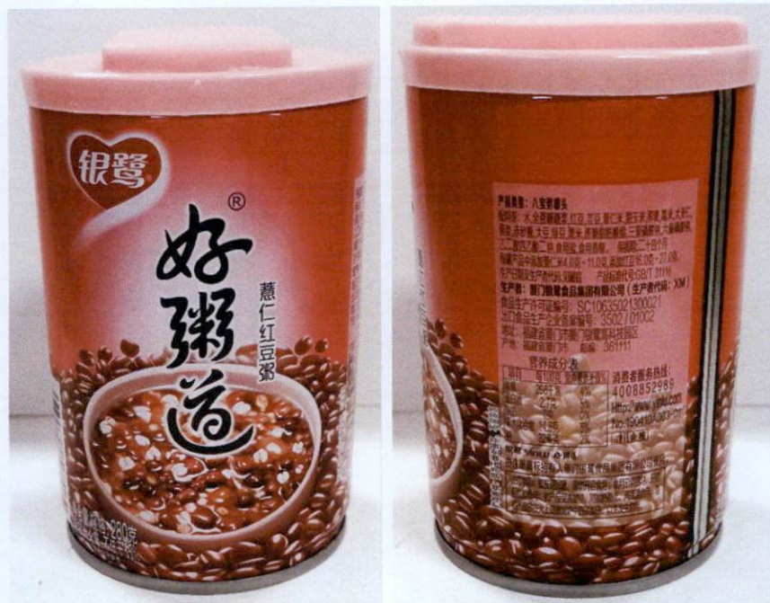
Figure 1. Unregistered Preserved Beans in Pink Tin Can Container (In Foreign Language)

The Food and Drug Administration (FDA) warns all healthcare professionals and the general public NOT TO PURCHASE AND CONSUME the following unregistered food products: