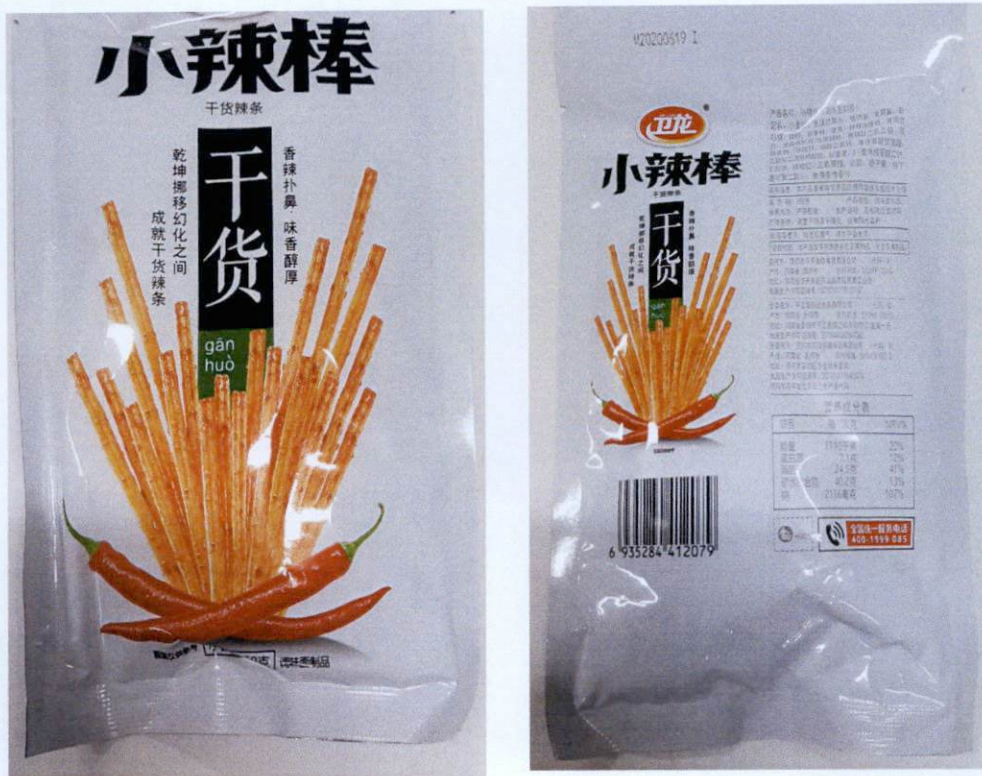
Figure 5. Unregistered WEI-LONG GAN HUO Spicy Snack in White Packaging (In Foreign Language)