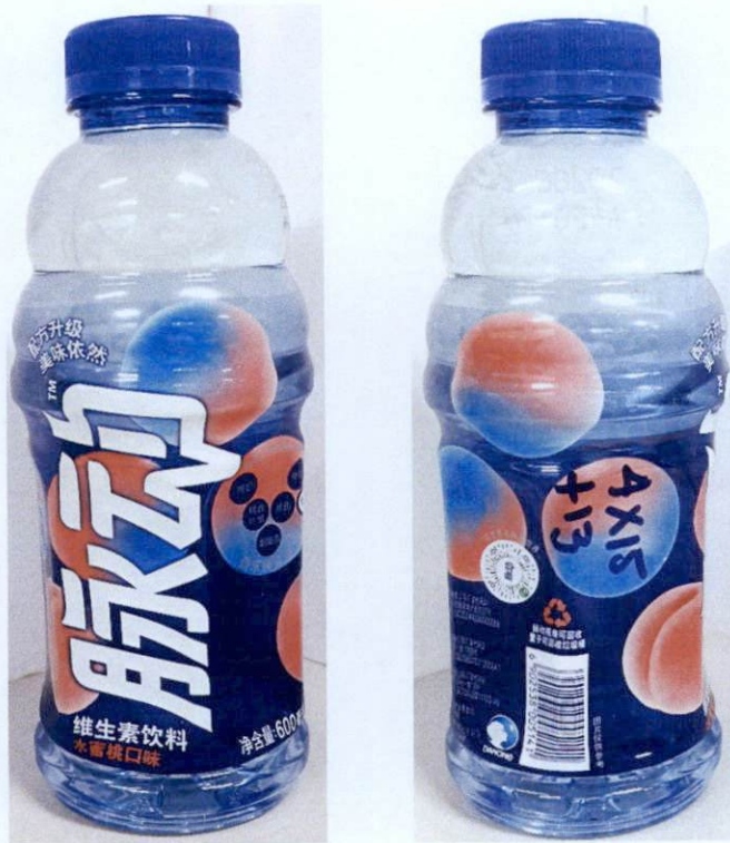
Figure 2. Unregistered LIVE ENHANCE Drink with Light Pink and Blue PET Bottle (In Foreign Language)