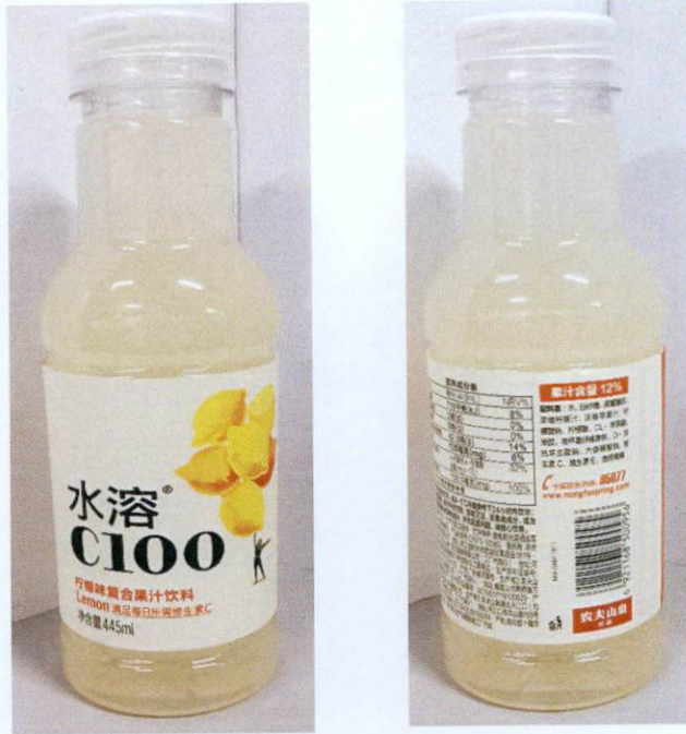
Figure 4. Unregistered C100 Lemon Drink in PET Bottle (In Foreign Language)