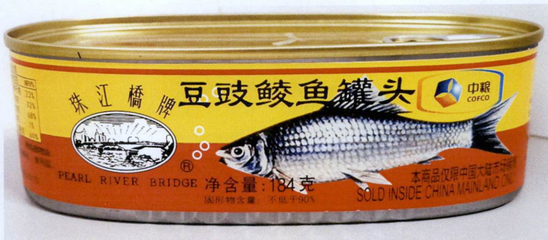
Figure 3. Unregistered PEARL RIVER BRIDGE Preserved Fish in Tin Can (Foreign Language)