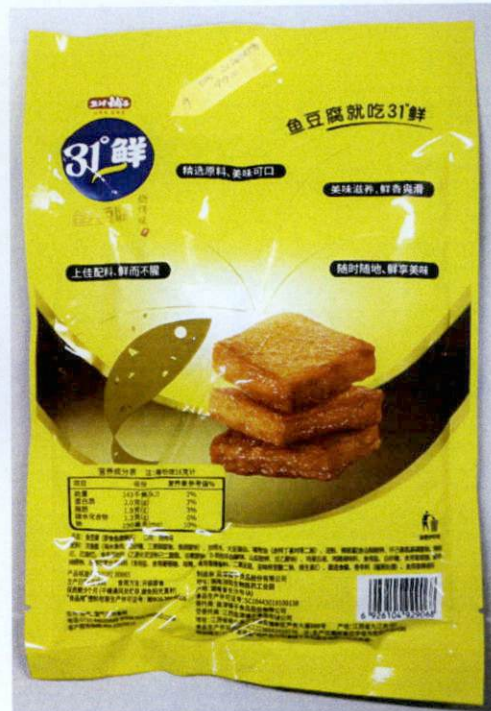
Figure 3. Unregistered 31° Preserved Fish Tofu with Fish Image in Yellow and Gold Packaging (In Foreign Language)