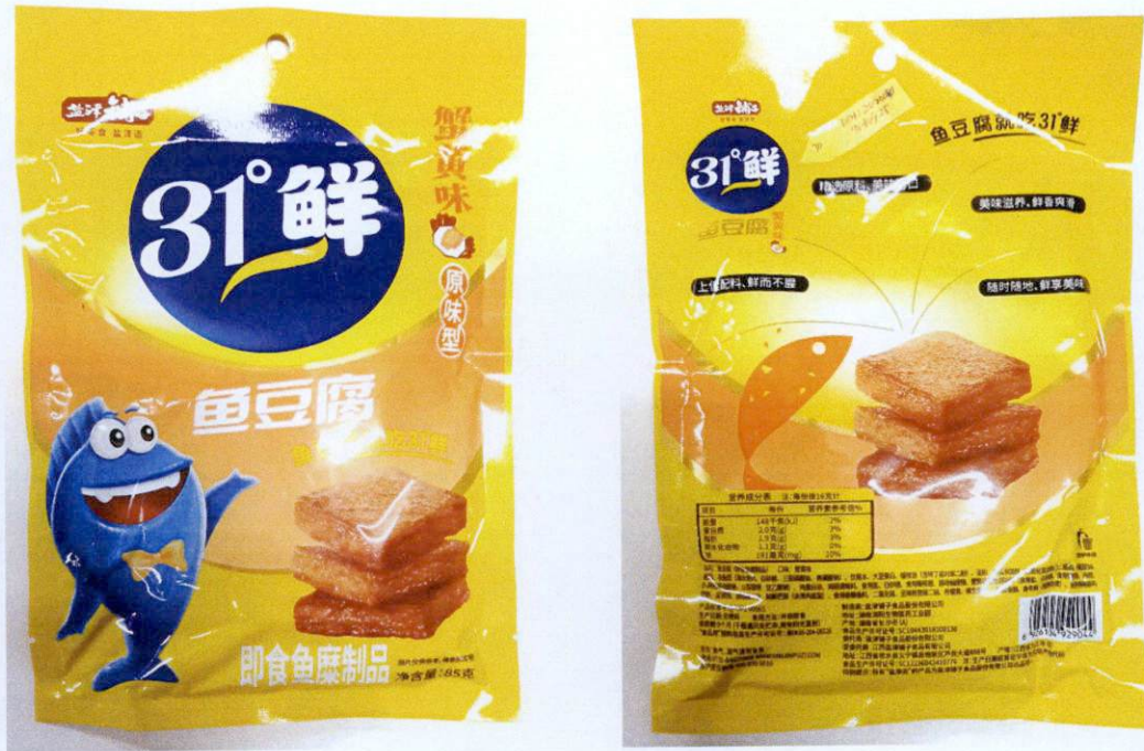
Figure 4. Unregistered 31° Preserved Fish Tofu with Fish Image in Yellow and Orange Packaging (In Foreign Language)