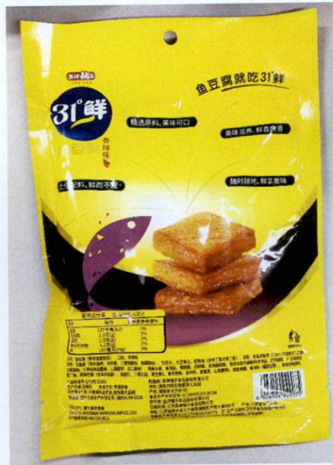
Figure 2. Unregistered 31° Preserved Fish Tofu with Fish Image in Yellow and Violet Packaging (In Foreign Language)