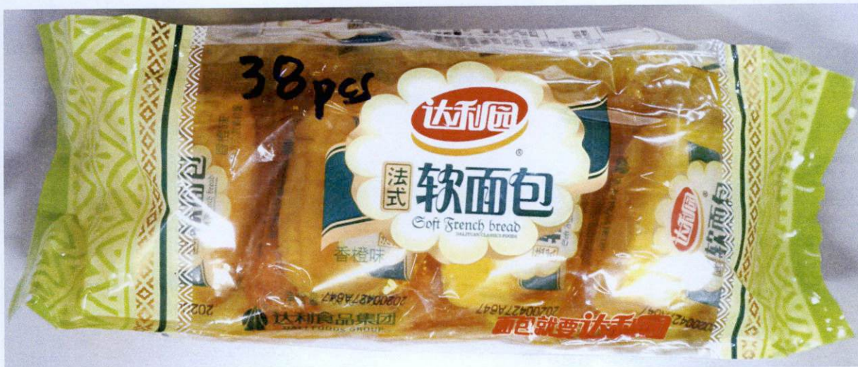
Figure 5. Unregistered DALIYUAN CLASSIC FOODS Soft French Bread (In Foreign Language)

The FDA verified through post-marketing surveillance that the abovementioned food products are not registered and no corresponding Certificates of Product Registration (CPR) have been issued. Pursuant to the Republic Act No. 9711, otherwise known as the “Food and Drug Administration Act of 2009”, the manufacture, importation, exportation, sale, offering for sale,