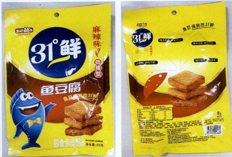
Figure 1. Unregistered 31° Preserved Fish Tofu with Fish Image in Yellow and Red Packaging (In Foreign Language)

The Food and Drug Administration (FDA) warns all healthcare professionals and the general public NOT TO PURCHASE AND CONSUME the following unregistered food products: