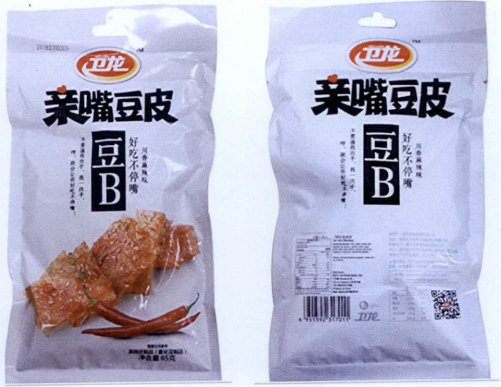
Figure 2. Unregistered WEI-LONG B Dried Tofu with Chili Image in White Package (In Foreign Language)