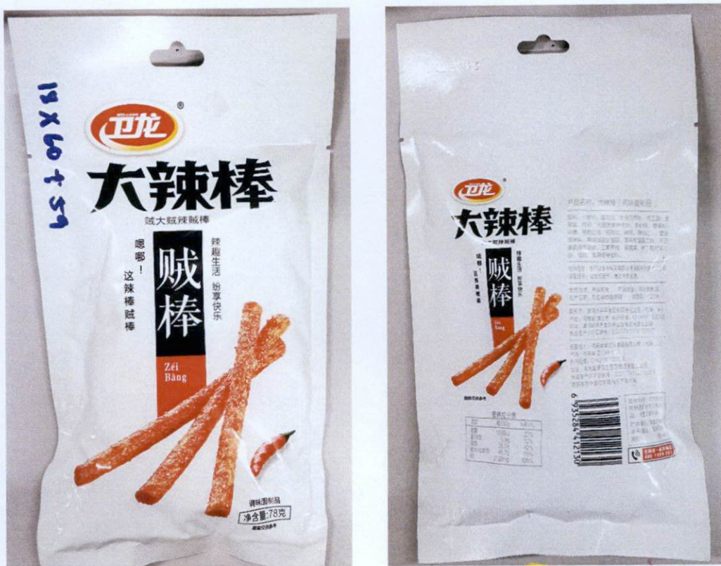
Figure 5. Unregistered WEI-LONG ZEI BANG Dried Tofu Sticks with Chili Image in White Package (In Foreign Language)