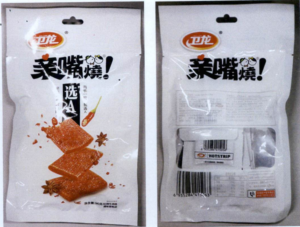
Figure 4. Unregistered WEI-LONG A Dried Tofu with Chili Image in White Package (In Foreign Language)