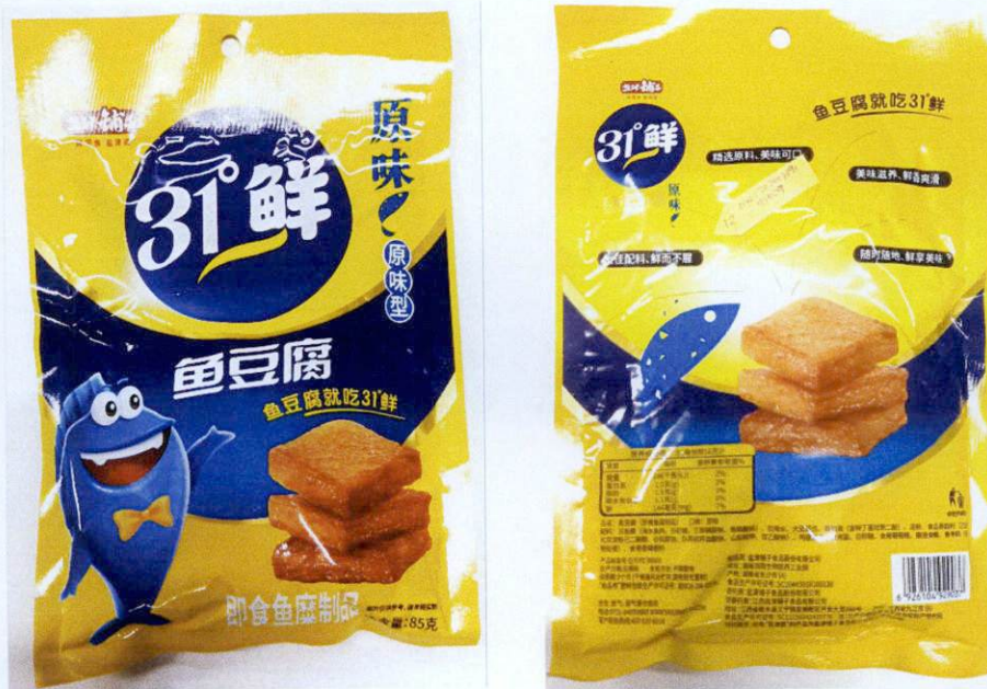
Figure 1. Unregistered 31° Preserved Fish Tofu with Fish Image in Yellow and Blue Packaging (In Foreign Language)

The Food and Drug Administration (FDA) warns all healthcare professionals and the general public NOT TO PURCHASE AND CONSUME the following unregistered food products: