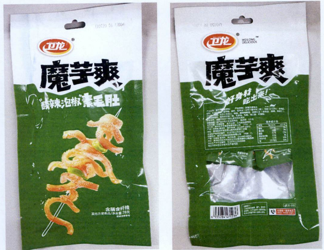
Figure 3. Unregistered WEI-LONG Strips Snack in Green and White Packaging (In Foreign Language)