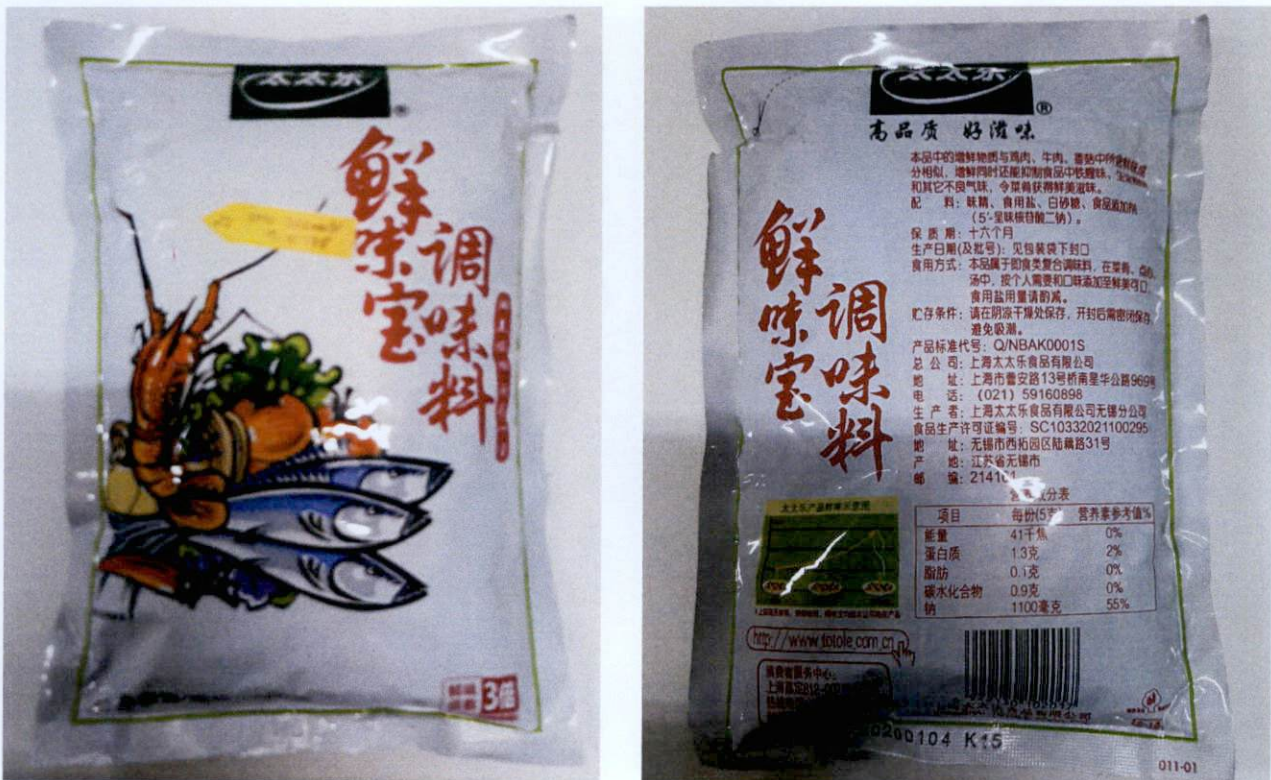
Figure 5. Unregistered Food Snack with Seafoods Image in White Packaging (In Foreign Language)