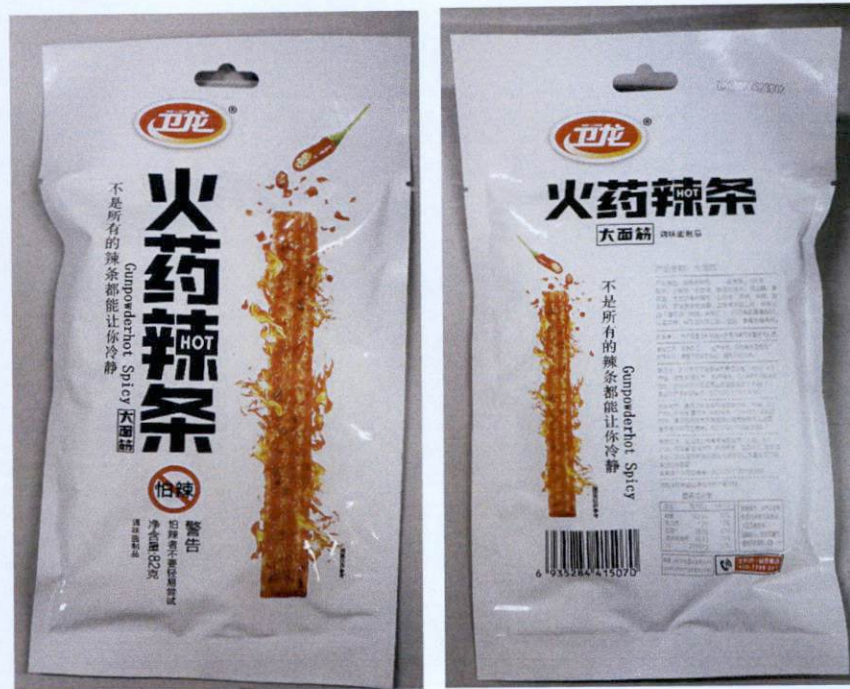
Figure 1. Unregistered WEI-LONG Gunpowderhot Spicy Dried Tofu Strips in White Packaging (In Foreign Language)

The Food and Drug Administration (FDA) warns all healthcare professionals and the general public NOT TO PURCHASE AND CONSUME the following unregistered food products: