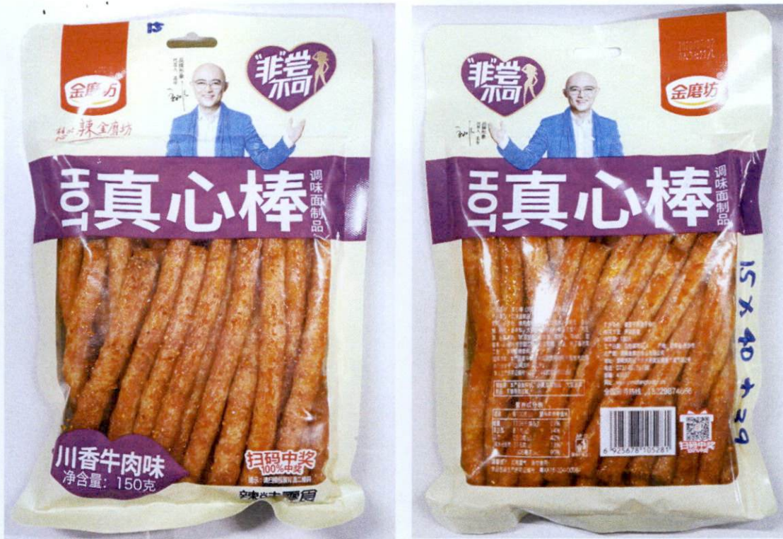
Figure 4. Unregistered LA WEI LING SHI Red Snack Stick in Violet and Light Yellow (In Foreign Language)