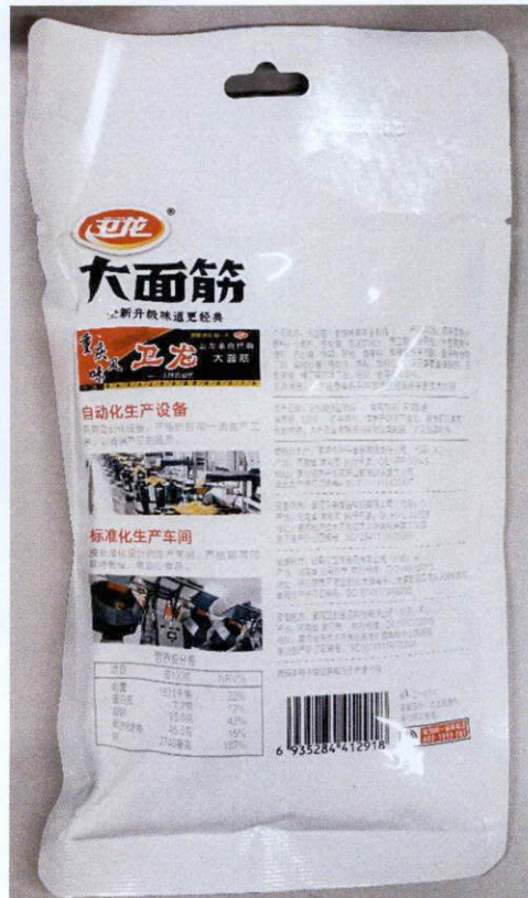
Figure 3. Unregistered WEI-LONG LENG JING Dried Tofu Strips in White Packaging (In Foreign Language)