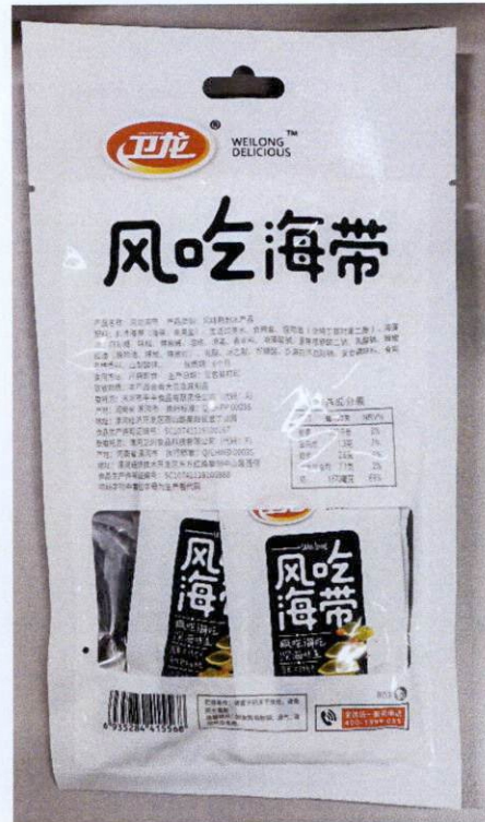
Figure 2. Unregistered WEI-LONG Green Food on Stick in Black and White Packaging (In Foreign Language)