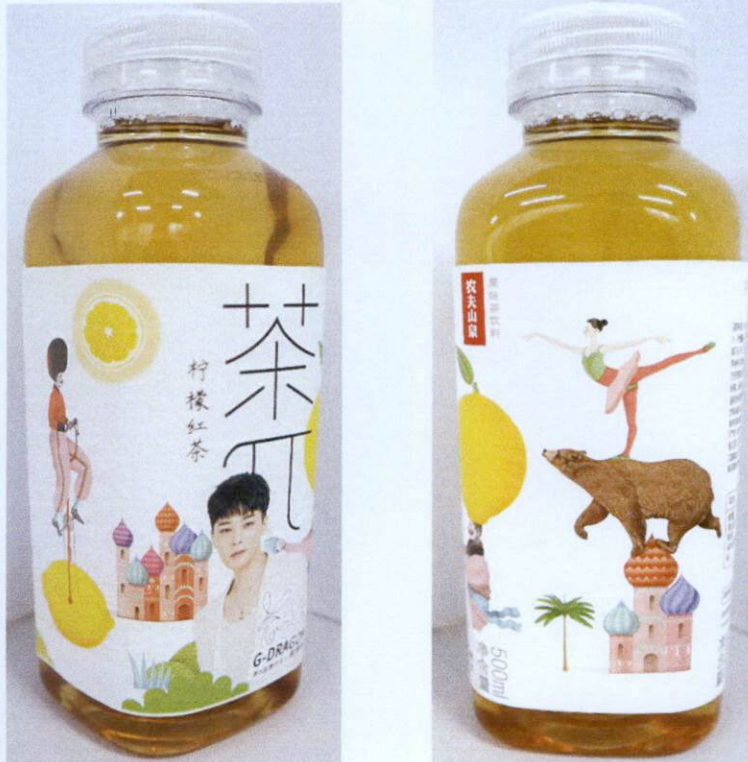
Figure 3. Unregistered Tea with Castle and G-Dragon Graphics in PET Bottle (In Foreign Language)