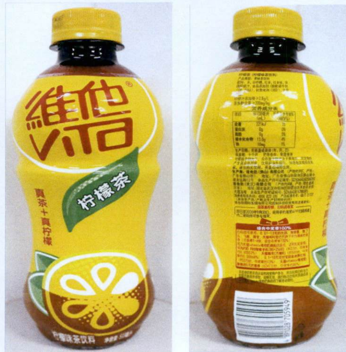
Figure 1. Unregistered VITA Lemon Tea Drink in Yellow PET Bottle (In Foreign Language)

The Food and Drug Administration (FDA) warns all healthcare professionals and the general public NOT TO PURCHASE AND CONSUME the following unregistered food products: