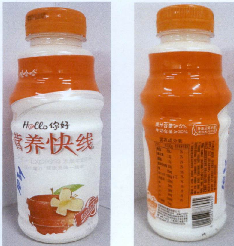
Figure 5. Unregistered NUTRI-EXPRESS Drink with Apple Image in White and Orange PET Bottle (In Foreign Language)