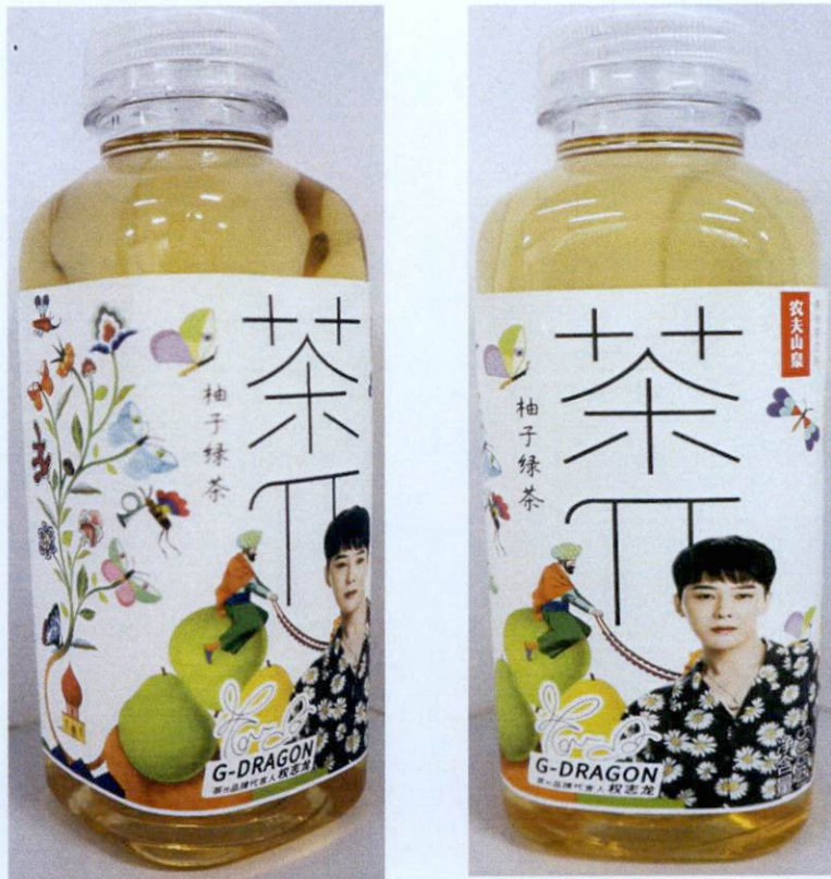
Figure 4. Unregistered Tea with Pear and G-DRAGON Graphics in PET Bottle (In Foreign Language)