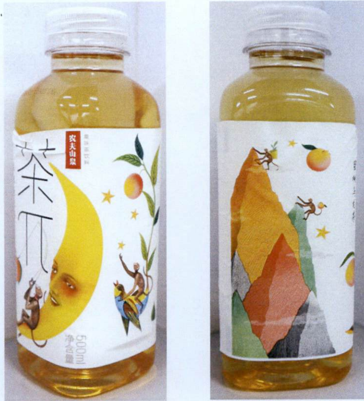
Figure 2. Unregistered Tea with Moon and Monkey Graphics in PET Bottle (In Foreign Language)