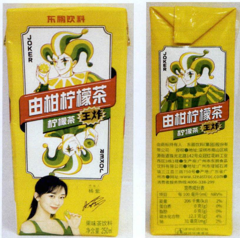
Figure 1. Unregistered Juice Drink with Joker and Girl Graphics in Yellow Tetra Brik Packaging (In Foreign Language)

The Food and Drug Administration (FDA) warns all healthcare professionals and the general public NOT TO PURCHASE AND CONSUME the following unregistered food products: