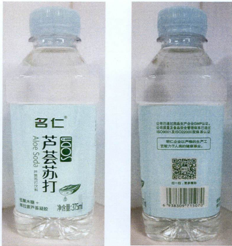
Figure 2. Unregistered Aloe Soda in Clear PET Bottle with Light Blue Label (In Foreign Language)