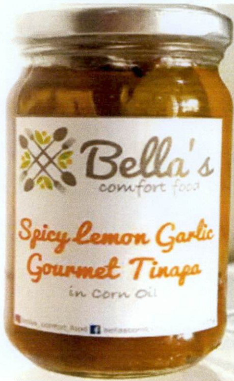
Figure 3. Unregistered BELLA'S Spicy Lemon Garlic Gourmet Tinapa