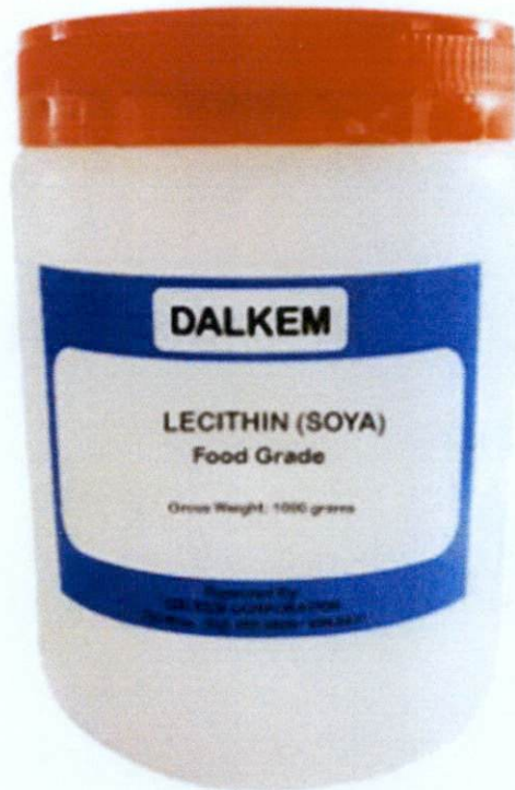
Figure 4. Unregistered DALKEM Lecithin (Soya) Food Grade

The FDA verified through post-marketing surveillance that the abovementioned food products are not registered and no corresponding Certificates of Product Registration (CPR) have been issued. Pursuant to the Republic Act No. 9711, otherwise known as the “Food and Drug Administration Act of 2009”, the manufacture, importation, exportation, sale, offering for sale, distribution, transfer, non-consumer use, promotion, advertising or sponsorship of health products without the proper authorization is prohibited.