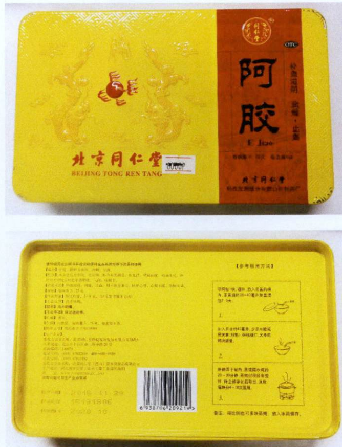
Figure 2. Unregistered OTC E JIAO BEIJING TONG REN TANG Dried Leaves in Yellow with Red Design Canister Can (In Foreign Language)