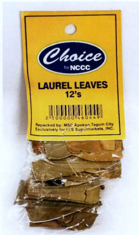
Figure 4. Unregistered CHOICE BY NCCC Laurel Leaves