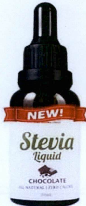
Figure 3. Unregistered NUTRIFINDS Stevia Liquid – Chocolate