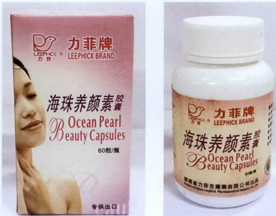
Figure 5. Unregistered LIEPHICK BRAND Ocean Pearl Beauty Capsules