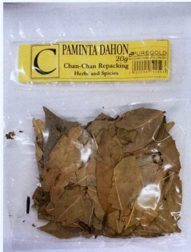
Figure 1. Unregistered C Paminta Dahon, 20g

The Food and Drug Administration (FDA) warns all healthcare professionals and the general public NOT TO PURCHASE AND CONSUME the following unregistered food products: