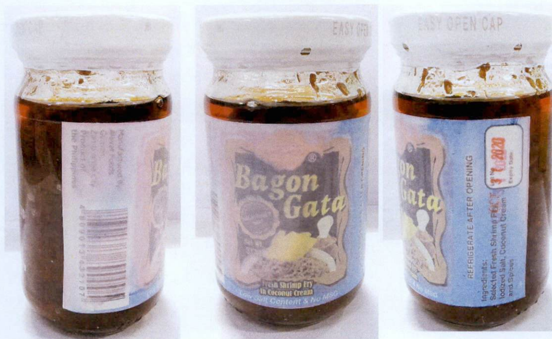
Figure 5. Unregistered ALAVAR BAGON GATA Fresh Shrimp Fry in Coconut Cream