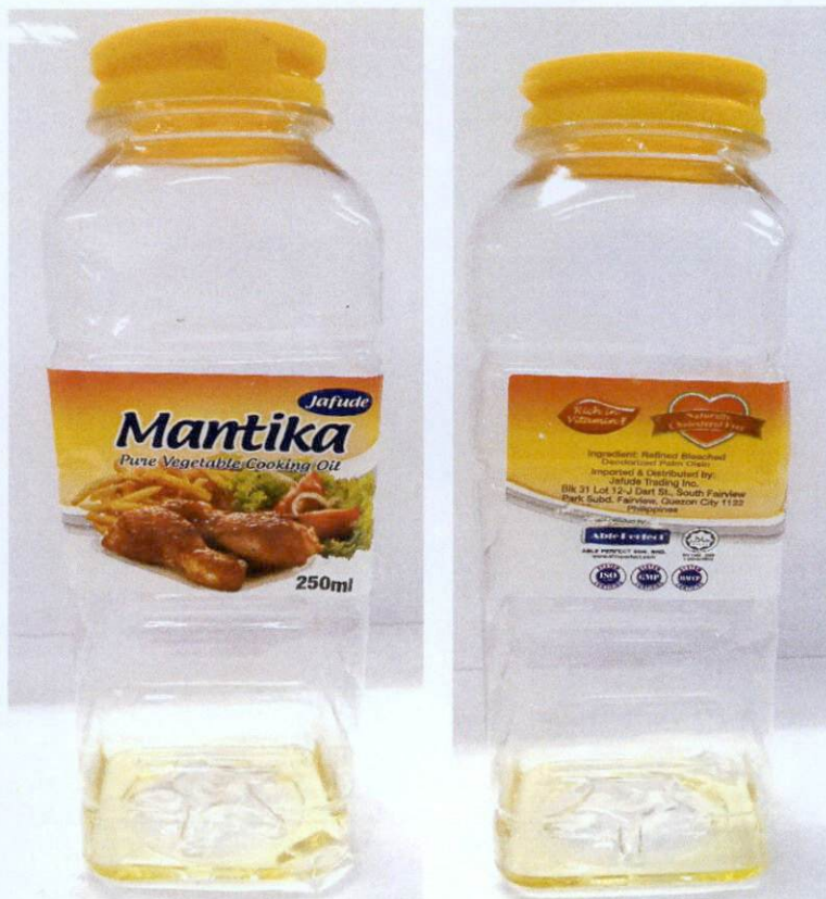
Figure 3. Unregistered JAFUDE MANTIKA Pure Vegetable Cooking Oil