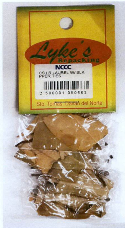
Figure 2. Unregistered LYKE'S REPACKING CS Laurel Leaves with Black Pepper Ties