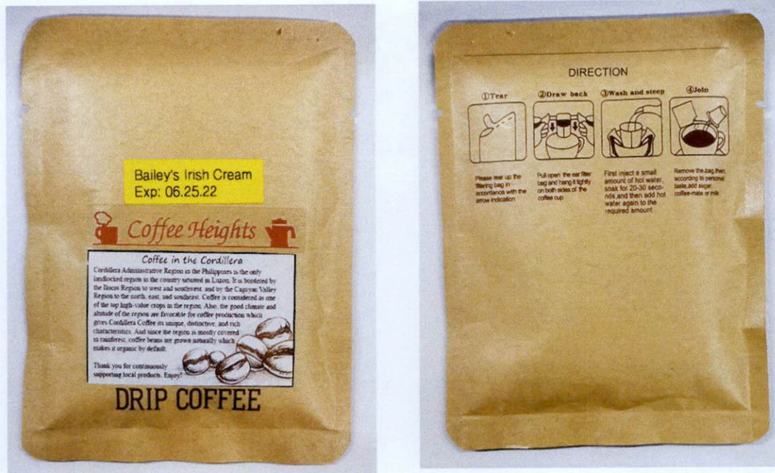
Figure 4. Unregistered COFFEE HEIGHTS Drip Coffee – Bailey’s Irish Cream