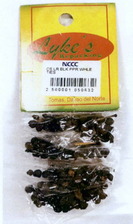
Figure 1. Unregistered LYKE'S REPACKING Black Peppercorn Whole

The Food and Drug Administration (FDA) warns all healthcare professionals and the general public NOT TO PURCHASE AND CONSUME the following unregistered food products: