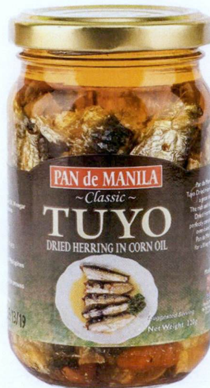
Figure 1. Unregistered PAN DE MANILA Classic Tuyo in Corn Oil

The Food and Drug Administration (FDA) warns all healthcare professionals and the general public NOT TO PURCHASE AND CONSUME the following unregistered food products: