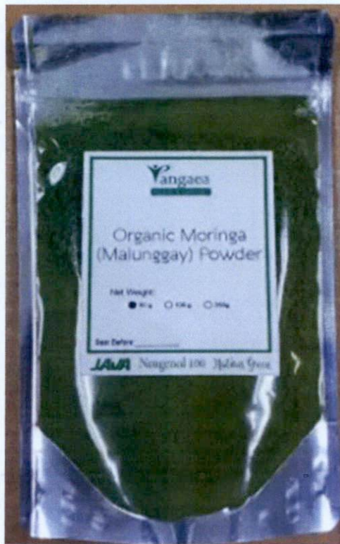
Figure 5. Unregistered PANGAEA HEALTH AND WELLNESS Organic Moringa (Malunggay) Powder