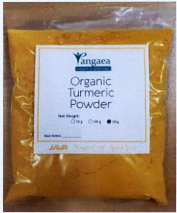
Figure 3. Unregistered PANGAEA HEALTH AND WELLNESS Organic Turmeric Powder