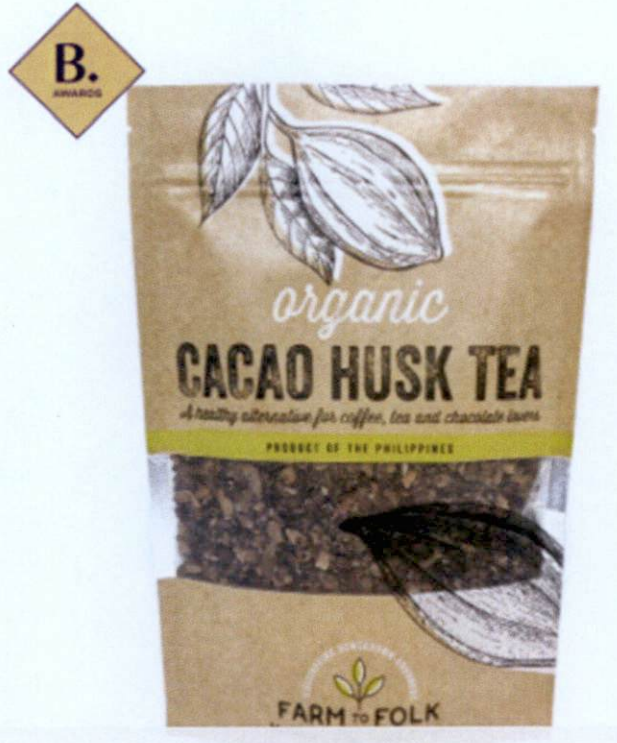
Figure 4. Unregistered FARM TO FOLK Organic Cacao Husk Tea