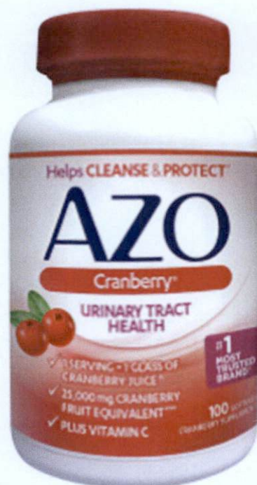
Figure 5. Unregistered AZO Cranberry Urinary Tract Health Dietary Supplement