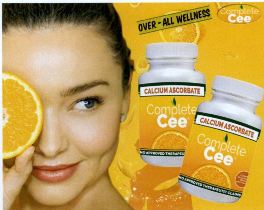
Figure 2. Unregistered COMPLETE CEE Calcium Ascorbate