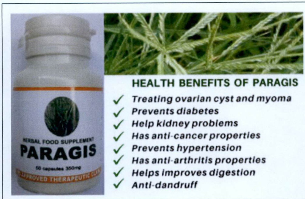
Figure 4. Unregistered Paragis Herbal Capsule