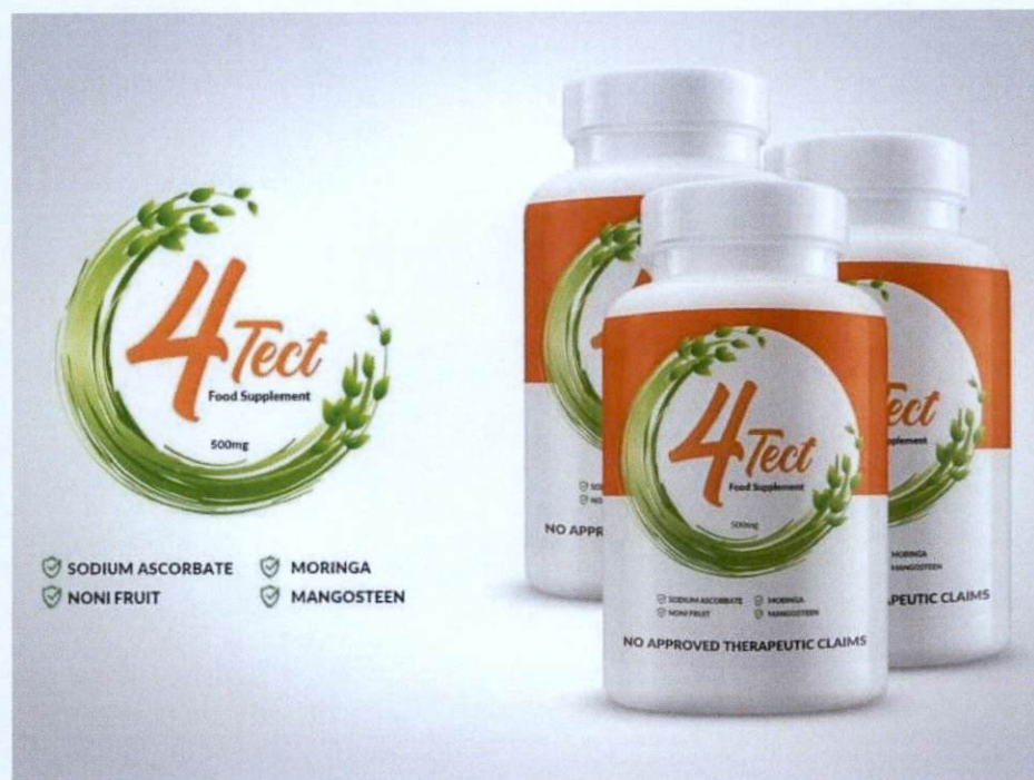
Figure 3. Unregistered 4TECT Food Supplement